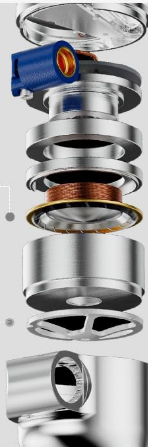
Image: Diagram illustrating the Magnalium diaphragm, DLC gasket driver, W-shaped gasket, and frontal acoustic prism for high-frequency performance.

Adaptive phase adjustment, enhanced high frequency diffusion