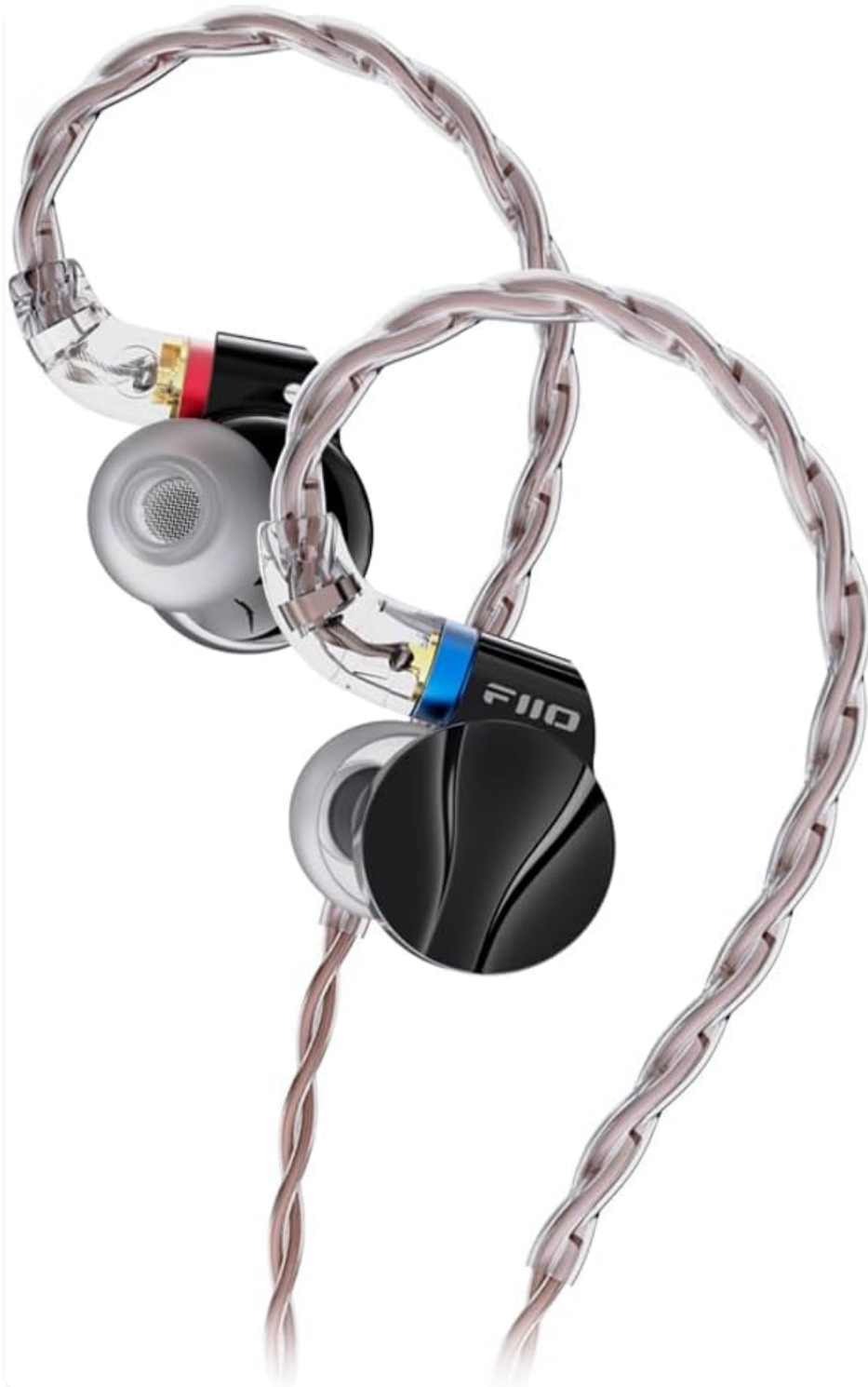
Image: FiiO FD15 in-ear earphones with their detachable cable connected.