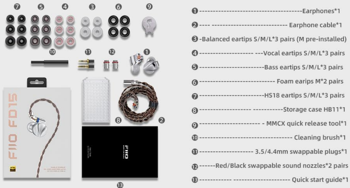
Image: Visual representation of all included parts and accessories for the FiiO FD15 earphones.