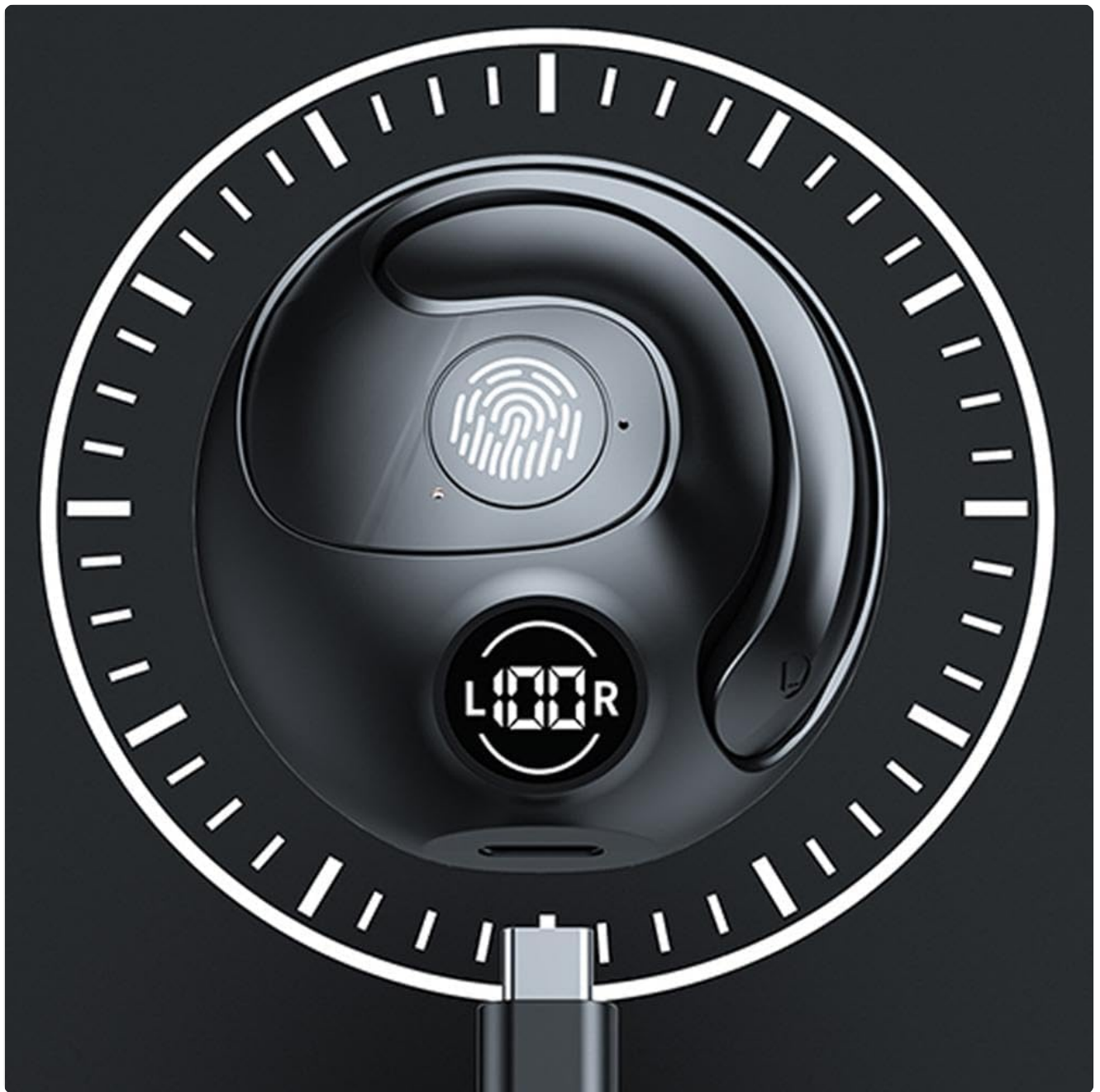
Image: A close-up of the black charging case, highlighting the digital display that shows battery percentage and charging status, with a USB-C cable connected.