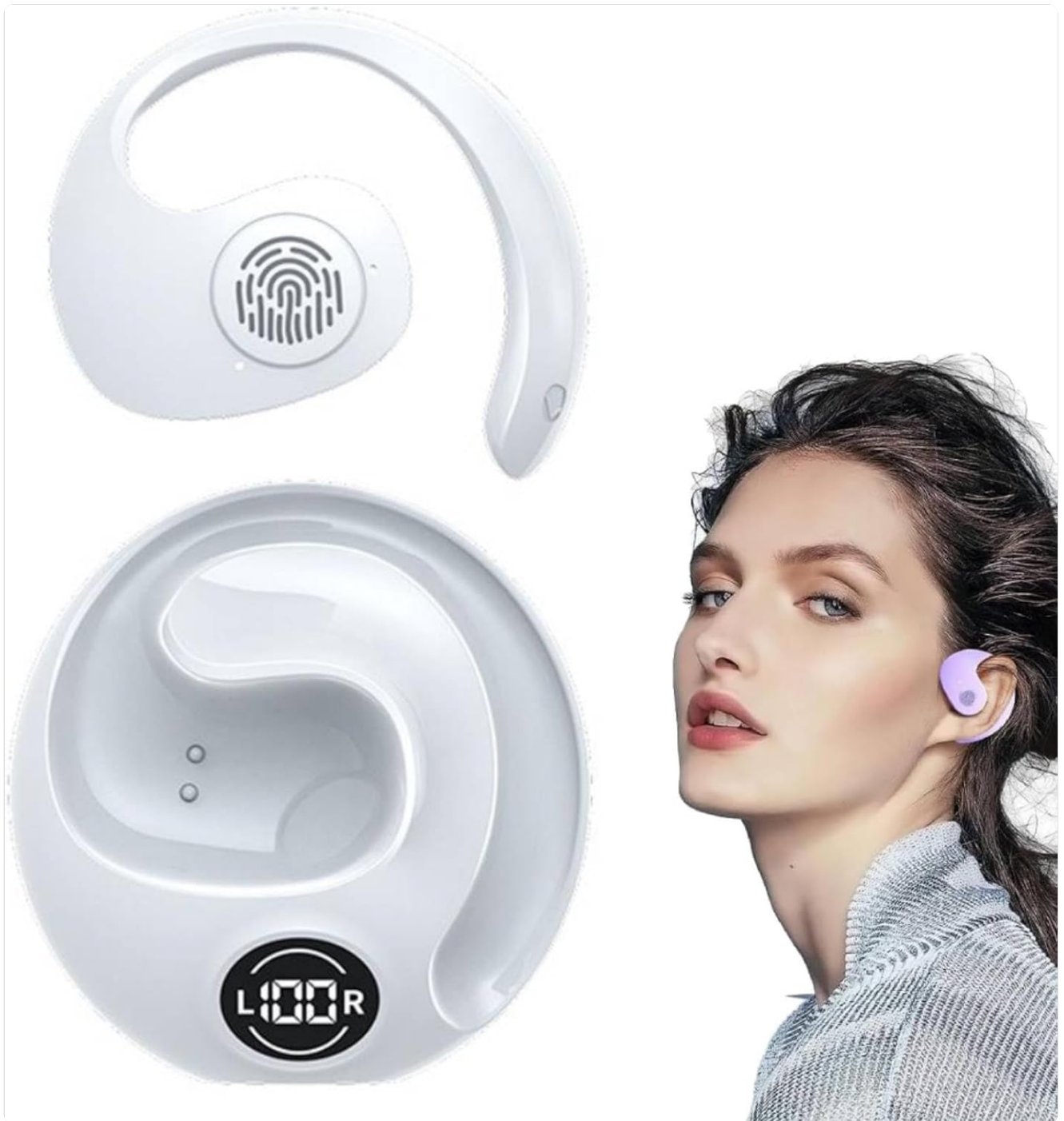
Image: The Hy-T26 X15 Pro earphones (white) and their charging case, with a model wearing one earphone.