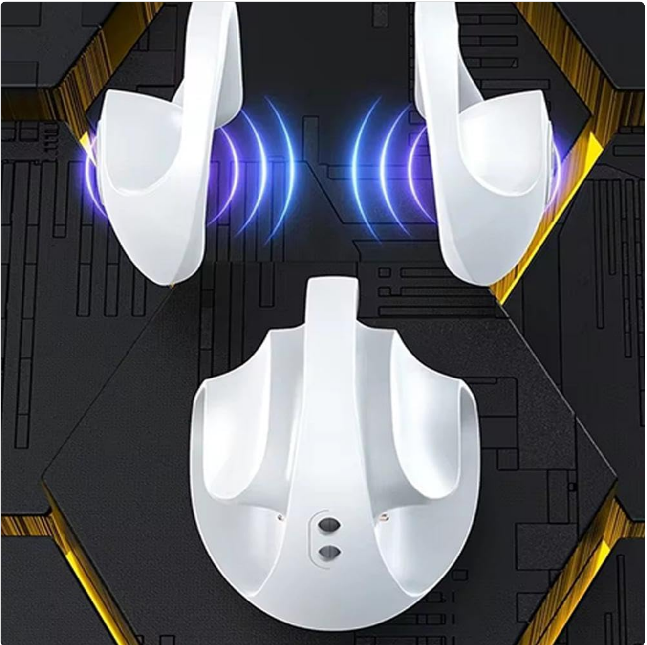
Image: The white Hy-T26 X15 Pro earbuds being placed into their charging case, demonstrating the magnetic connection points for charging.