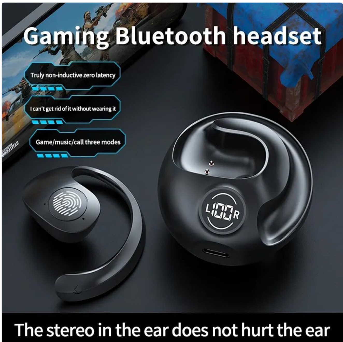
Image: The black Hy-T26 X15 Pro earphones and case, highlighting features like "Truly non-inductive zero latency" for gaming, and "Game/music/call three modes."