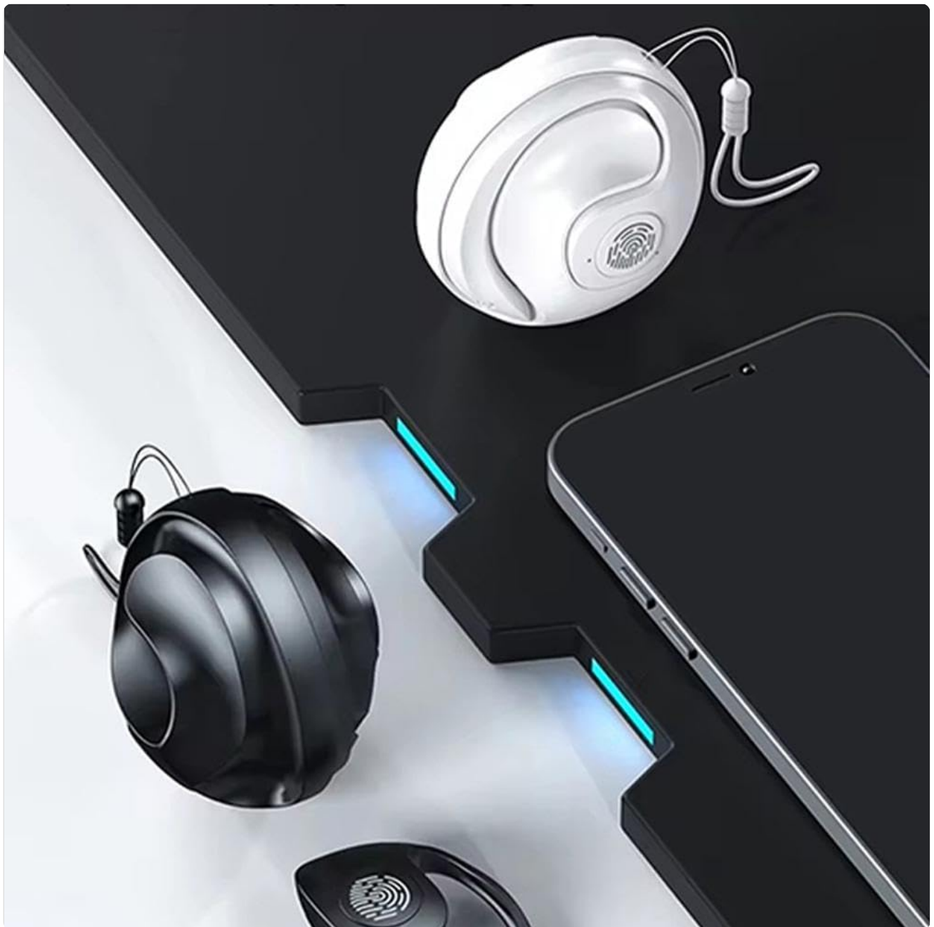
Image: Both black and white versions of the Hy-T26 X15 Pro earphones and their charging cases, alongside a smartphone, illustrating their compact design.