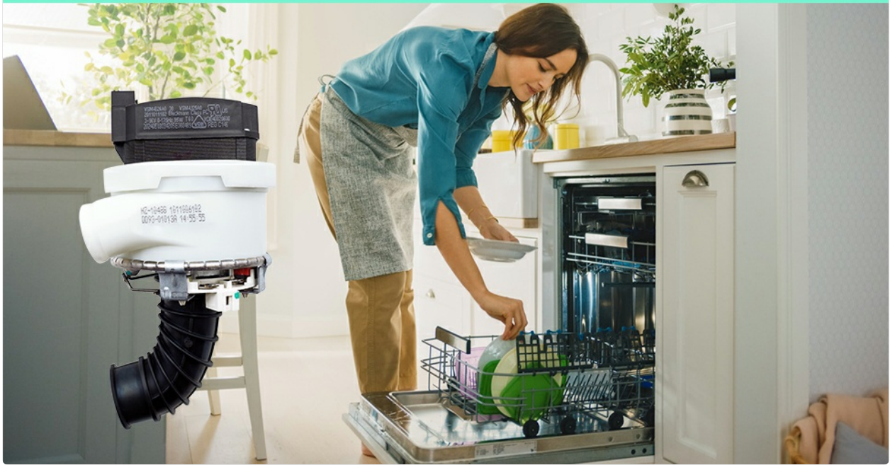
Image 5: Common dishwasher issues that can be resolved by replacing the drain pump.