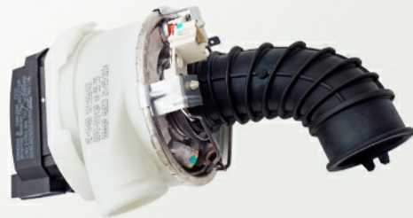
Image 3: Visual representation of compatible Samsung dishwasher models.