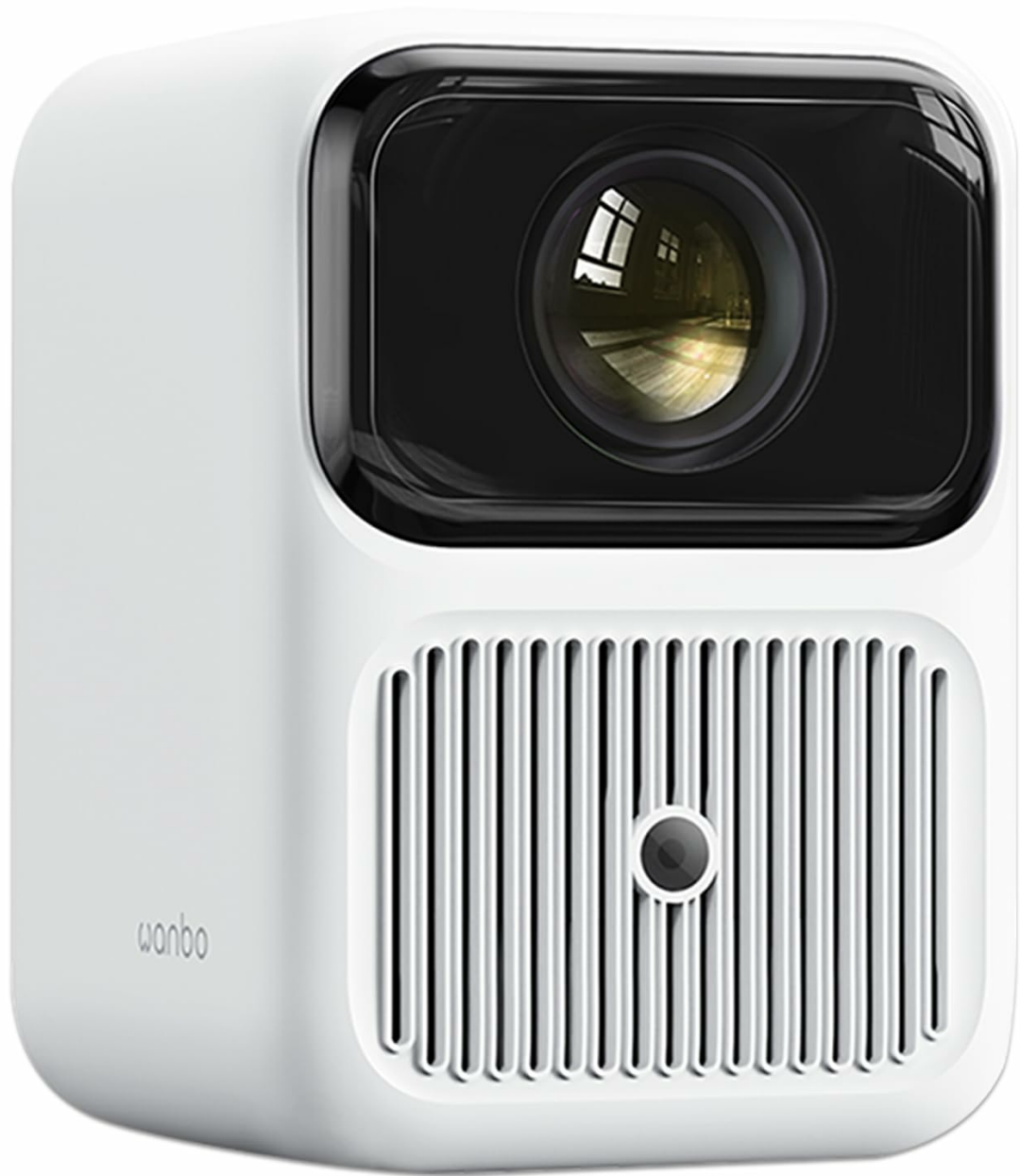
Figure 3.1: Front view of the WANBO Dali 1 Projector, showcasing its compact white design and lens.