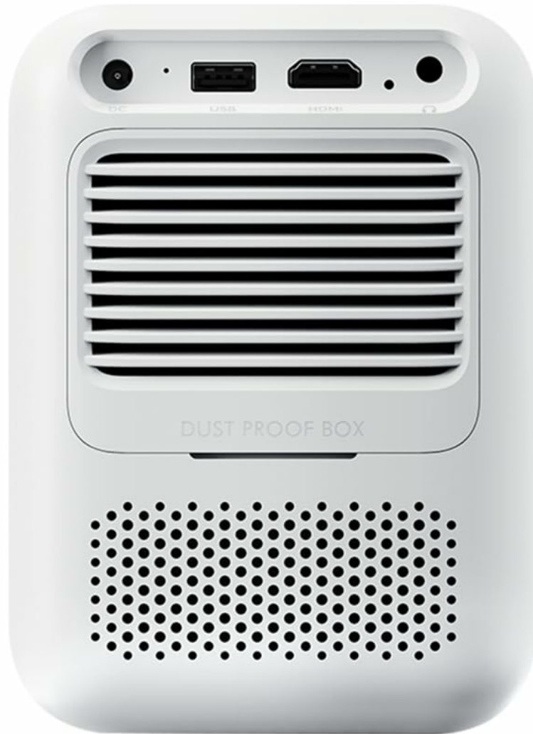
Figure 3.3: Rear view of the projector, showing the HDMI, USB, and audio ports, along with the dust-proof box.