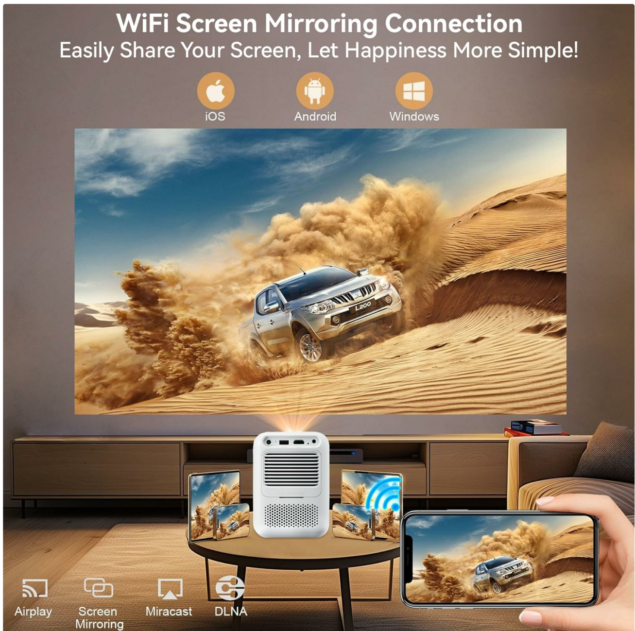
Figure 5.1: Illustration of WiFi Screen Mirroring, showing compatibility with iOS, Android, and Windows devices.

The projector supports wireless screen mirroring from iOS, Android, and Windows devices. Ensure your device and the projector are connected to the same Wi-Fi network. Select the 'Screen Mirroring' option on the projector's home screen and follow the on-screen instructions for your specific device (e.g., Airplay for iOS, Miracast for Android/Windows).