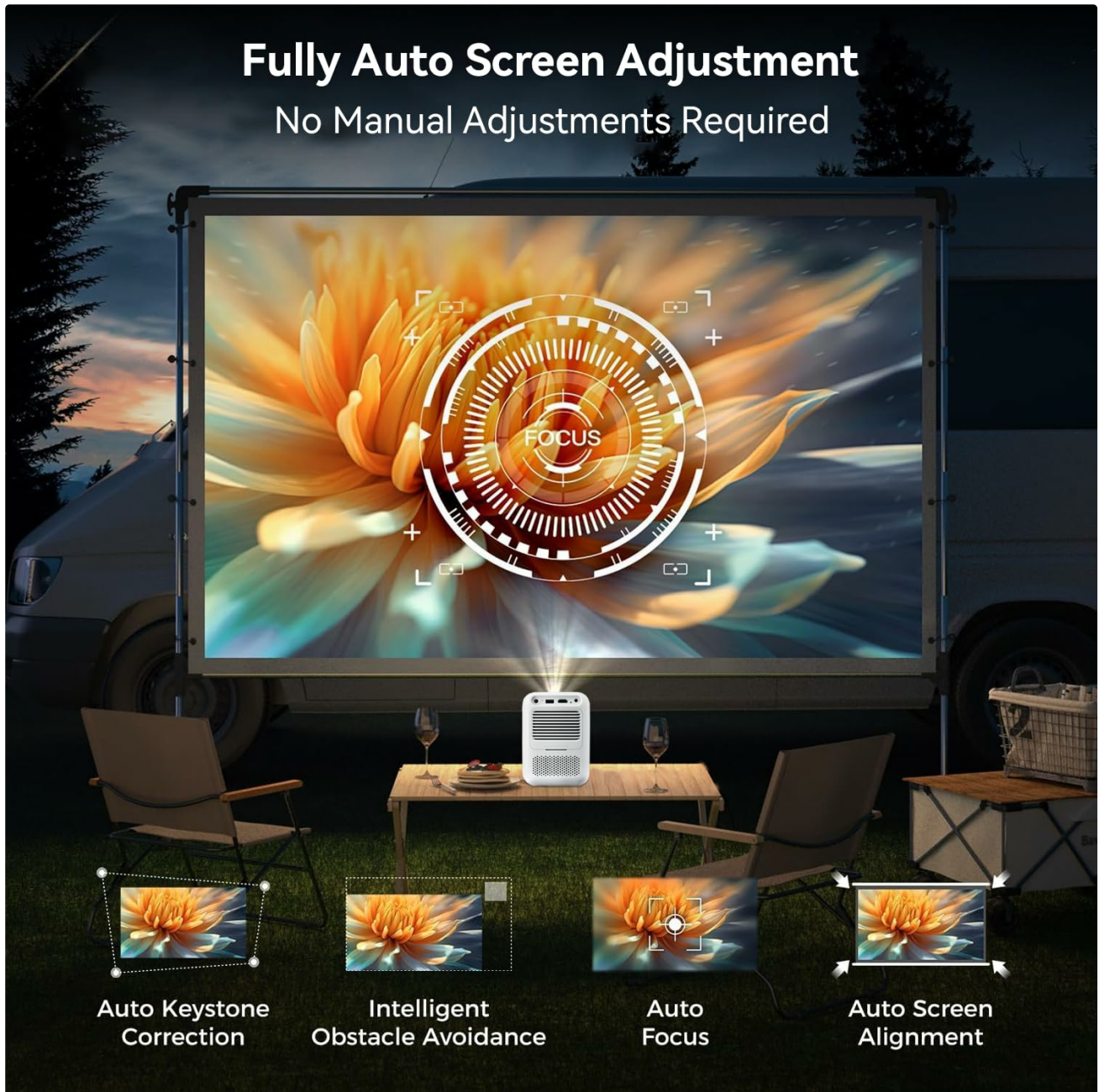
Figure 4.1: The projector's automatic screen adjustment features, including Auto Keystone Correction, Intelligent Obstacle Avoidance, Auto Focus, and Auto Screen Alignment.