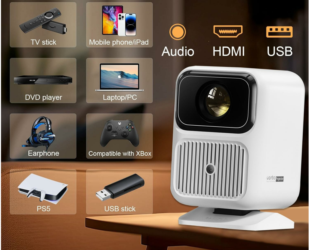
Figure 6.1: Diagram illustrating the wide compatibility with various devices via Audio, HDMI, and USB ports, including TV sticks, mobile phones, DVD players, laptops, earphones, Xbox, PS5, and USB sticks.