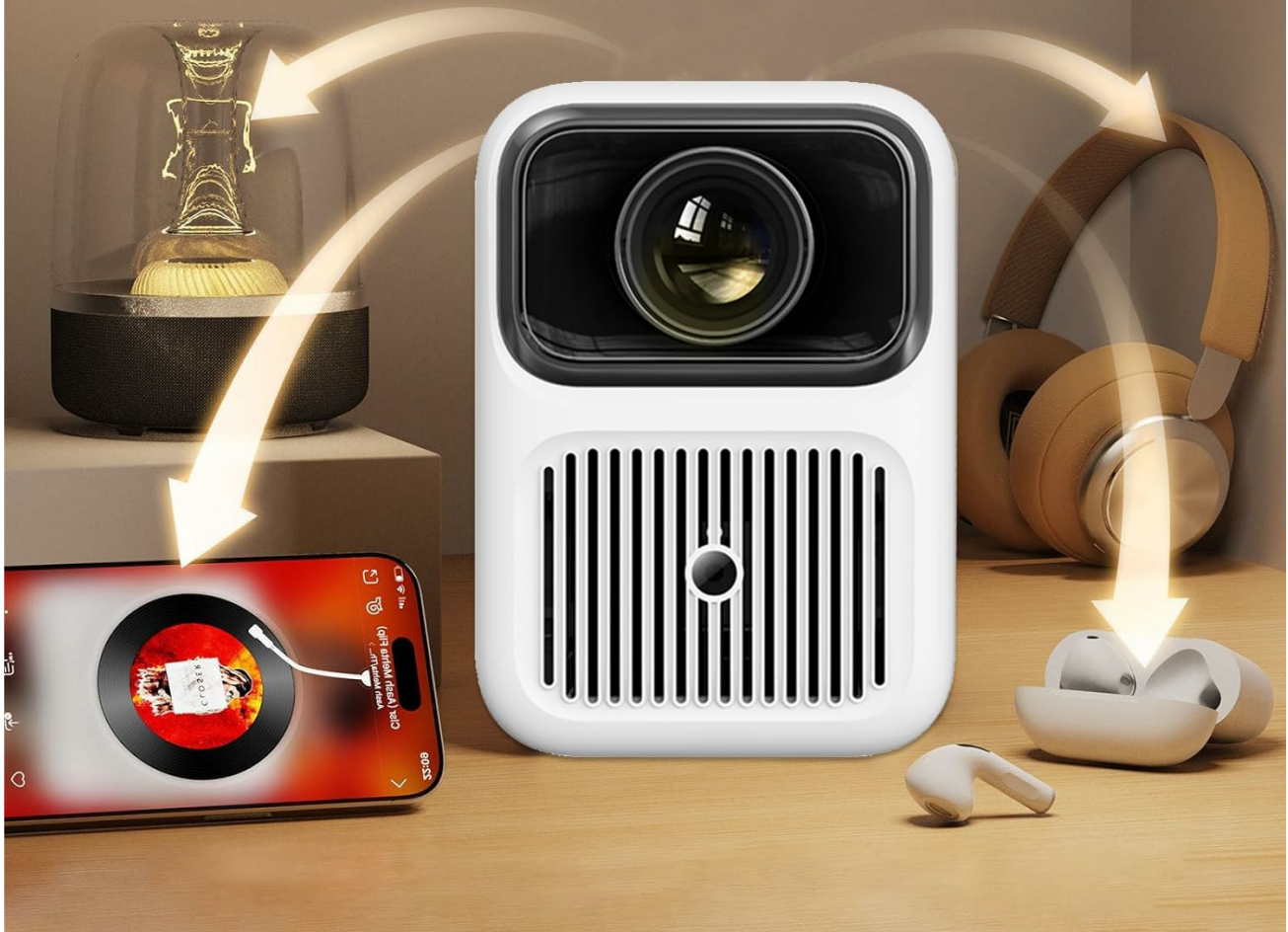
Figure 6.2: Visual representation of Bluetooth 5.0 connectivity, allowing the projector to connect to external Bluetooth audio devices like headphones and speakers.