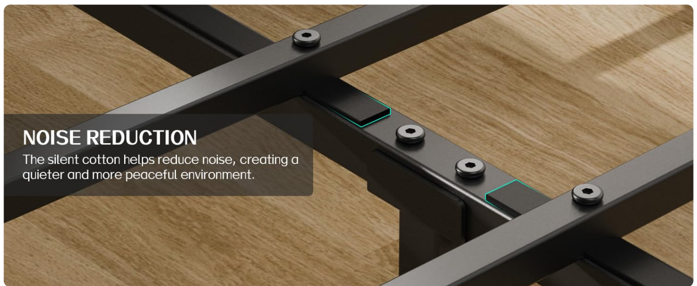
Figure 7: Noise reduction features, such as silent cotton pads, are integrated into the frame for a quieter environment.