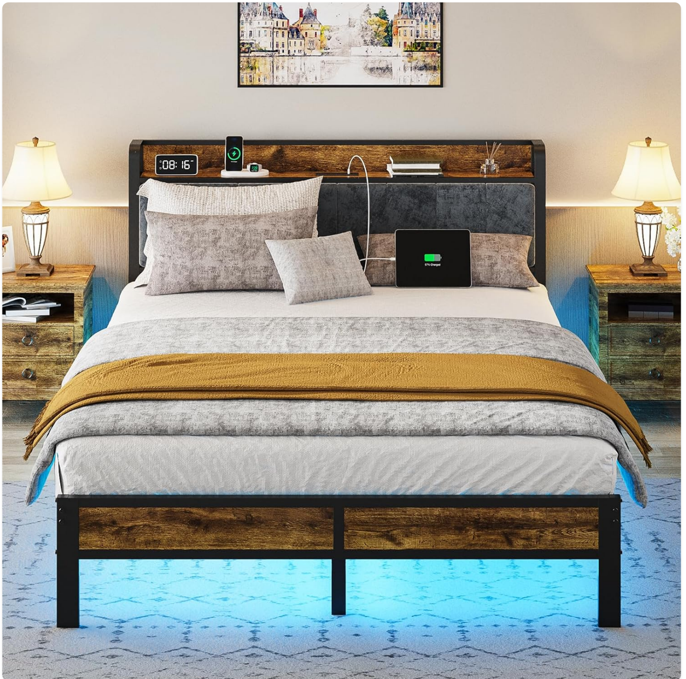
Figure 1: Lians Queen Bed Frame with LED lights and charging headboard.