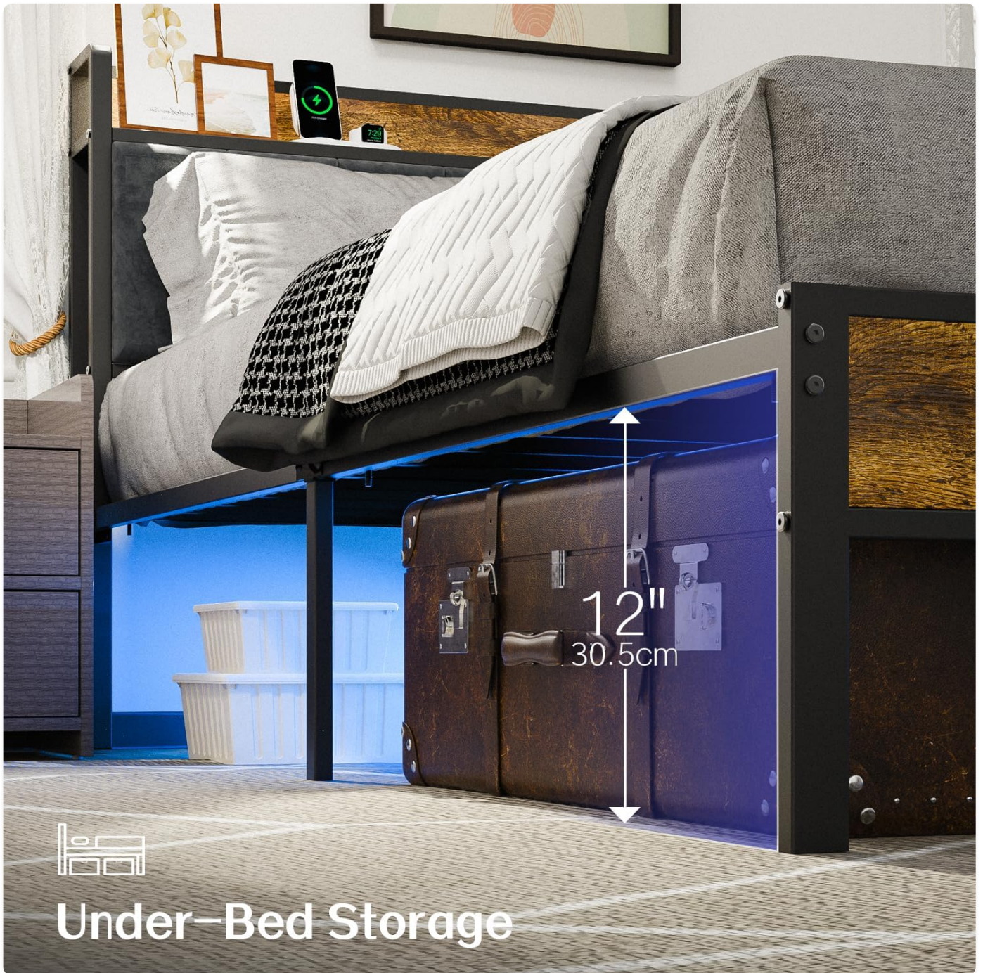
Figure 8: The bed frame provides 12.2 inches of under-bed clearance for convenient storage.