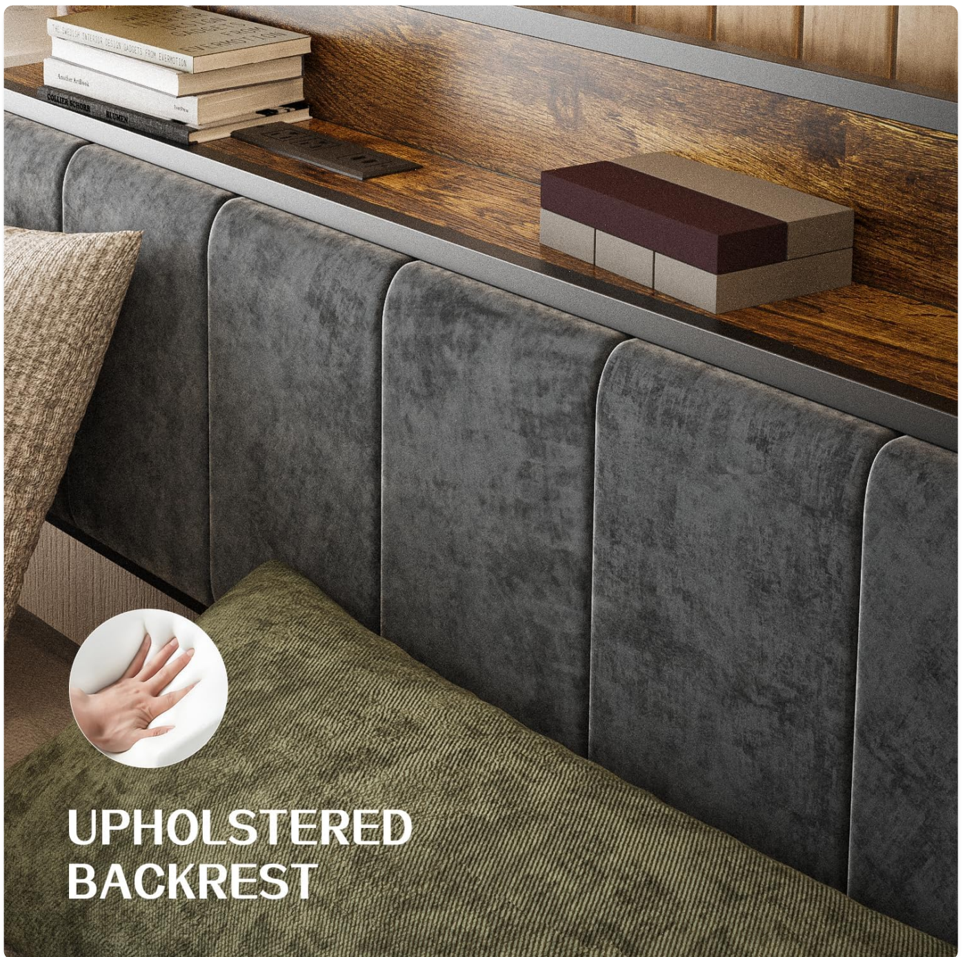
Figure 9: The upholstered backrest provides a comfortable and soft surface.