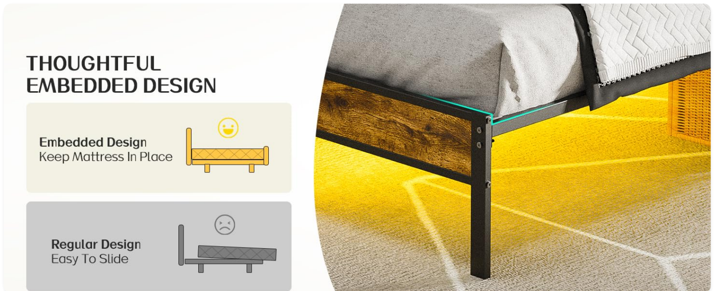
Figure 3: The thoughtful embedded design helps keep your mattress securely in place, preventing sliding.

Your browser does not support the video tag.