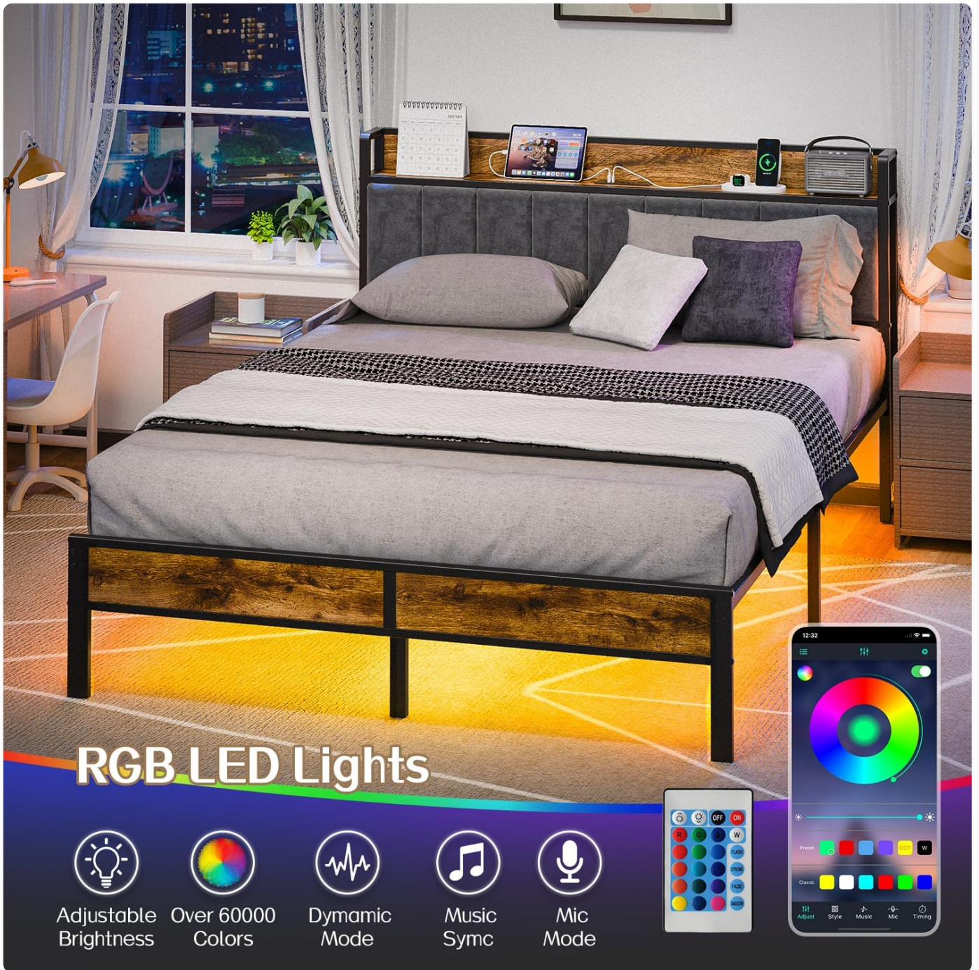
Figure 5: Under-bed LED lights offering various colors and dynamic modes for ambiance.