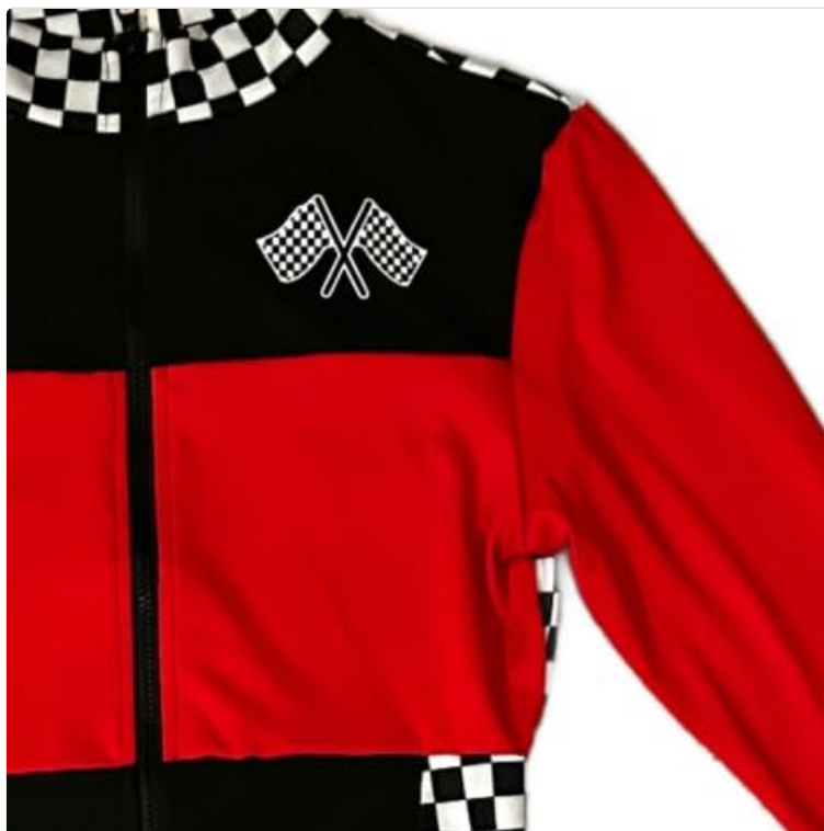
Image: Detail of the Racer Girl Romper's collar and flag emblem. This close-up shows the checkered collar and the crossed flag emblem on the chest area of the costume.