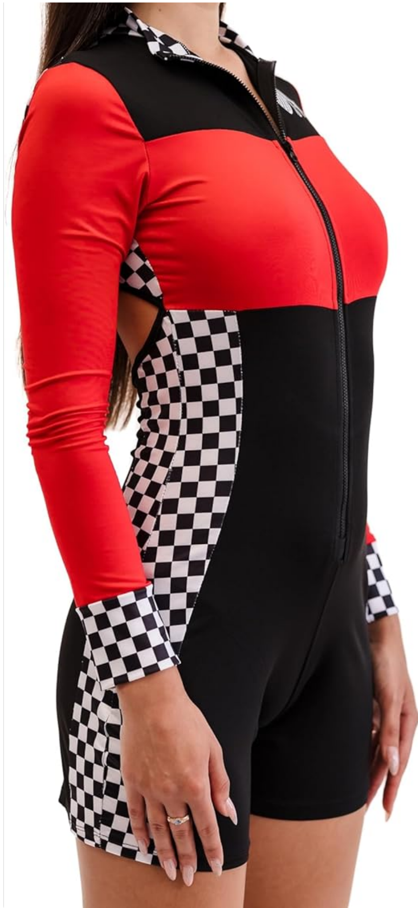
Image: Front view of the Racer Girl Romper. This image shows the full front of the costume, highlighting the red, black, and checkered pattern, along with the high neck and front zipper.