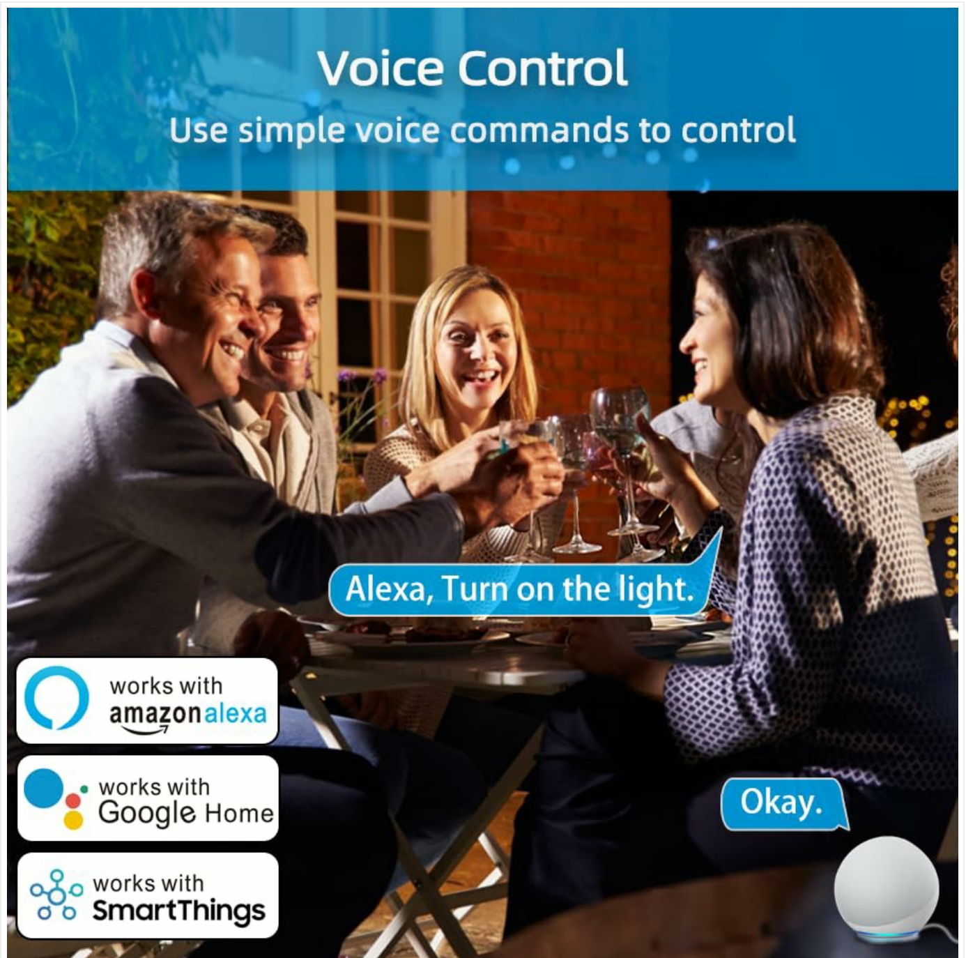
Image: An illustration of voice control in action, with people at a dinner table and a voice command "Alexa, Turn on the light." being processed, indicating compatibility with Amazon Alexa, Google Home, and SmartThings.