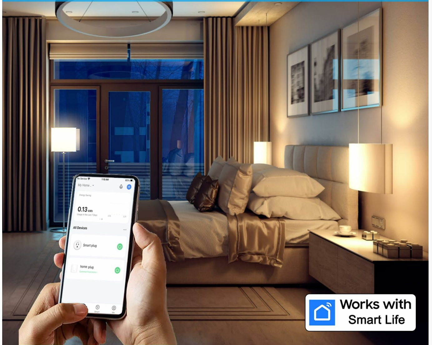
Image: A user demonstrating remote control of a smart plug via the Smart Life app on a smartphone, showing a bedroom light being controlled.