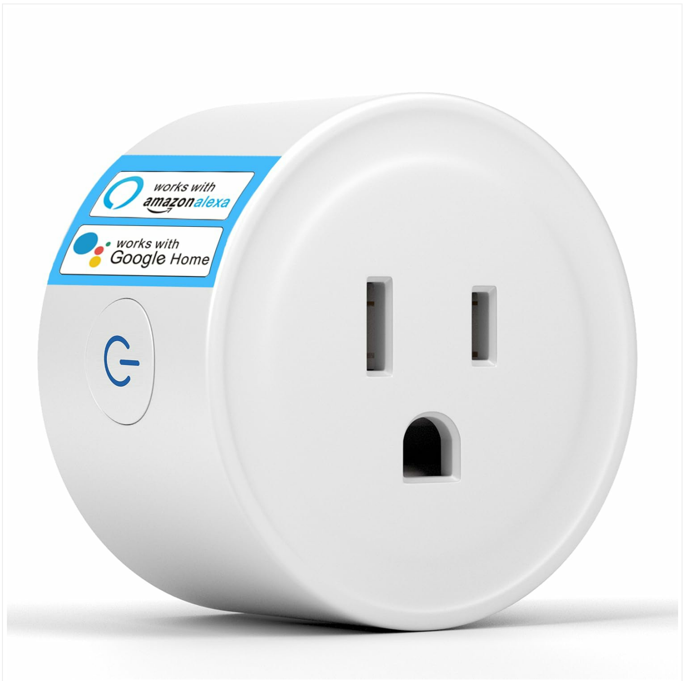
Image: The YNF Smart Plug, a compact white device designed for smart home integration.