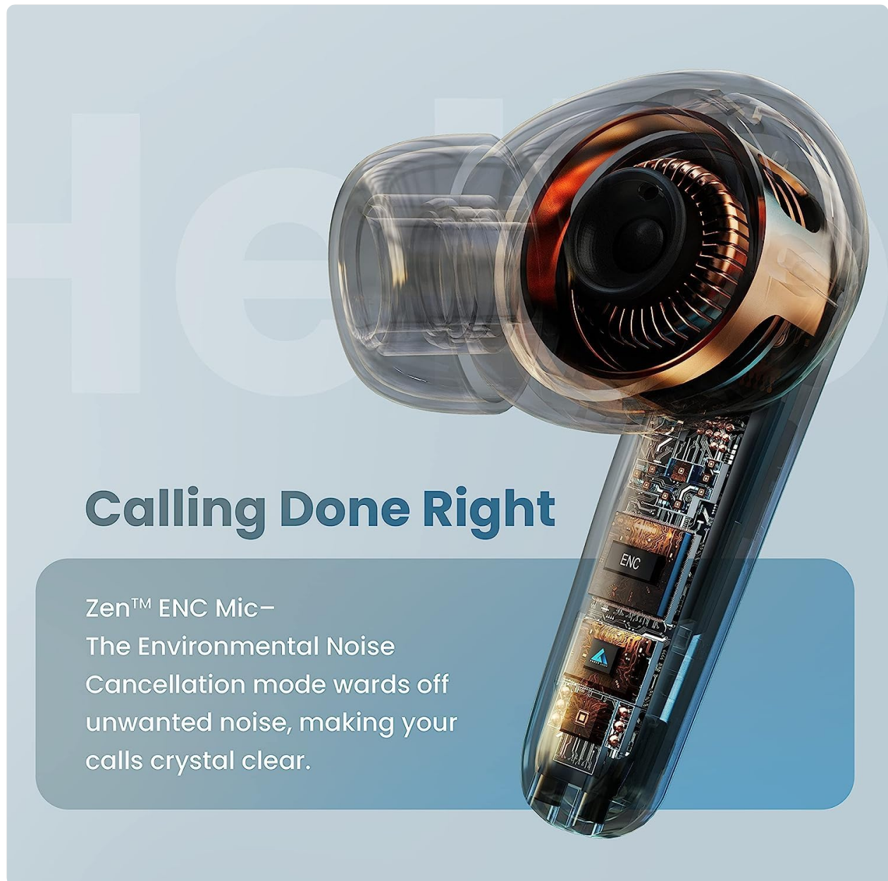
Image: An X-ray style view of the Boult Audio Z40 earbud, highlighting the internal components and the Zen™ ENC Mic, emphasizing its role in clear call quality by cancelling unwanted noise.