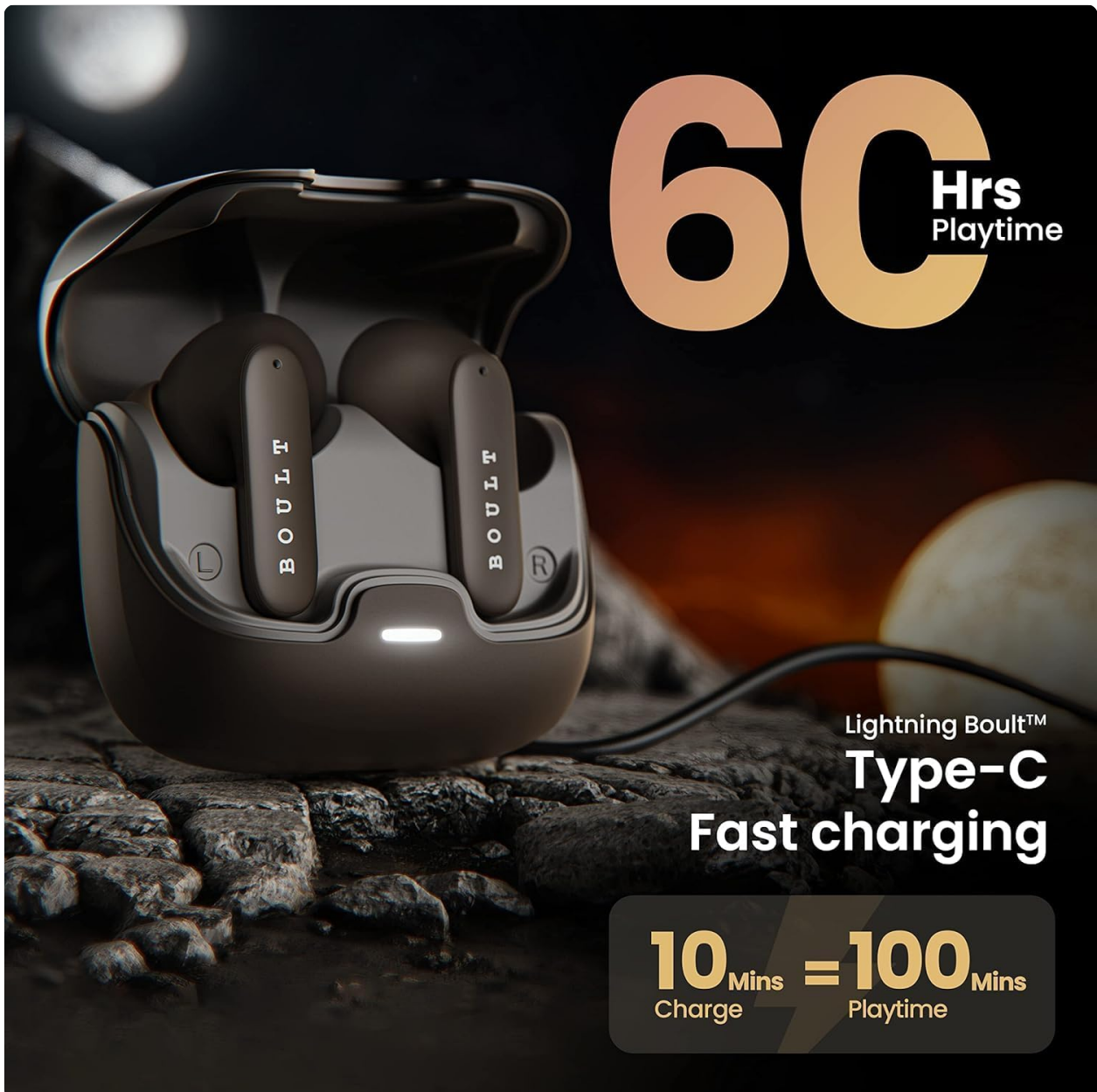
Image: The Boulton Audio Z40 charging case with earbuds inside, connected to a Type-C charging cable, illustrating the 60 hours of playtime and fast charging capability (10 mins charge = 100 mins playtime).