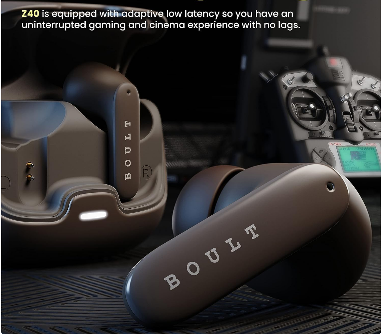
Image: The Boult Audio Z40 earbuds and charging case in a gaming-themed setting, with text prominently displaying "Combat™ gaming" and "Low latency," indicating their suitability for gaming without lags.

Z40 is equipped with adaptive low latency so you have an uninterrupted gaming and cinema experience with no lags.