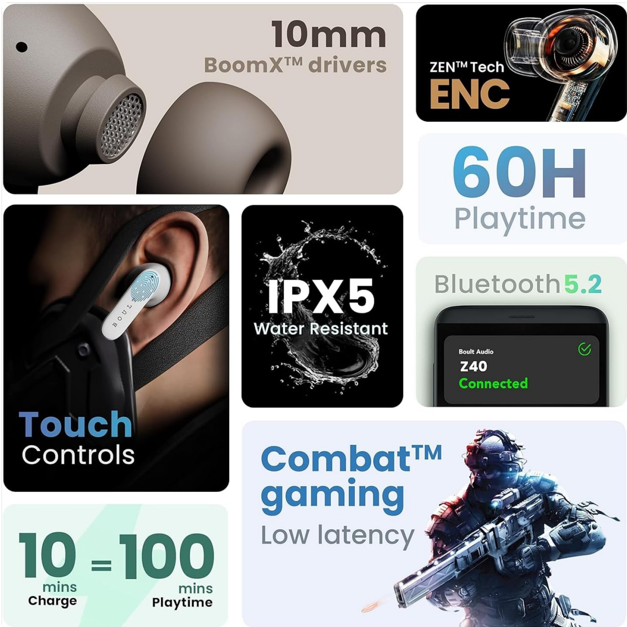
Image: A collage showcasing key features of the Boult Audio Z40, including 10mm BoomX drivers, Zen™ ENC, 60H playtime, IPX5 water resistance, Bluetooth 5.2, touch controls, and fast charging capabilities.

Your browser does not support the video tag.