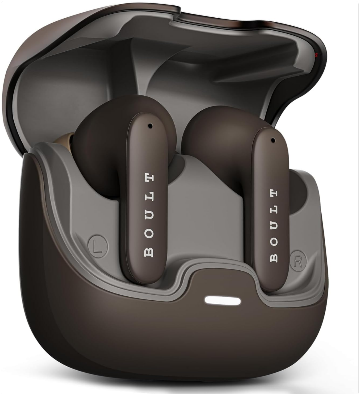
Image: Boult Audio Z40 True Wireless Earbuds in their brown charging case, with the lid open, showing both earbuds nestled inside. The case has a sleek, modern design.