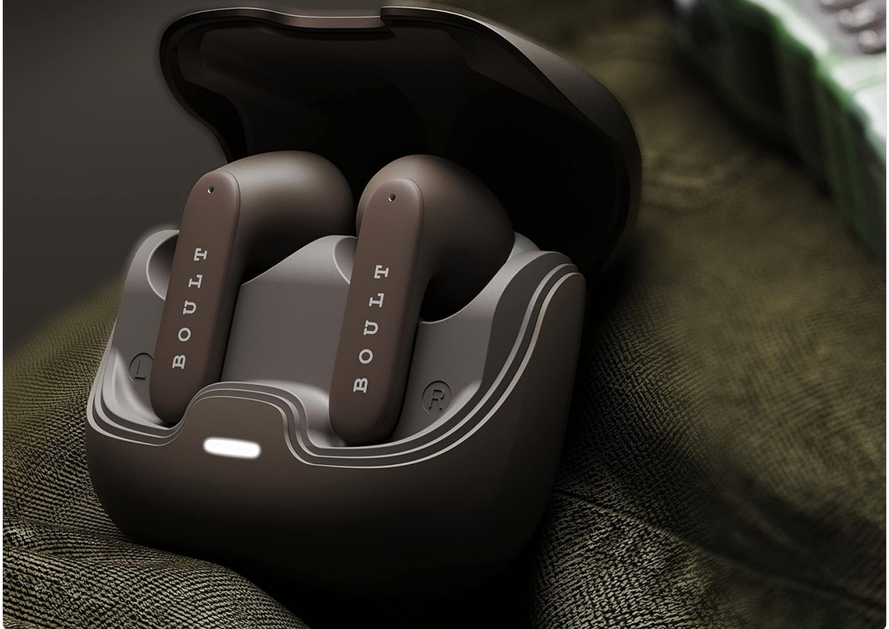
Image: A smartphone screen showing "Boult Audio Z40 Connected" via Bluetooth 5.2, with the earbuds in their open charging case in the foreground, demonstrating the Blink & Pair™ feature.