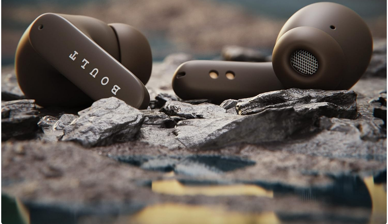
Image: The Boult Audio Z40 earbuds resting on a damp, rocky surface, with text prominently displaying "IPX5 water resistant," illustrating their durability against splashes.