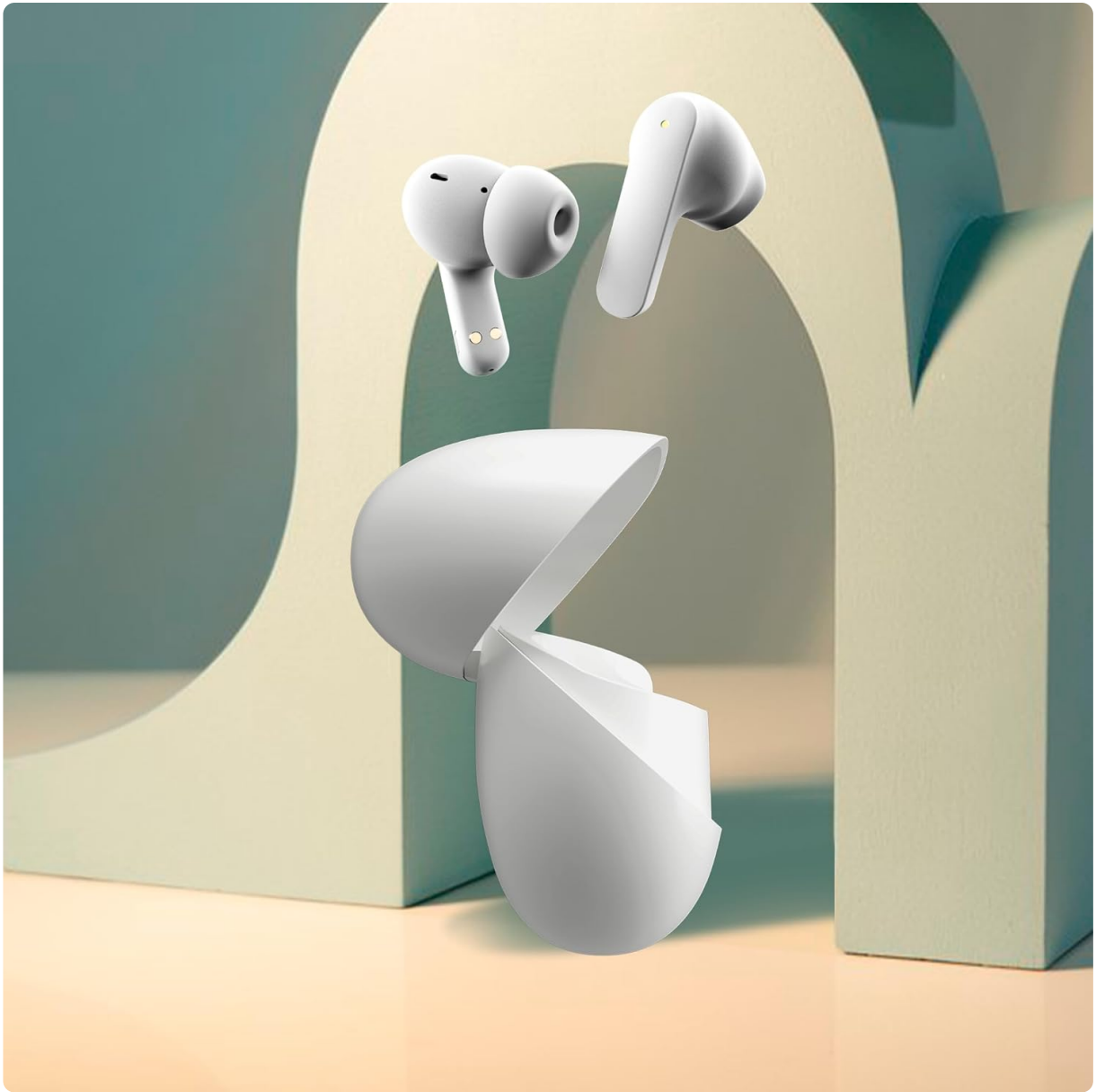
Image: The Vieta Pro Double True Wireless Earbuds and their charging case, presented against a light blue and beige background. The earbuds are shown outside the open case, highlighting their sleek design.