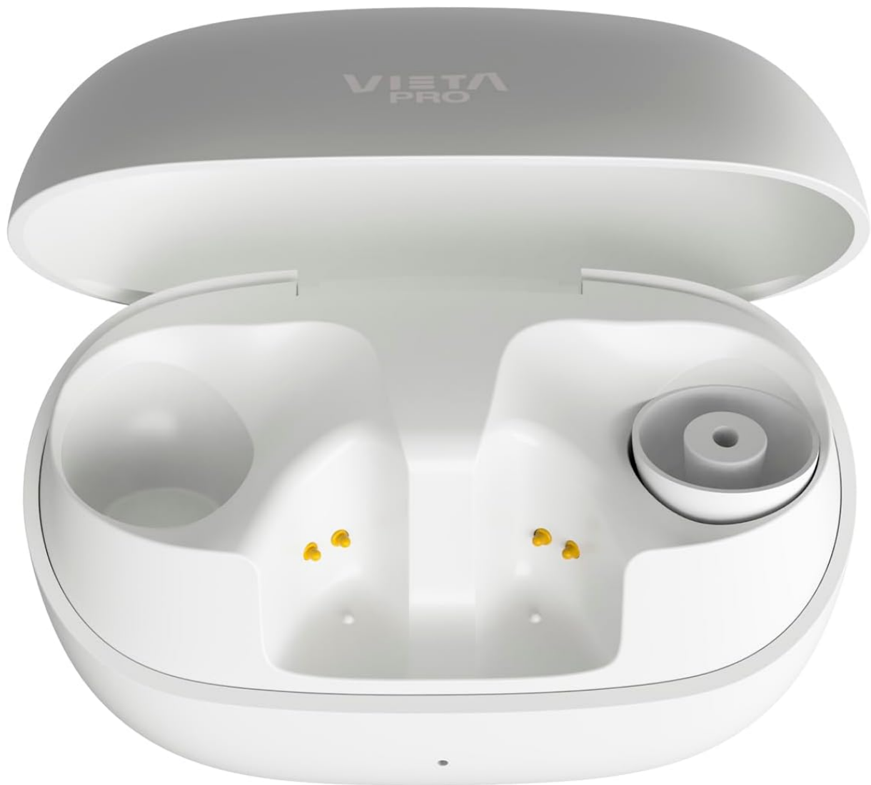
Image: An overhead view of the open Vieta Pro Double charging case, showing the two compartments for the earbuds and the gold-colored charging pins at the bottom of each slot.