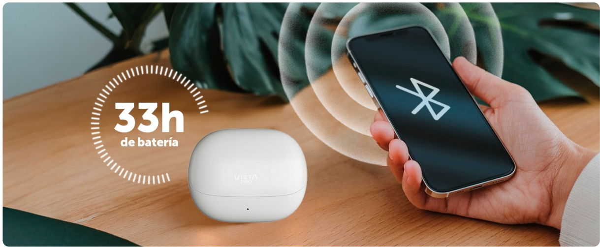
Image: A graphic highlighting the 33-hour battery life of the Vieta Pro Double earbuds, with the charging case and a smartphone displaying the Bluetooth symbol.