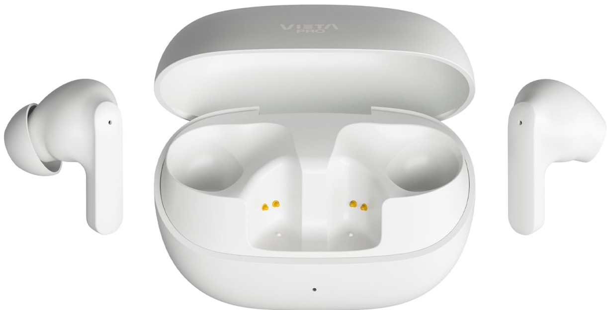
Image: The Vieta Pro Double True Wireless Earbuds, white in color, shown with their charging case open. The two earbuds are placed on either side of the open case, highlighting their design and the charging contacts within the case.

This manual provides comprehensive instructions for the safe and efficient use of your Vieta Pro Double True Wireless Earbuds. Please read this manual thoroughly before using the product and retain it for future reference.