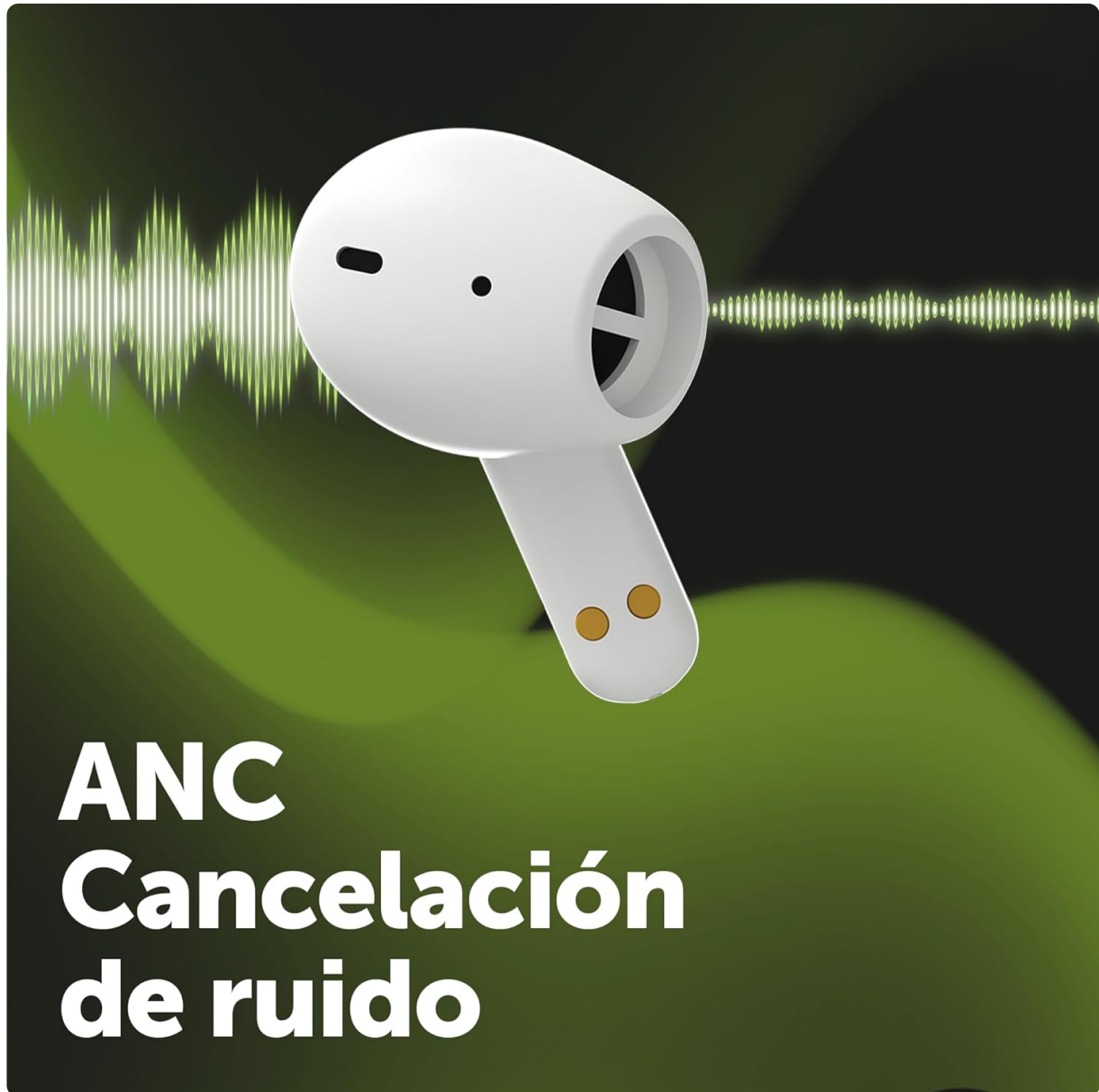
Image: A close-up of a white Vieta Pro Double earbud with a graphic representation of sound waves, illustrating the Active Noise Cancellation (ANC) feature.