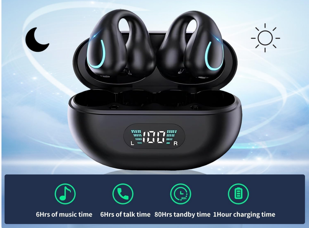
Image 3.2: Charging Case with Digital Display indicating battery levels for the case and individual earbuds.

Can charge the bluetooth earbuds for 5-6 times