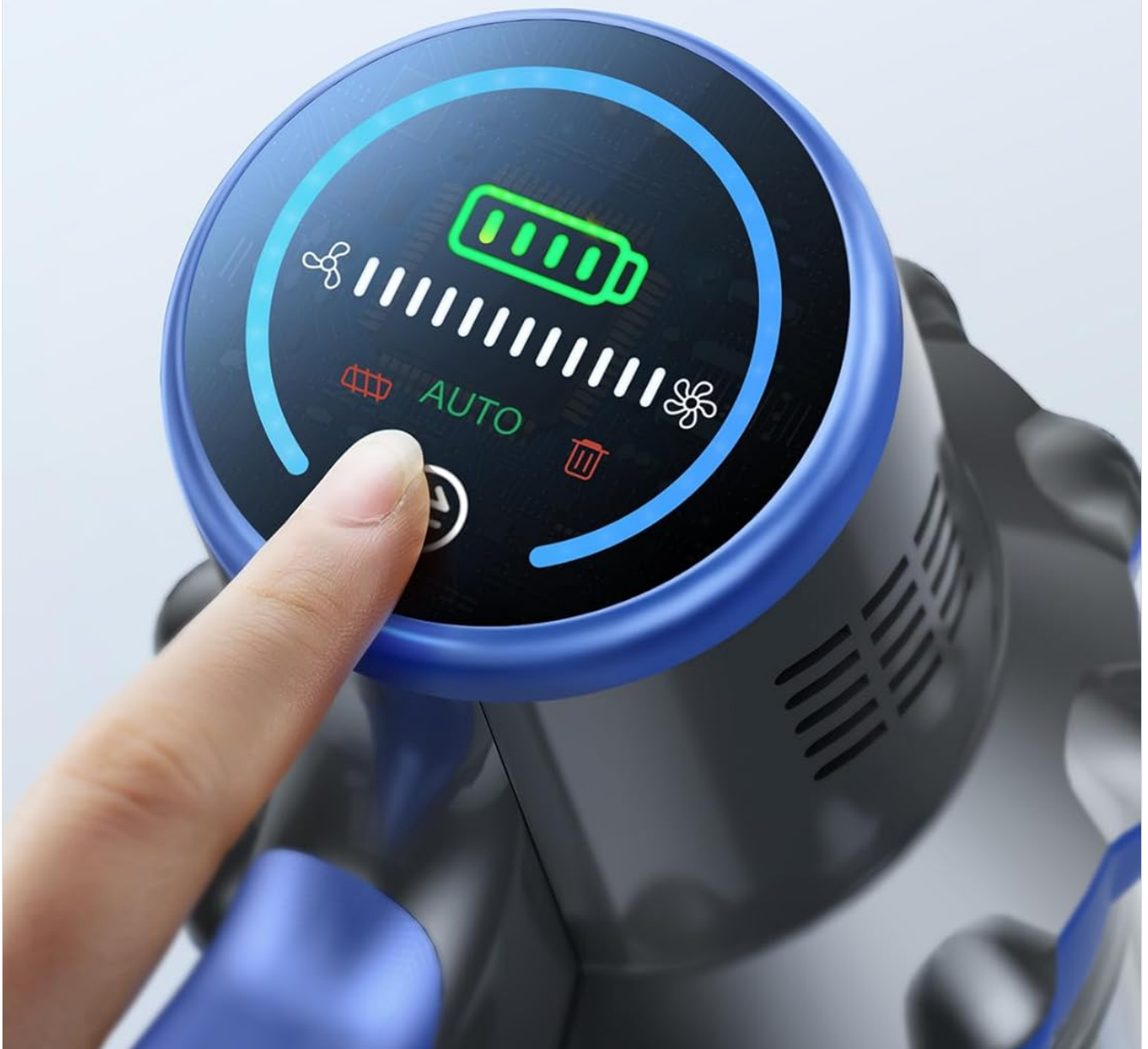
Figure 4: The intelligent color touch screen provides real-time information and mode selection.

Your browser does not support the video tag.