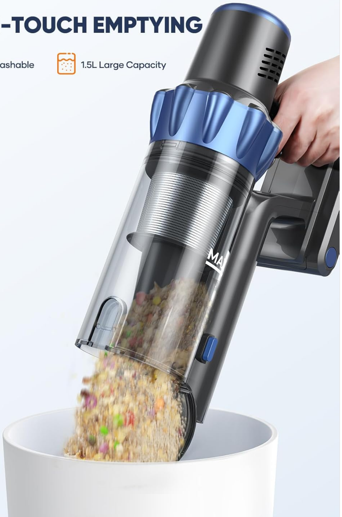
Figure 6: One-touch emptying of the dust cup for quick and easy disposal.