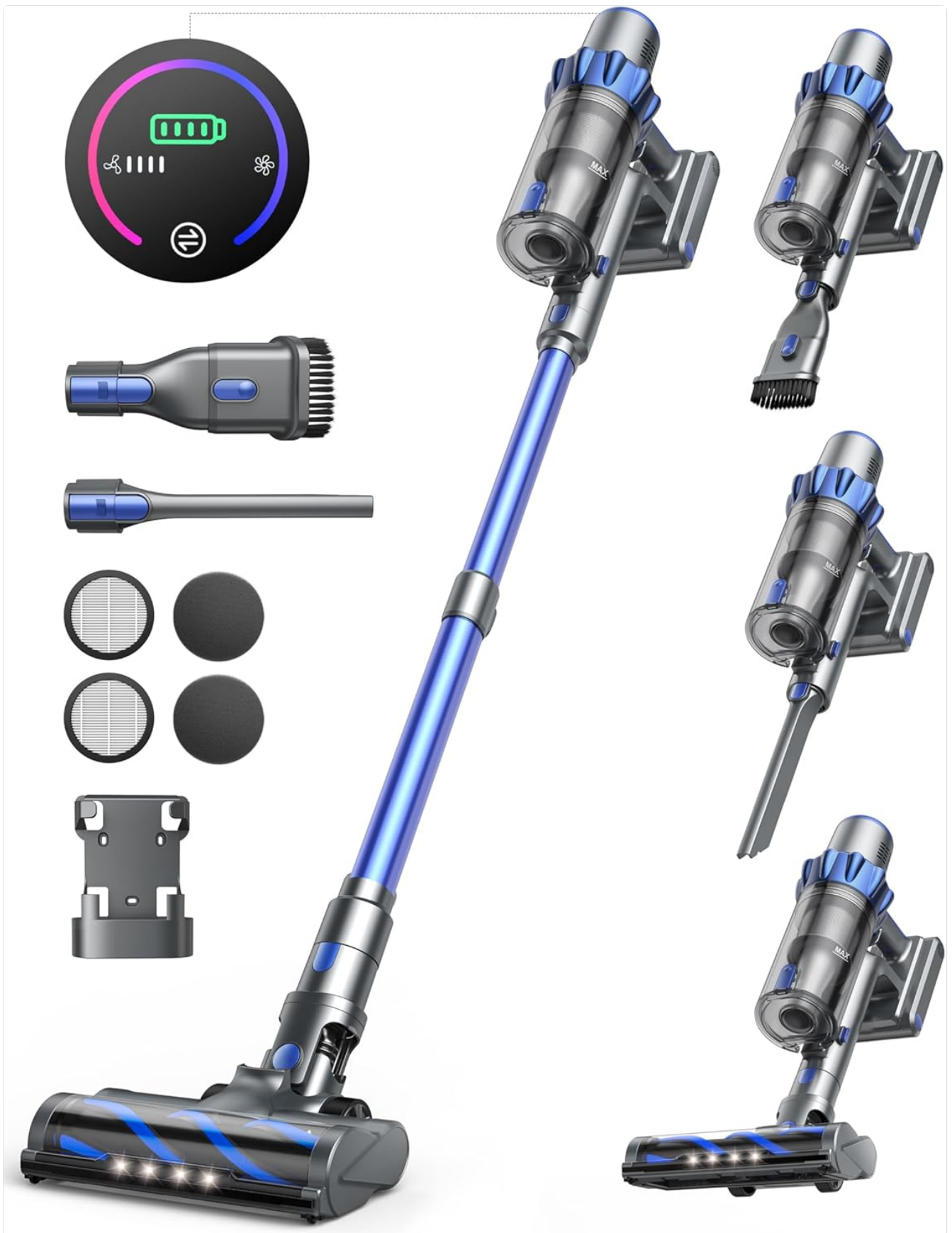
Figure 1: Overview of the INTETURE BP10 Cordless Vacuum Cleaner and included accessories.