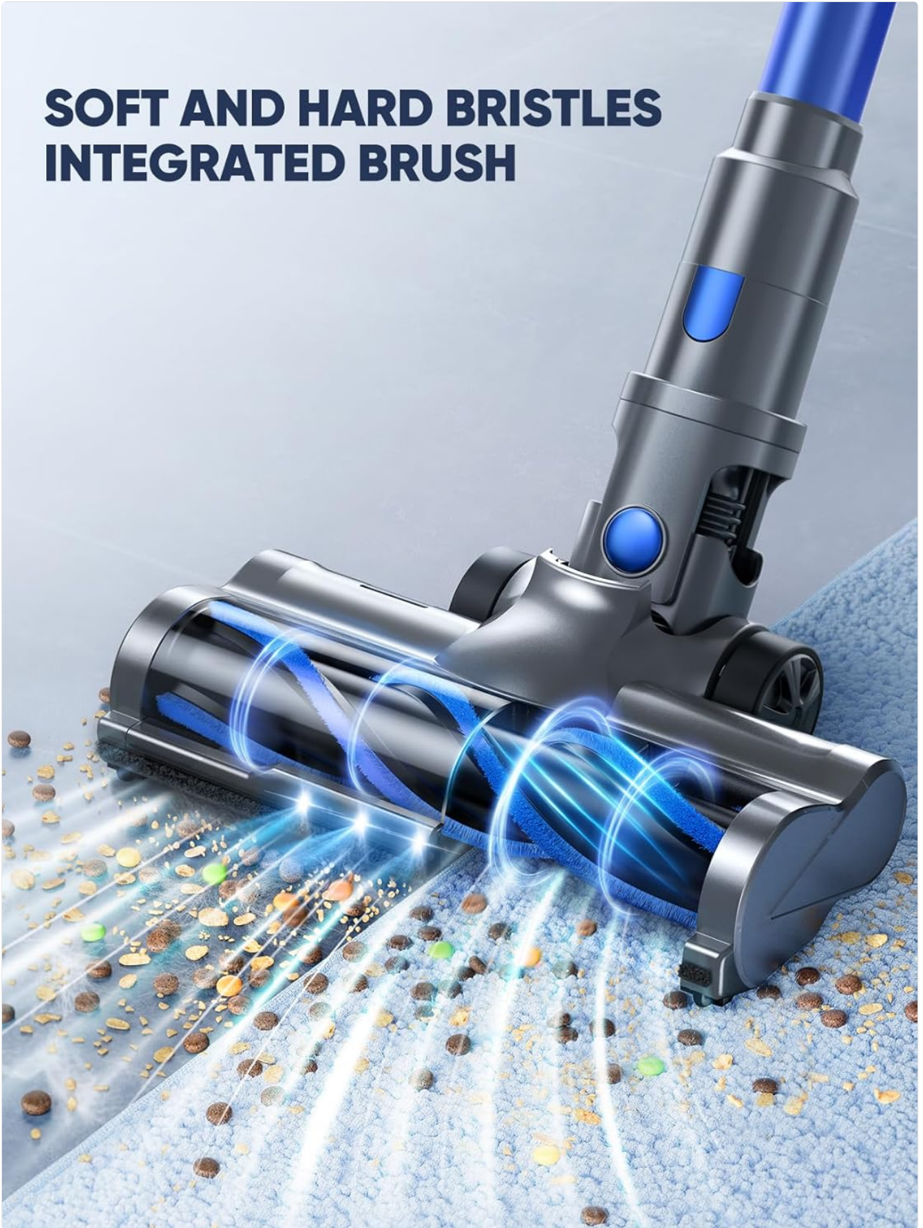
Figure 7: The integrated brush design simplifies cleaning across different surfaces.