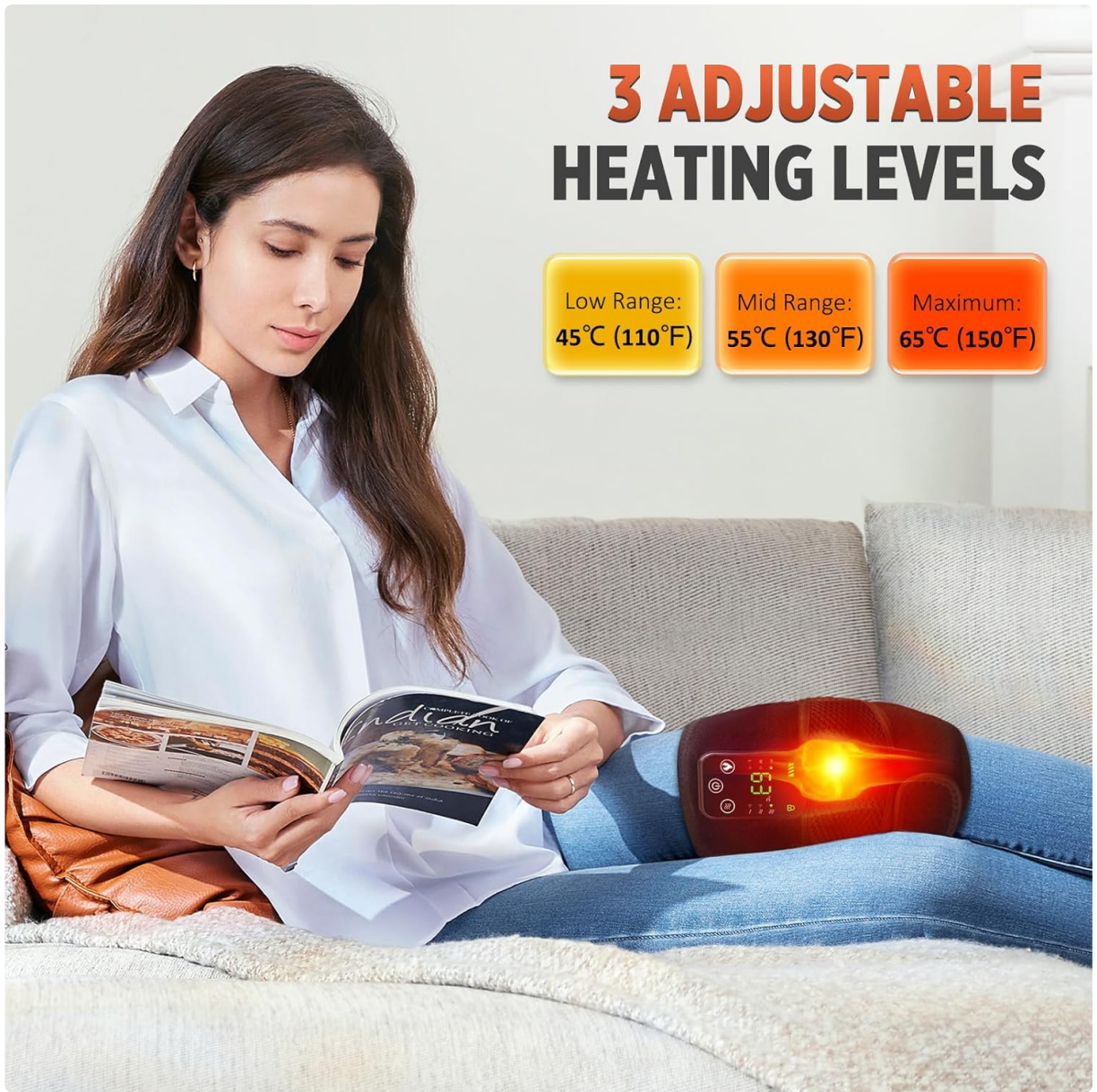
Image: Illustration of three adjustable heating levels: Low (45°C/110°F), Mid (55°C/130°F), and Maximum (65°C/150°F).