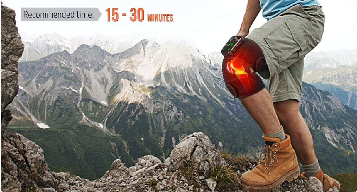
Image: Diagram showing the cordless nature of the knee wrap, with charging time (2-3 hours), availability time (1-3.5 hours), and recommended usage time (15-30 minutes).