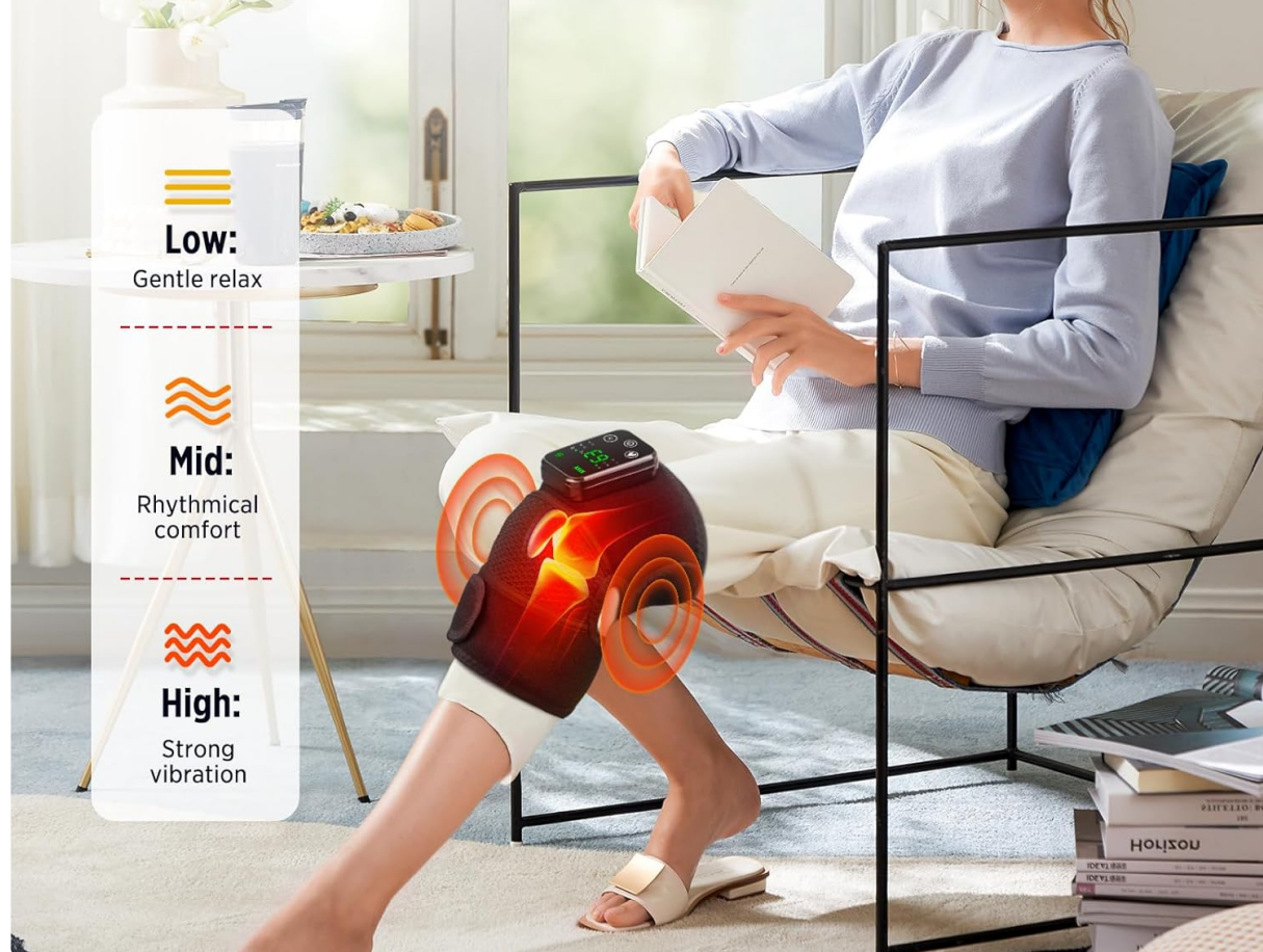
Image: Illustration of three adjustable vibrating massage modes: Low (Gentle relax), Mid (Rhythmical comfort), and High (Strong vibration).