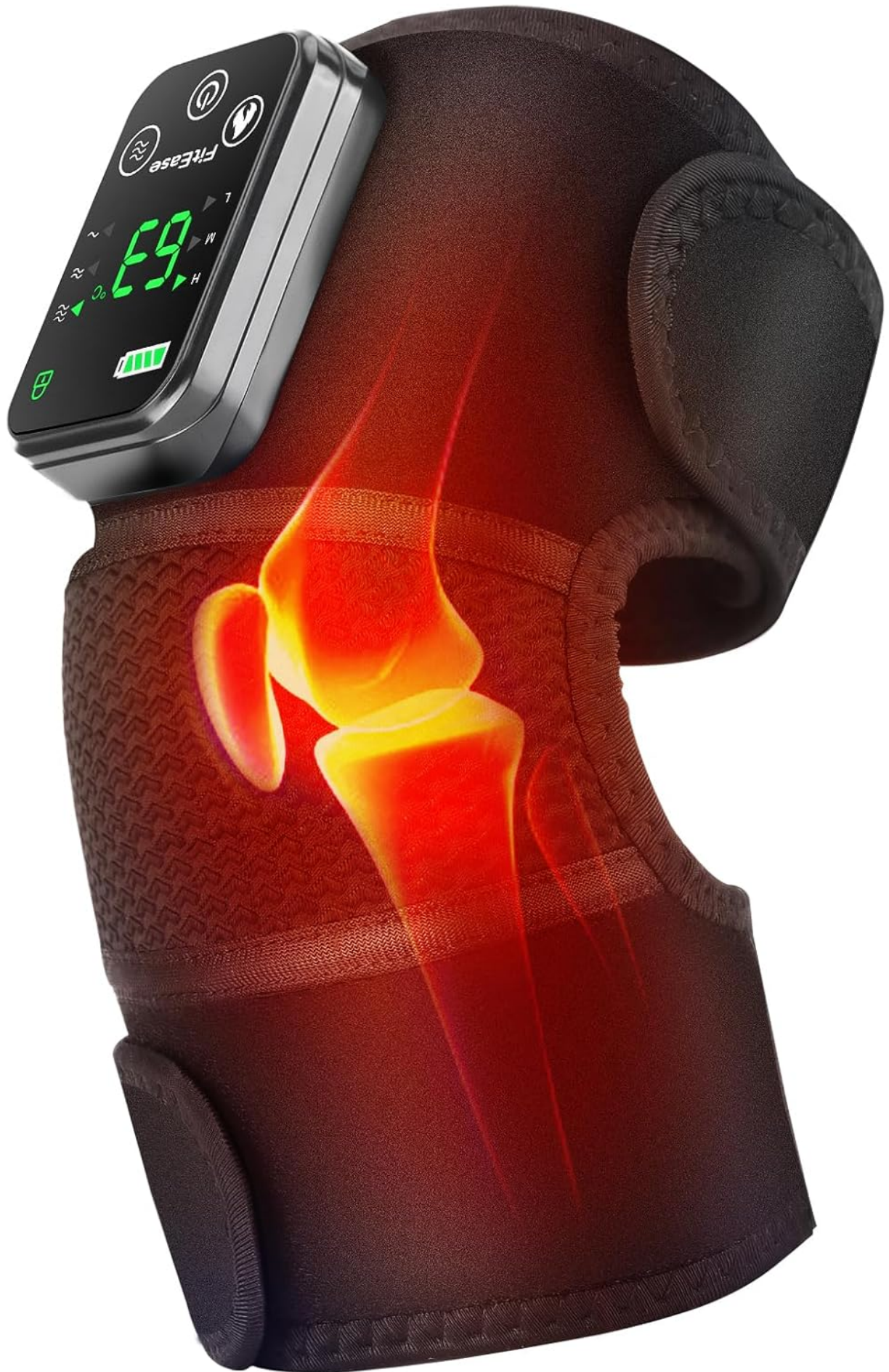
Image: ERHIVORA Cordless Knee Massager, showcasing its design and integrated control panel.