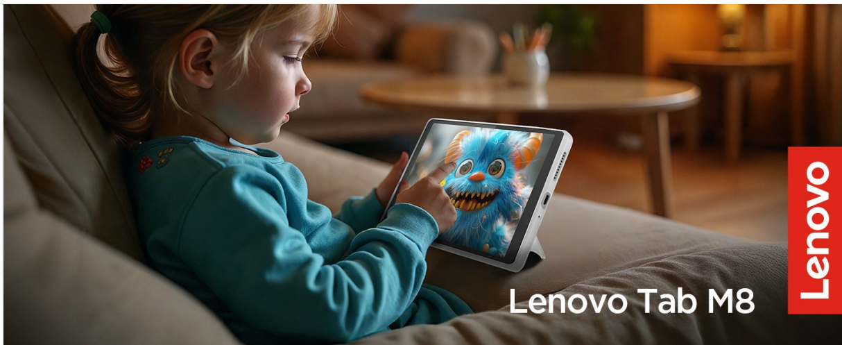
Image: A child comfortably using the Lenovo Tab M8 Gen 4 tablet, showcasing its family-friendly design.

This manual provides essential information for setting up, operating, and maintaining your Lenovo Tab M8 Gen 4 tablet. Designed for family use, this 8-inch HD tablet offers entertainment and learning experiences, featuring Google Kids Space and TÜV Eye Care certified display for reduced blue light exposure.