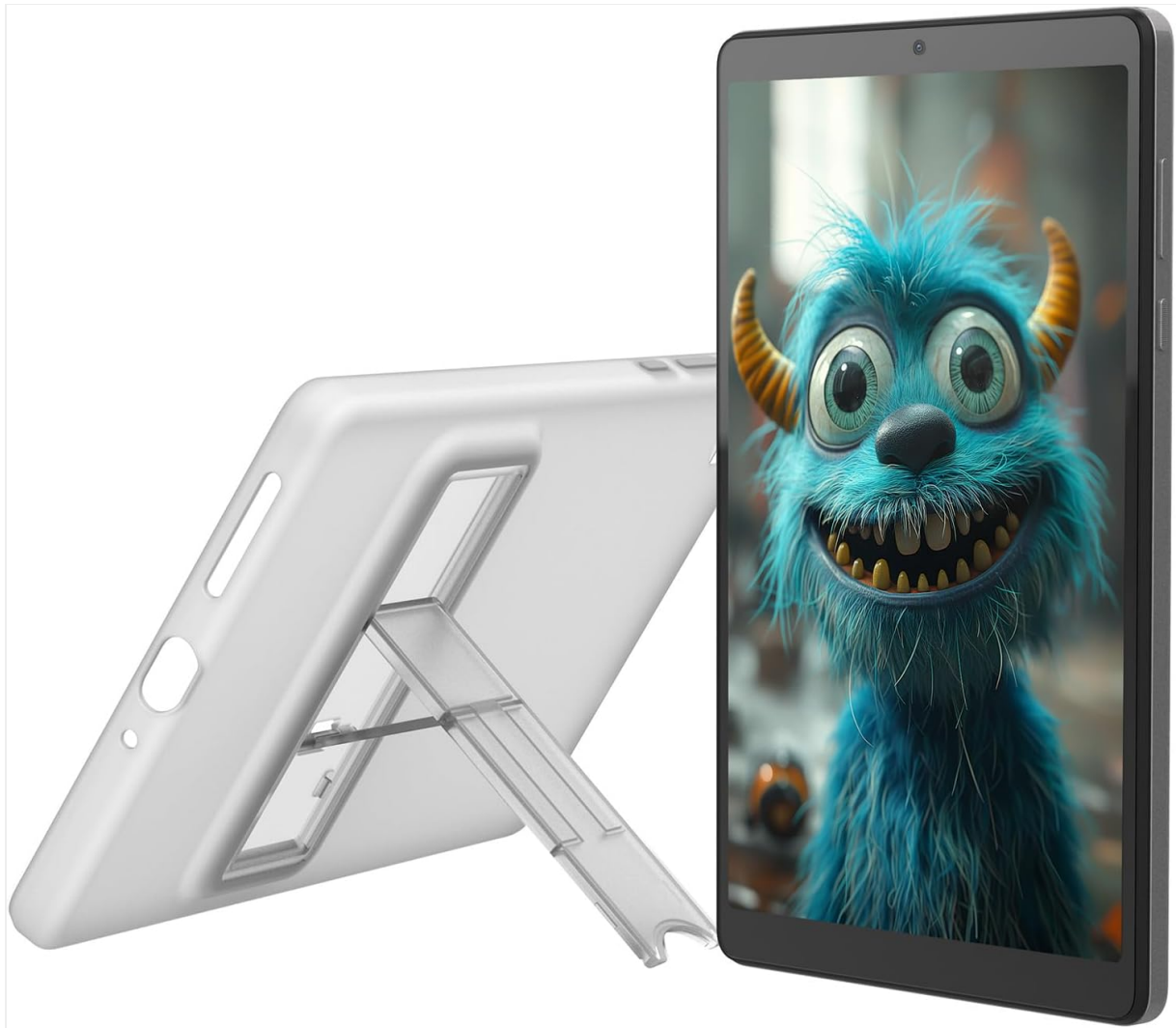
Image: The Lenovo Tab M8 Gen 4 tablet shown with its included clear folio case and integrated stand.