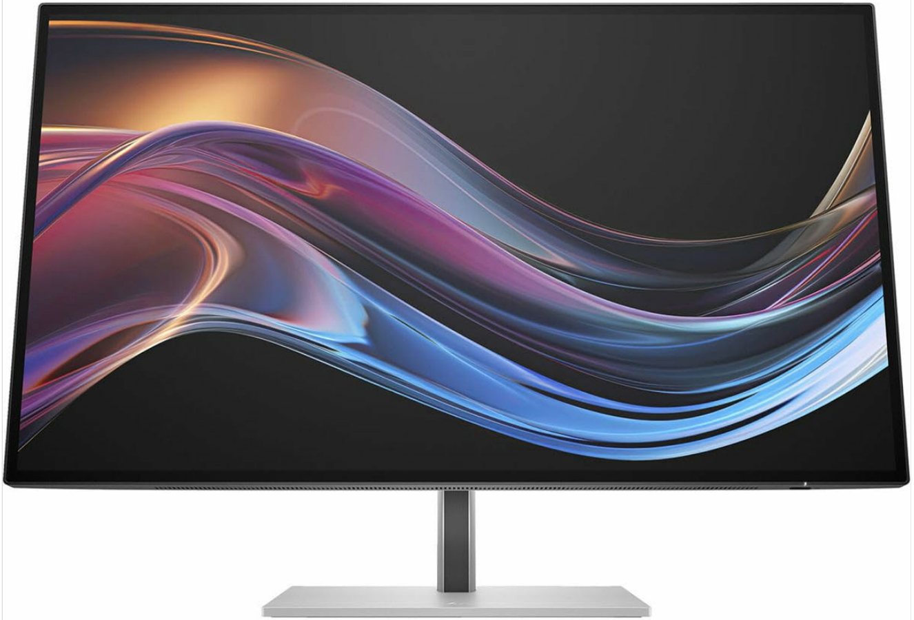
Front view of the HP 727pk 27-inch 4K UHD Monitor, showcasing its slim bezels and stand.