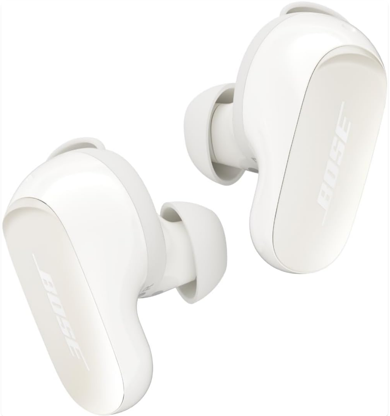
Front view of the Bose QuietComfort Ultra Earbuds, showcasing their sleek design and the Bose logo.