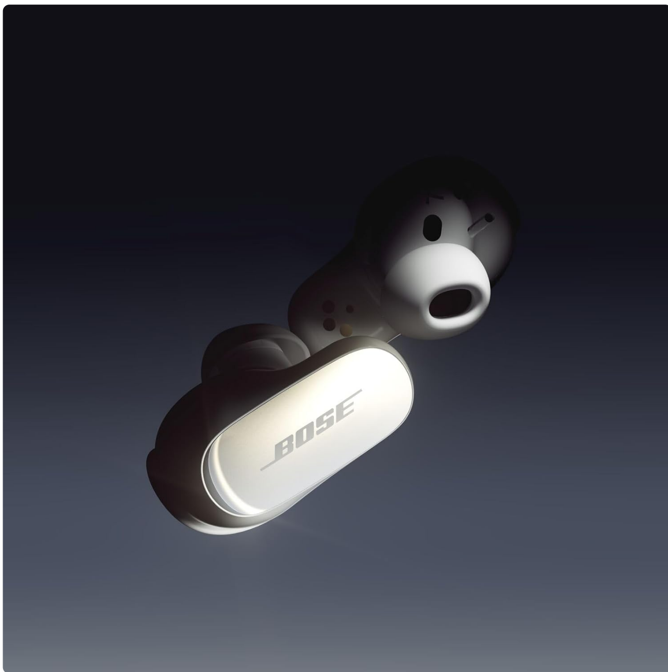
Close-up view of the earbuds highlighting the soft eartips and stability bands designed for a comfortable and secure fit.

Achieving the best sound and noise cancellation requires a proper fit. The Bose Fit Kit includes three pairs of ear tips (small, medium, large) and three pairs of stability bands (1, 2, 3). Experiment with different combinations to find the most comfortable and secure fit that creates a gentle seal in your ear canal. XS and XL eartips and stability bands are sold separately.