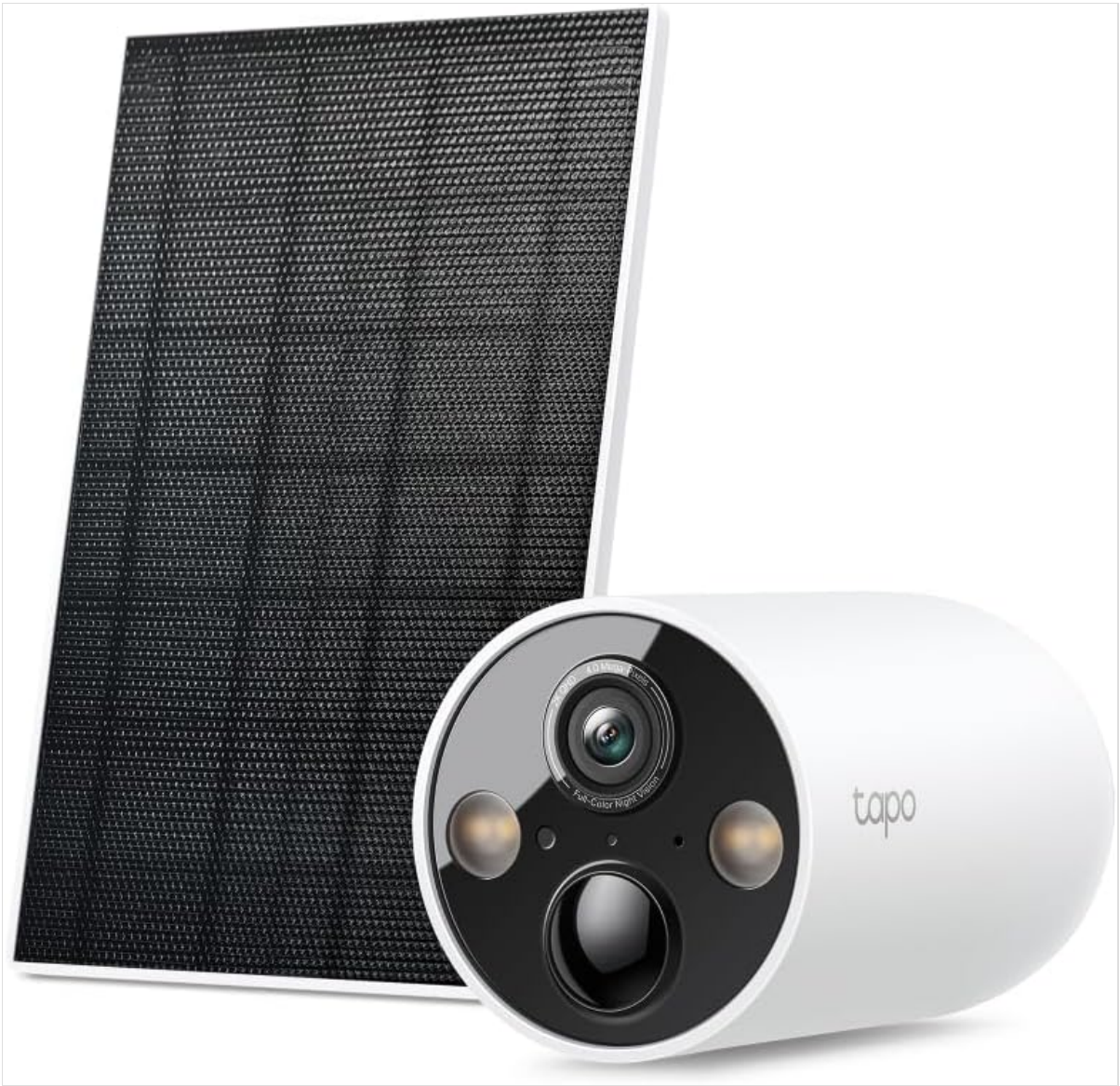
Image of the Tapo C425 camera and the Tapo A201 solar panel, showcasing the complete kit.