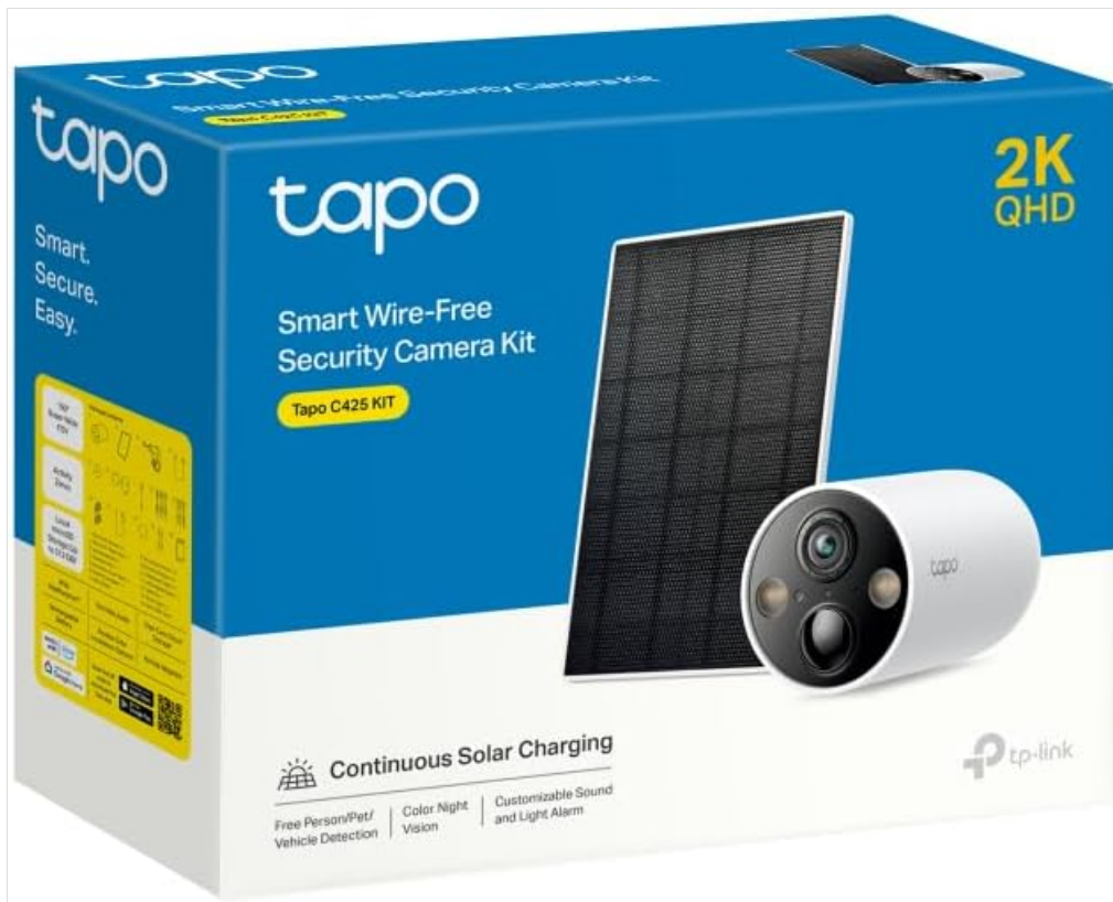
The retail packaging for the Tapo Smart Wire-Free Security Camera Kit (Tapo C425 KIT), showing the camera and solar panel on the box.