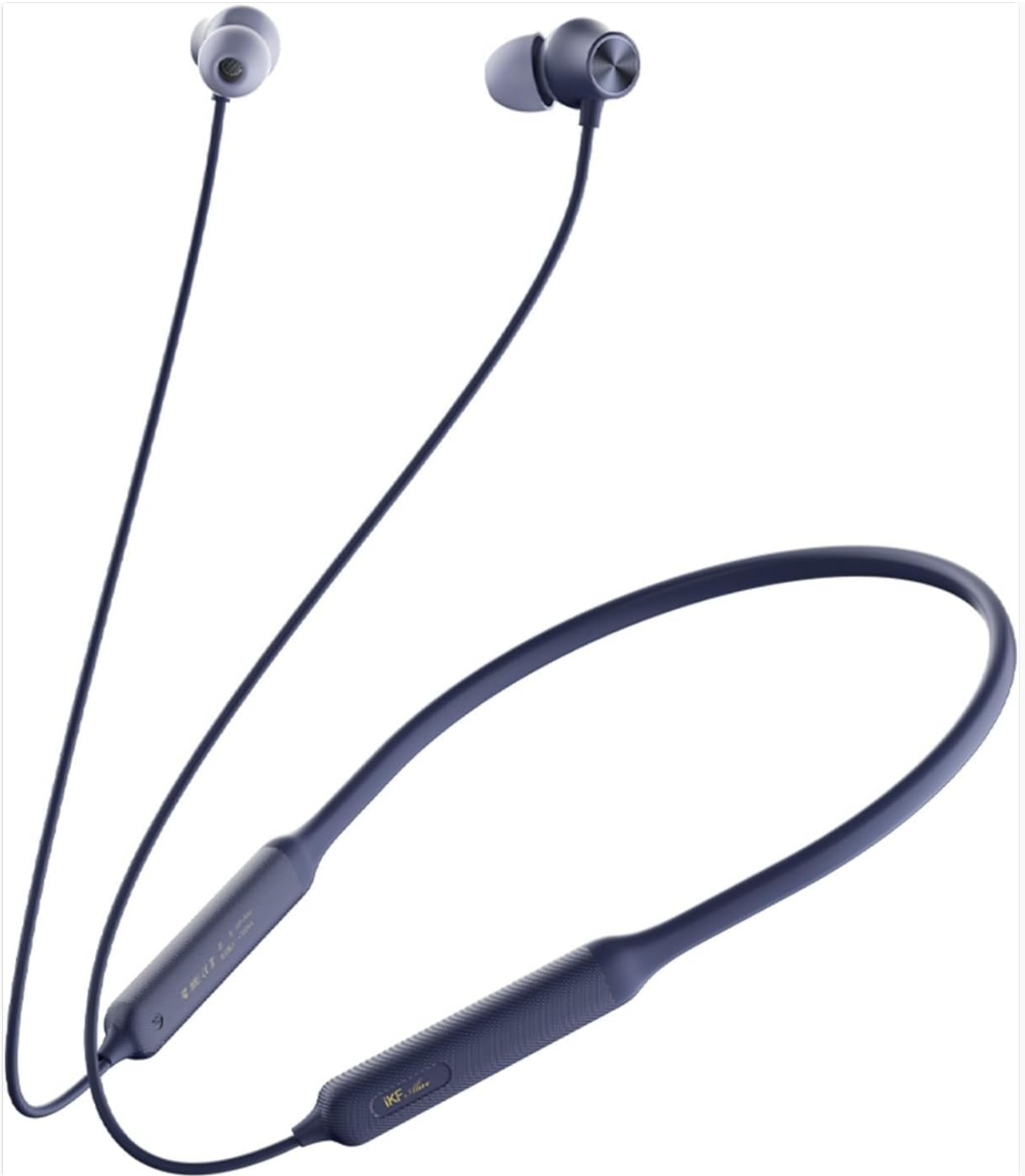
Figure 1: iKF Alive Wireless Noise-Cancelling Neckband Earphones.