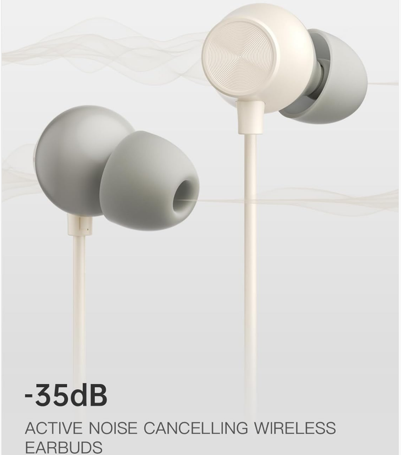
Figure 5: Active Noise Cancellation in action.