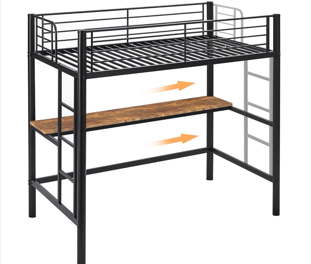
Image: Safety features of the VECELO Loft Bed, highlighting the 13-inch guardrail, wall-mounting safety device, and noise-free slat design.

The ladder can be mounted on the left or right side of the bed to help you easier access to the top bunk.