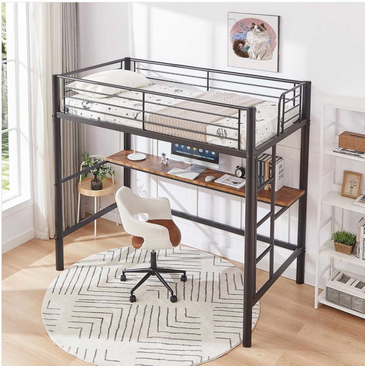
Image: Illustration of the flexible ladder design, allowing installation on either side for convenient access.