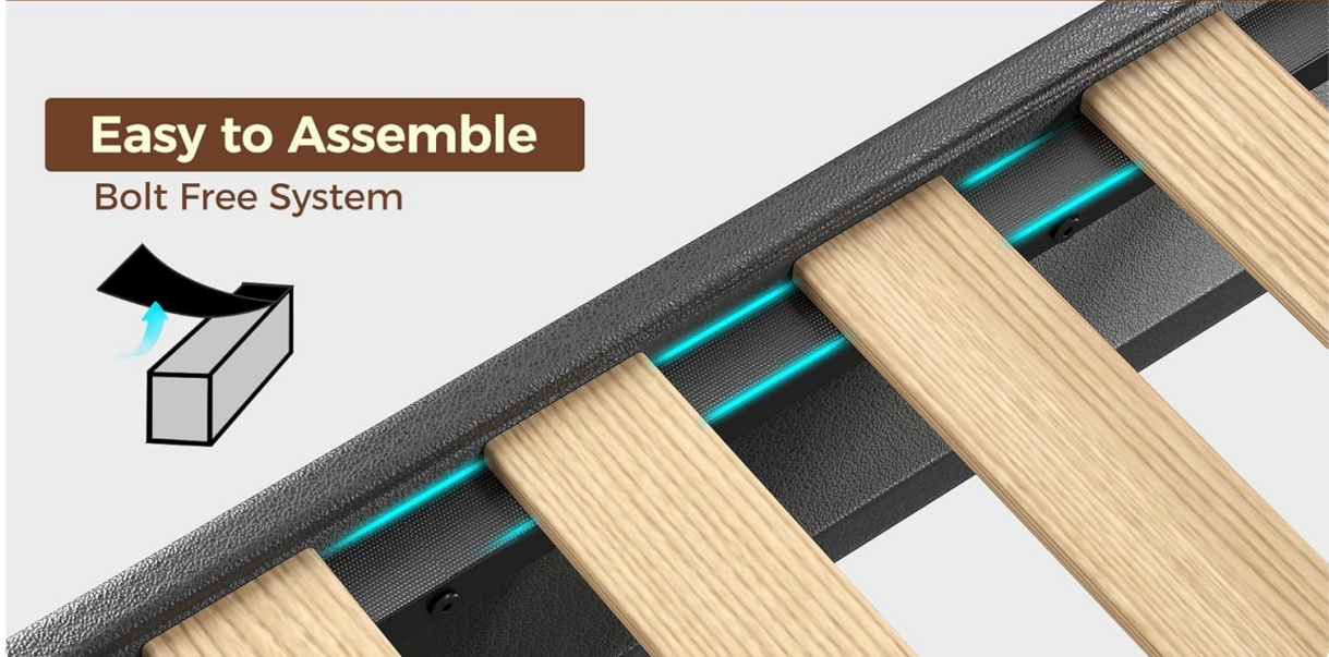
Image: Close-up view of the steel and wood mixed support system, highlighting the bolt-free slat attachment mechanism.

Your browser does not support the video tag.