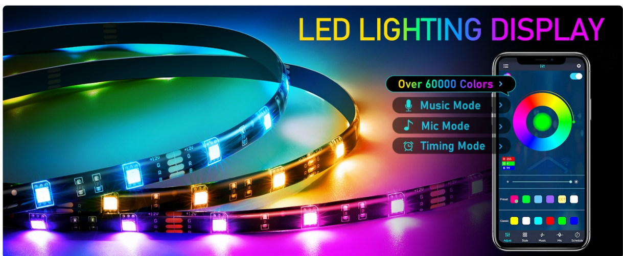
Image: A visual representation of the diverse RGB LED light colors and dynamic modes available.