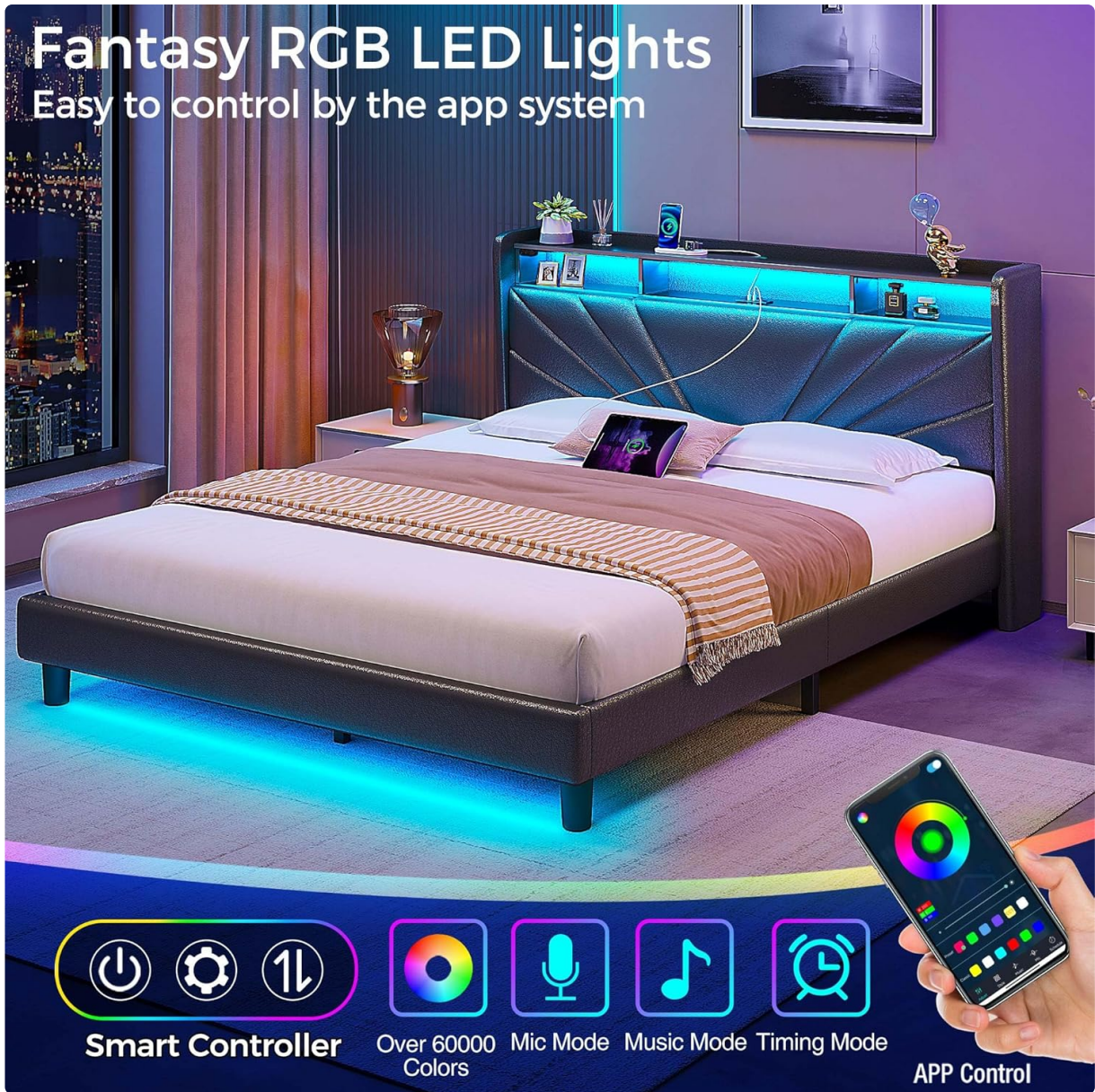
Image: The RGB LED lights illuminating the bed frame, with the remote control for adjusting settings.