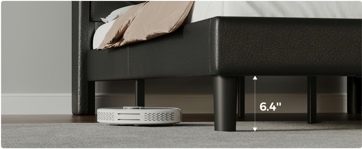
Image: The under-bed clearance, illustrating how a robot vacuum can easily pass through for cleaning.