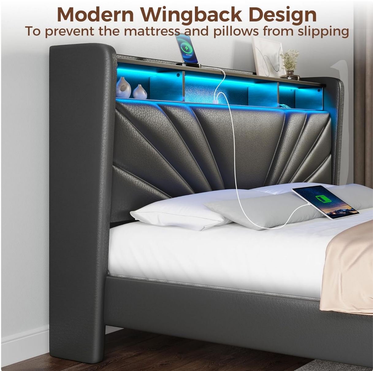
Image: The modern wingback design of the headboard, illustrating its function in securing the mattress and pillows.

Your browser does not support the video tag.