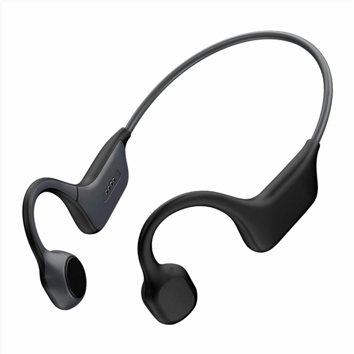
Figure 1: Front view of the DG08M Bone Conduction BT Headset.