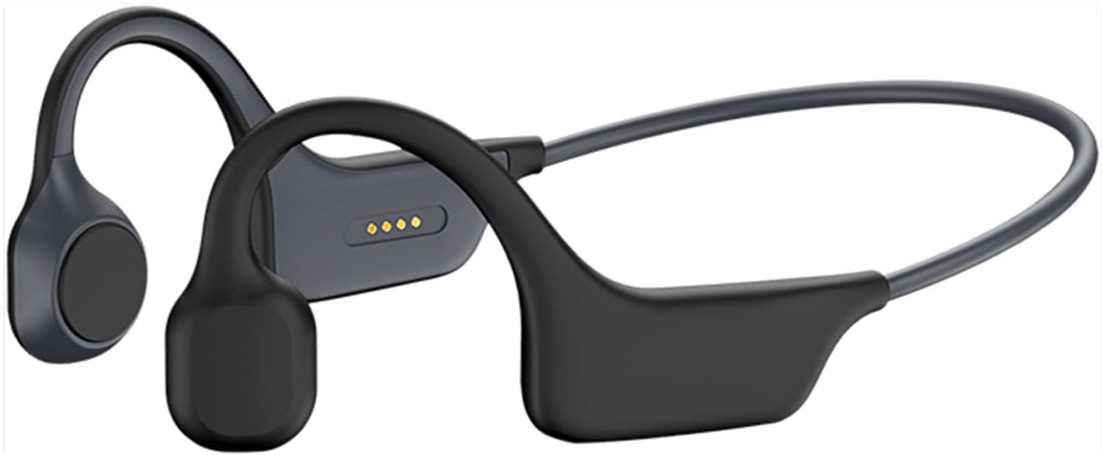
Figure 2: Side view of the headset, highlighting the charging contacts.

Before first use, fully charge the headset. Connect the charging cable to the charging port on the headset and plug the other end into a USB power source (e.g., computer USB port or wall adapter). The LED indicator will show charging status.