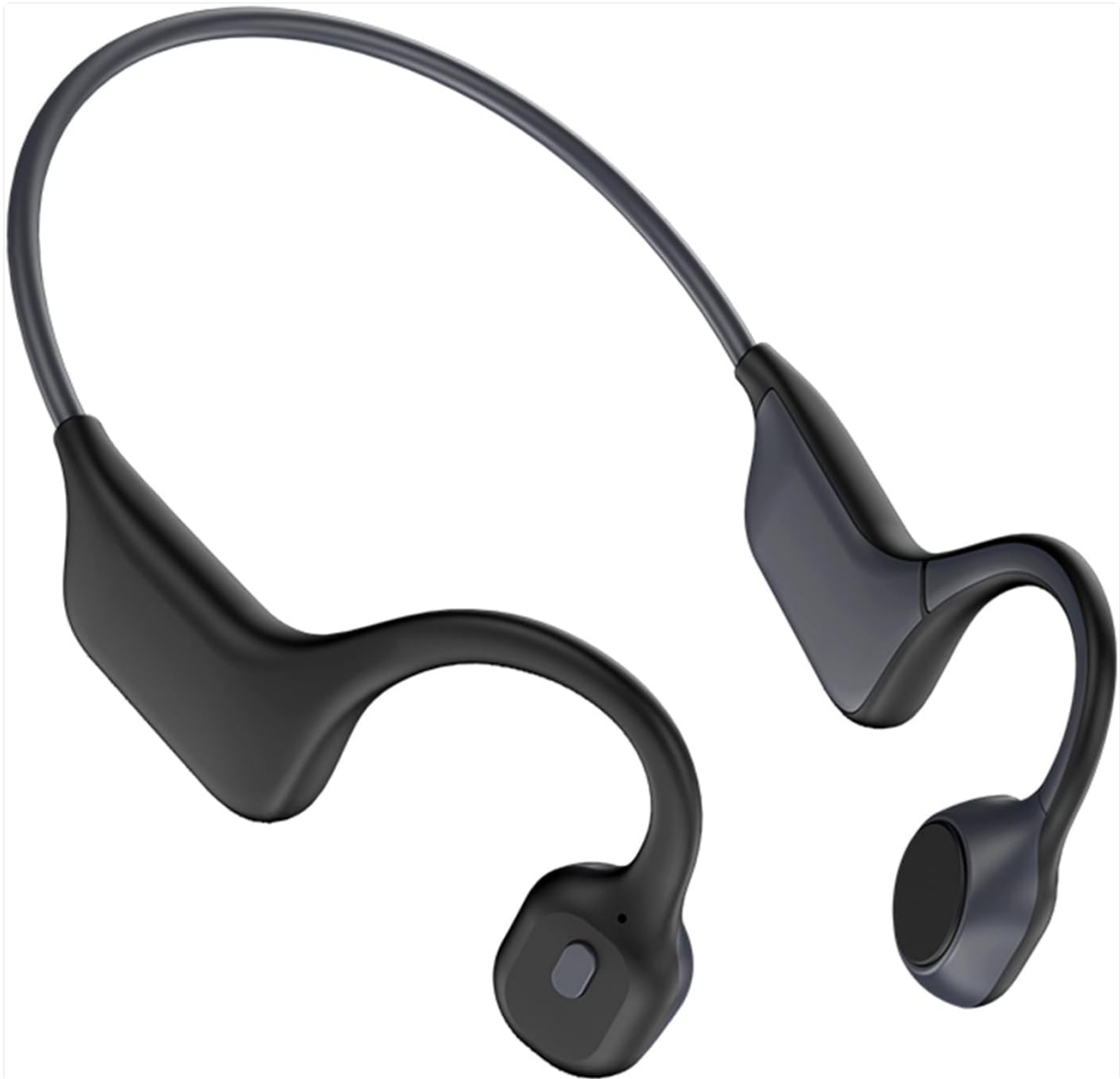
Figure 3: Side view of the headset, indicating the location of control buttons.