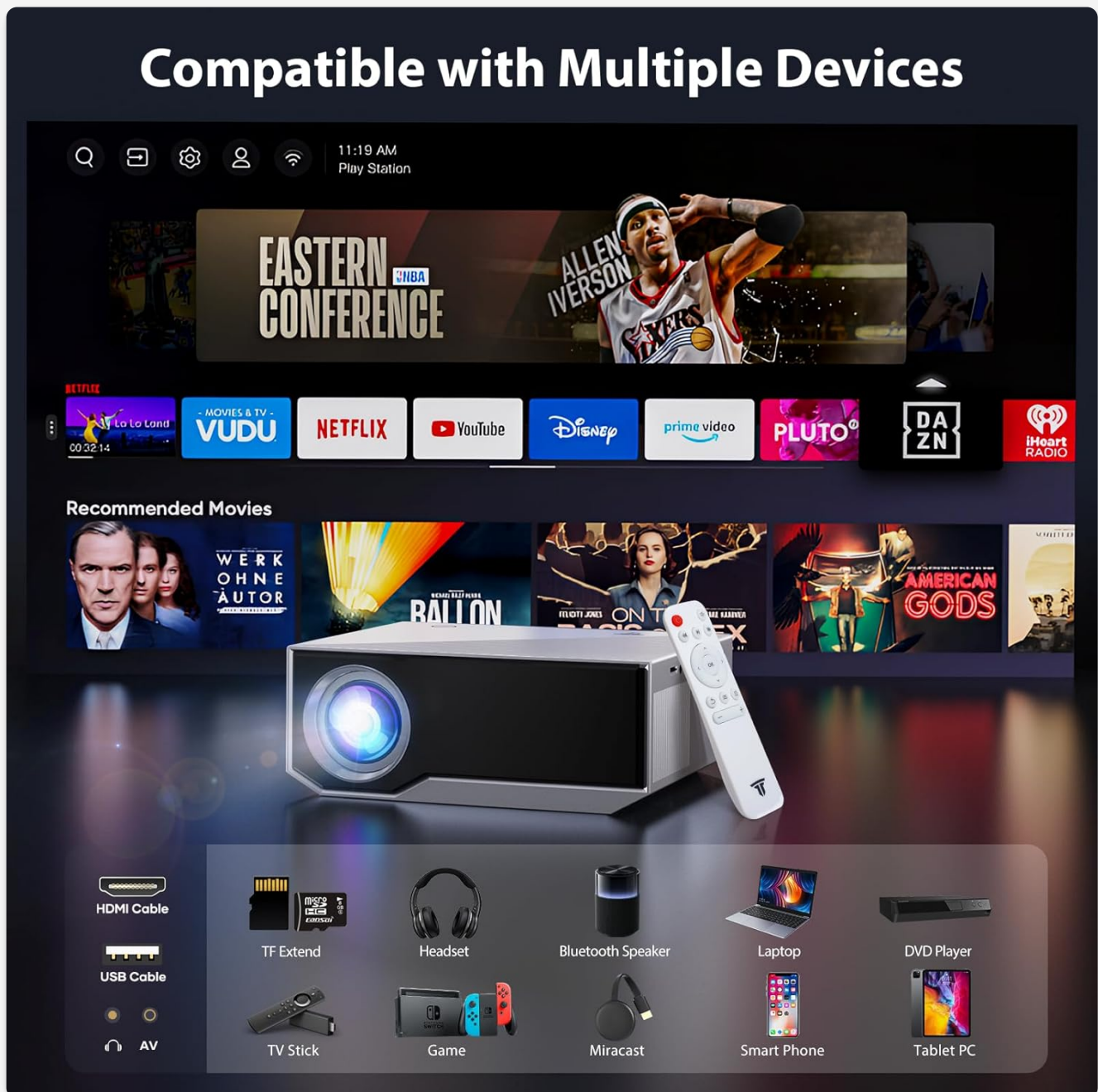
Image 4.1: Overview of the Wielio Mini Projector's compatibility with multiple devices, including HDMI cable, USB, AV, TF Extend, Headset, Bluetooth Speaker, Laptop, DVD Player, TV Stick, Game consoles, Miracast, Smartphone, and Tablet PC.

Familiarize yourself with the projector's components and connection ports.