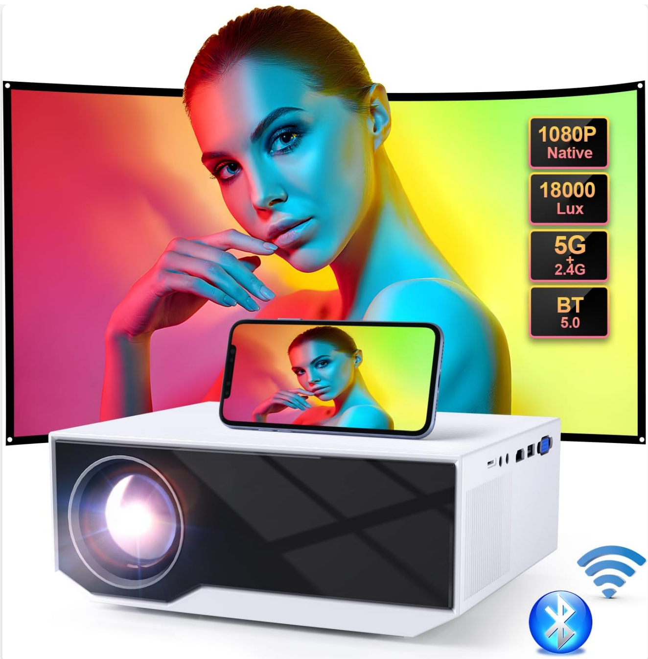
Image 1.1: Wiello Mini Projector displaying a high-quality image, highlighting its native 1080P resolution, 18000 Lumens brightness, 5G/2.4G WiFi, and Bluetooth 5.0 capabilities.