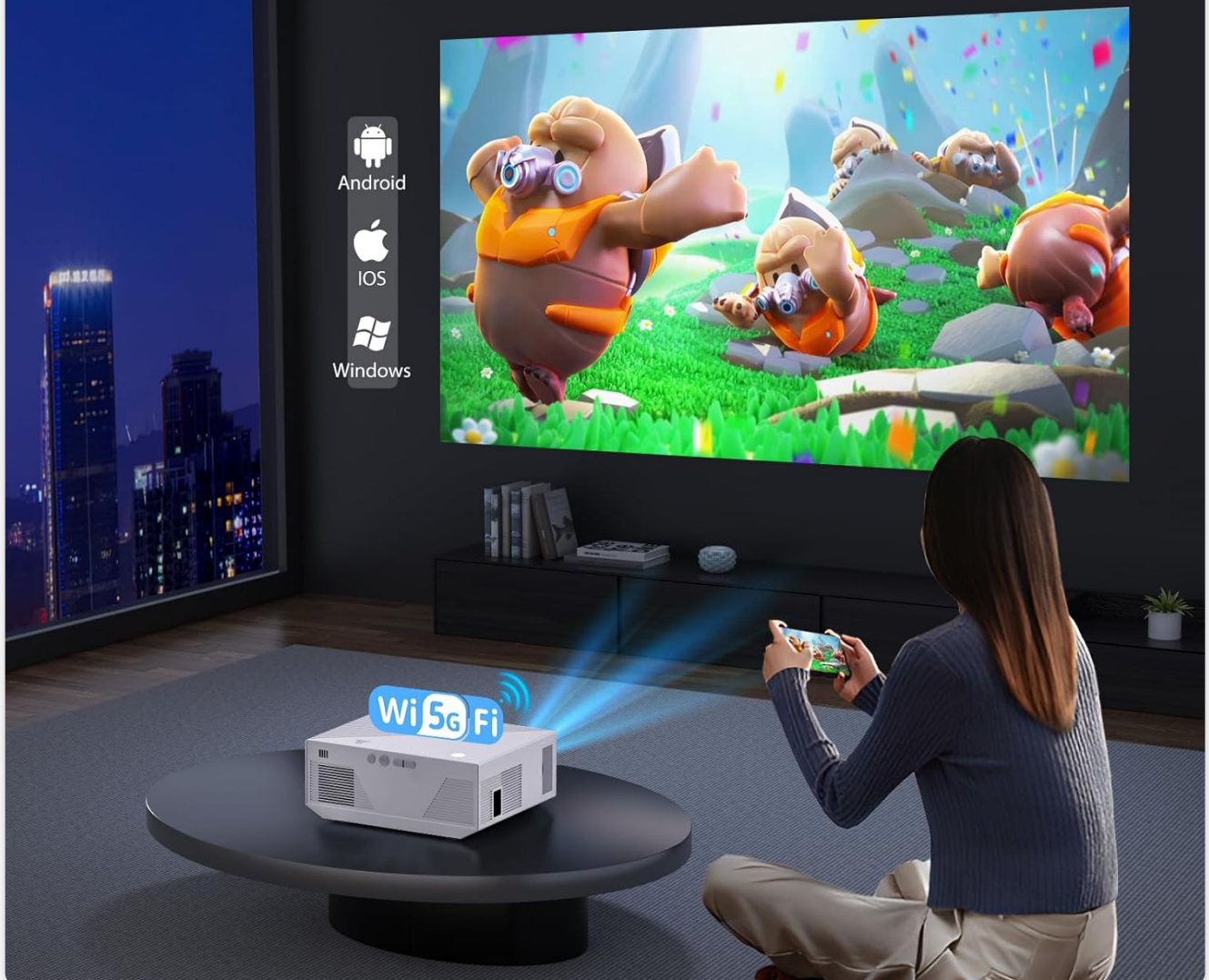
Image 6.1: Wireless screen mirroring via 5G WiFi, compatible with Android, iOS, and Windows devices for ultra-fast casting.

Ultra-fast casting, say goodbye to delay!