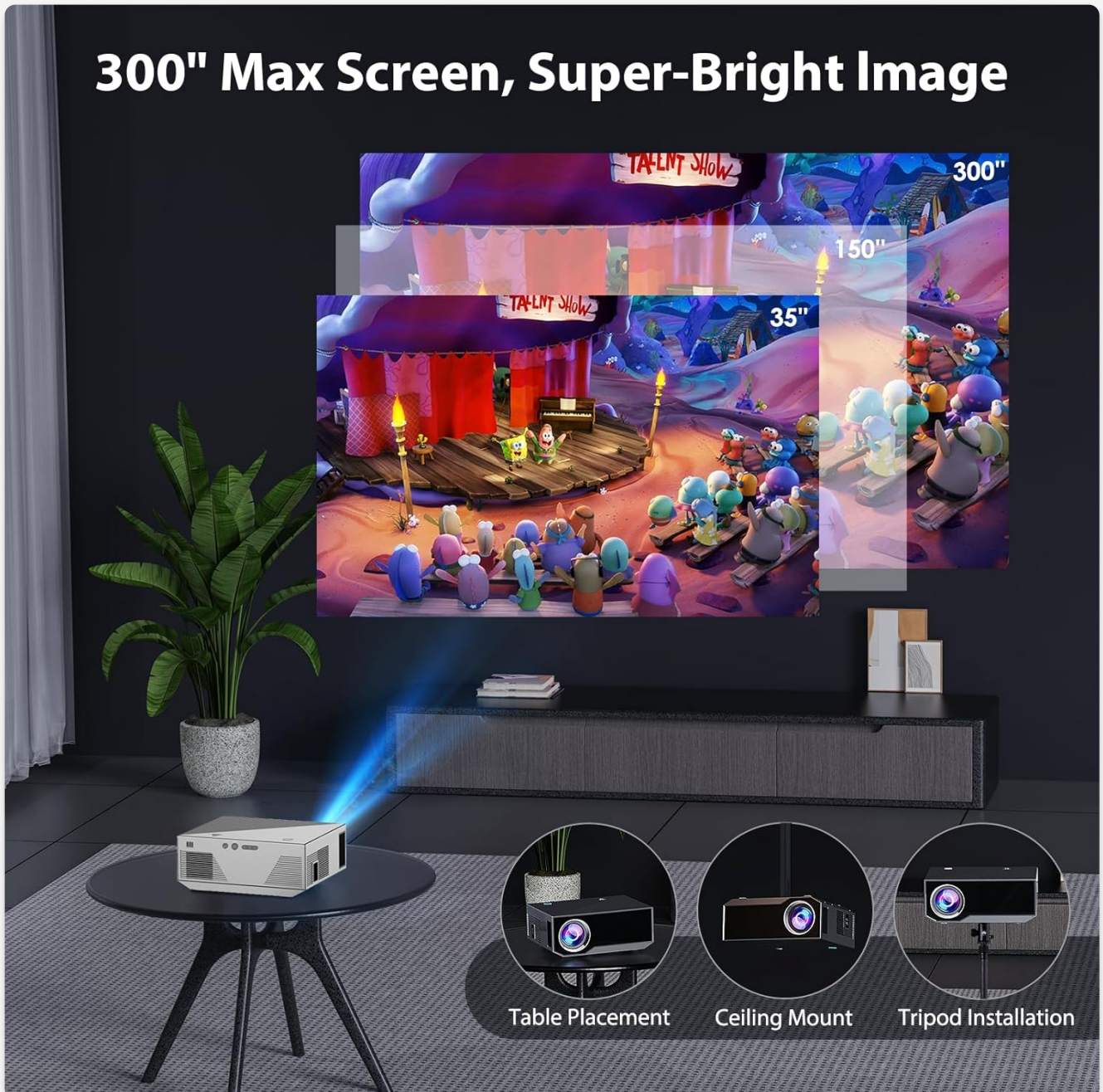
Image 5.1: The projector supports a maximum screen size of 300 inches and can be placed on a table, mounted on the ceiling, or

Choose a suitable location for your projector. The projection distance and screen size can vary. The projector supports various mounting options: