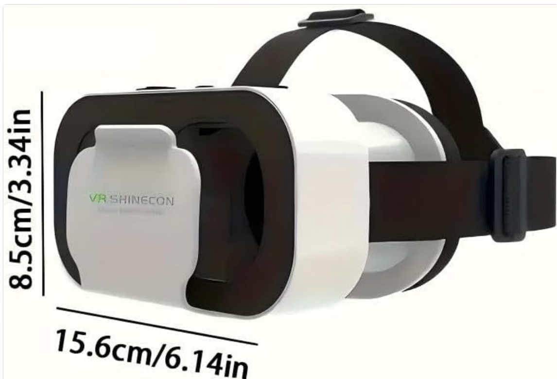
Image: Side view of the VR headset displaying its approximate dimensions.