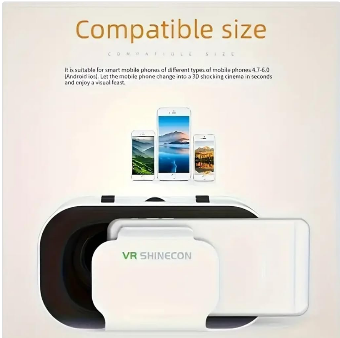
Image: Illustration of the VR headset's compatibility with various smartphone sizes.