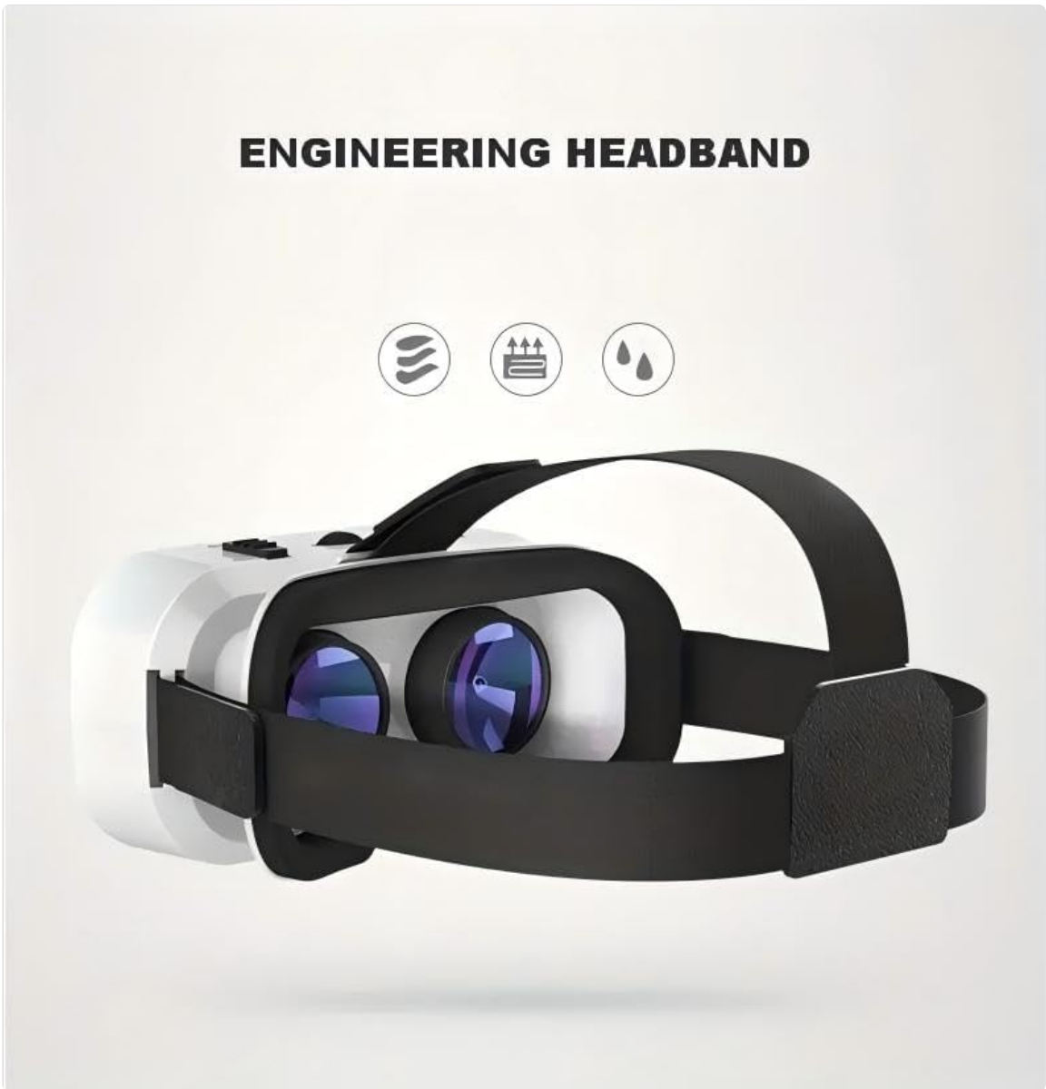
Image: The VR headset featuring its adjustable engineering headband for a comfortable fit.