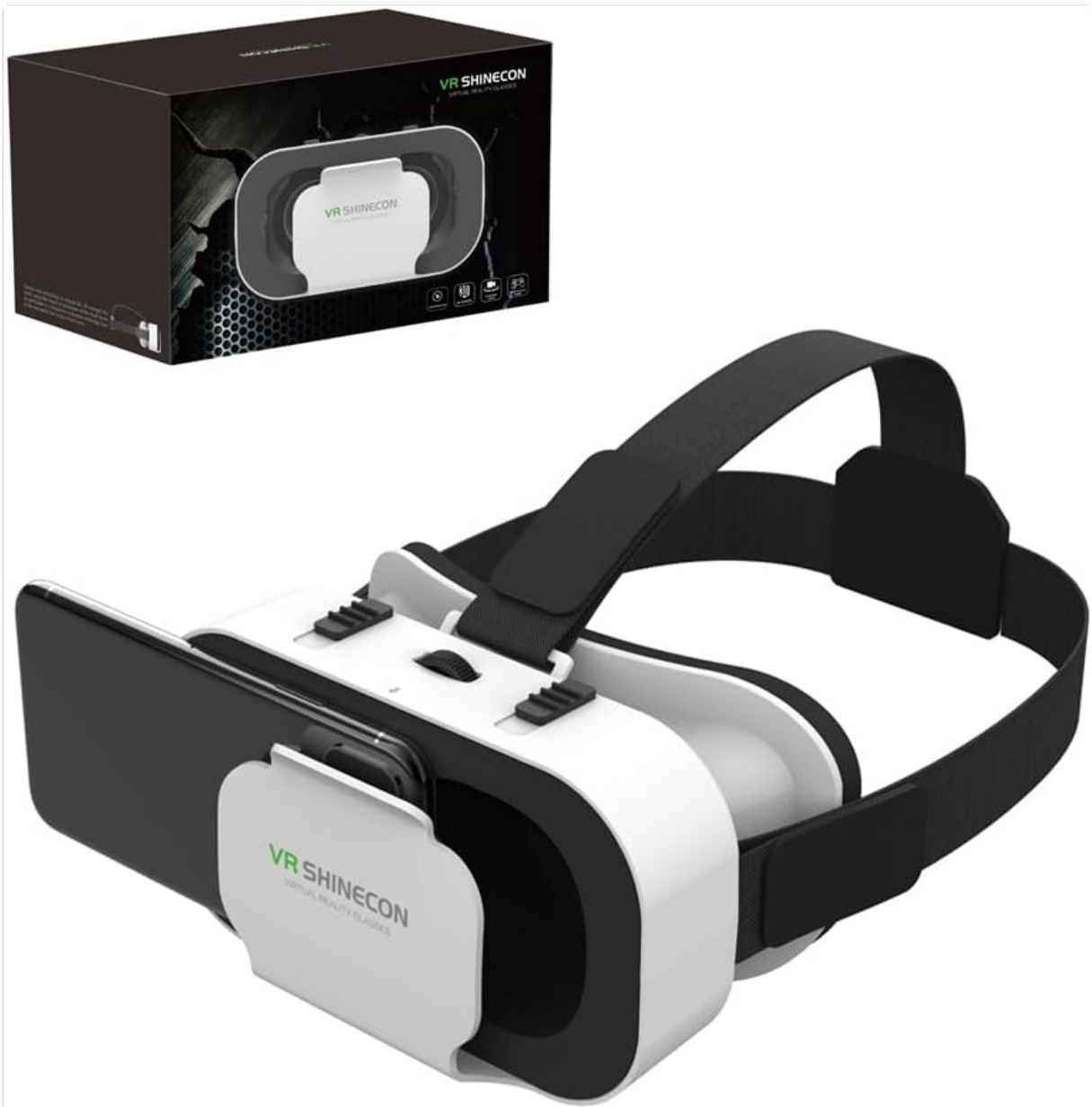
Image: The VR SHINECON SC-G05A VR Headset shown alongside its product packaging.