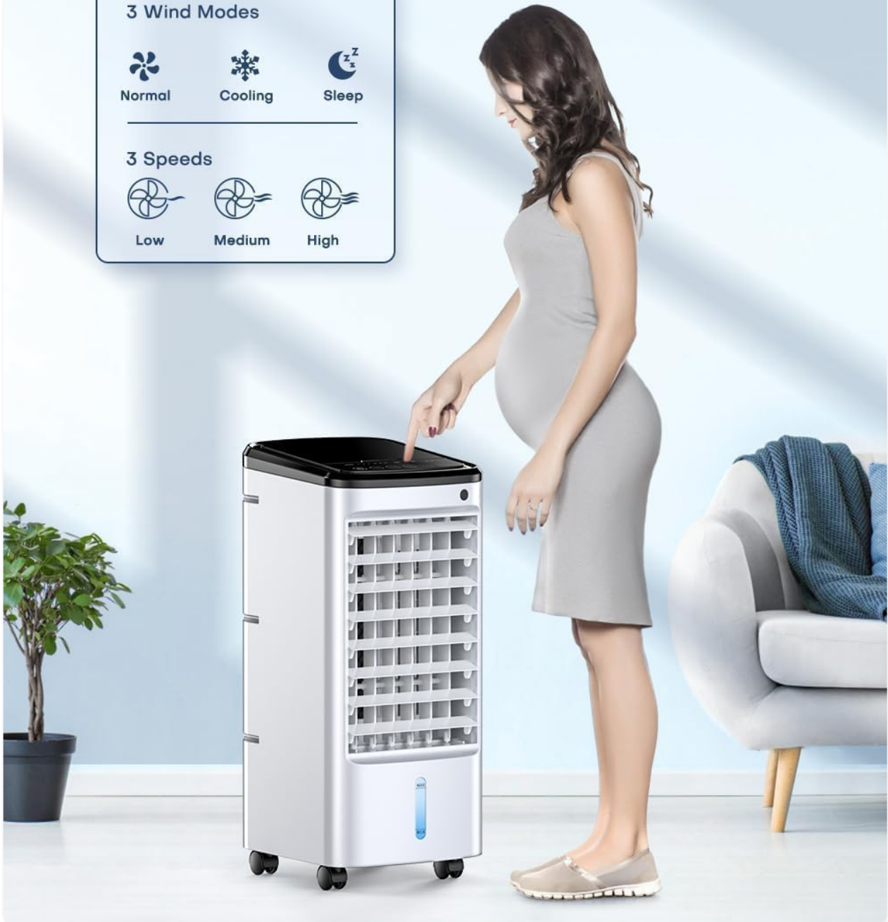
Figure 5: Customize your climate with 3 modes and 3 speeds.