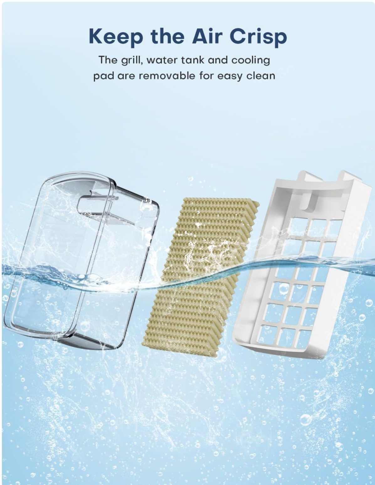
Figure 4: Components for easy cleaning, including the cooling pad and water tank.

Video: Instructions on how to add ice packs for an extra boost of coolness.