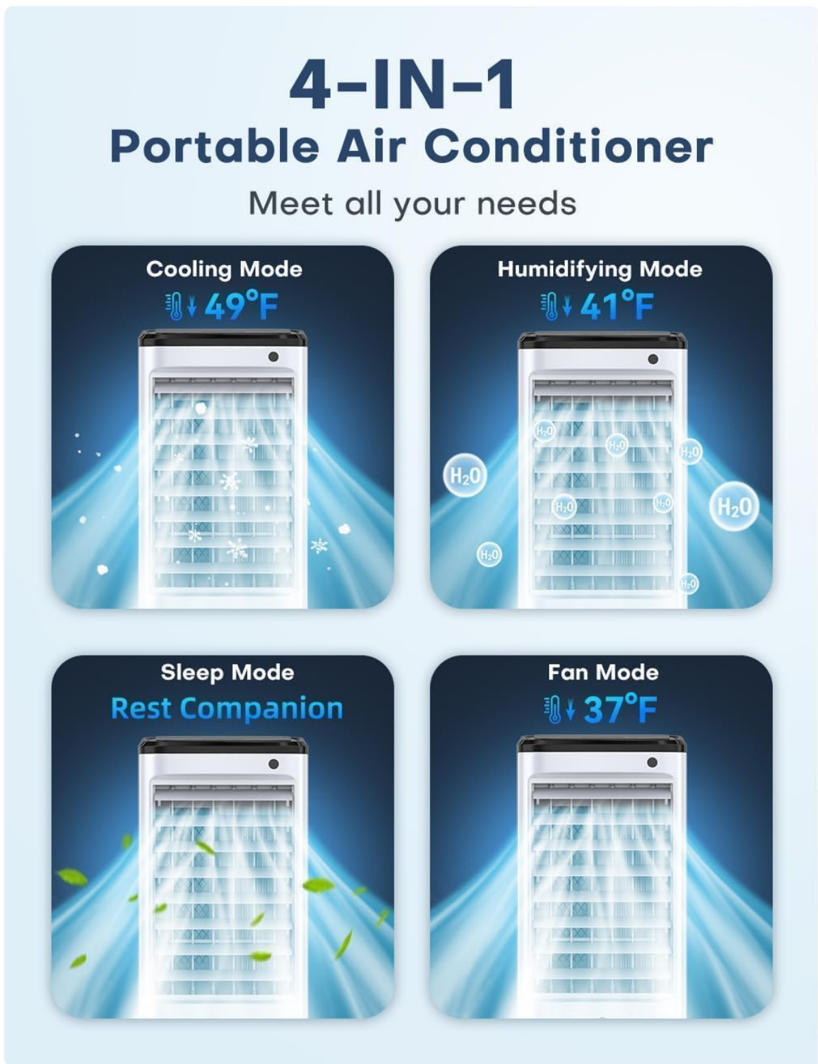
Figure 6: The 4-IN-1 Portable Air Conditioner meets various cooling needs.

Your browser does not support the video tag. Please update your browser.