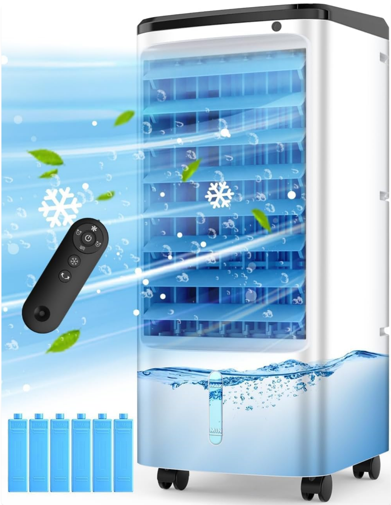
Figure 1: TEMEIKE Evaporative Air Cooler with included remote and ice packs.