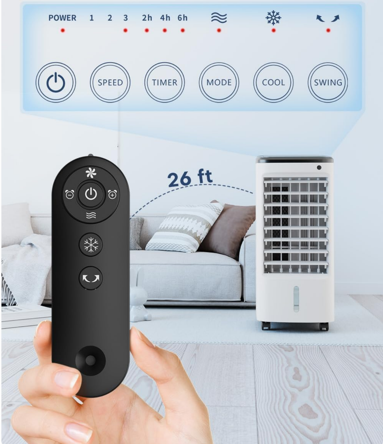
Figure 2: Touch Control Panel and Remote Control for easy operation.