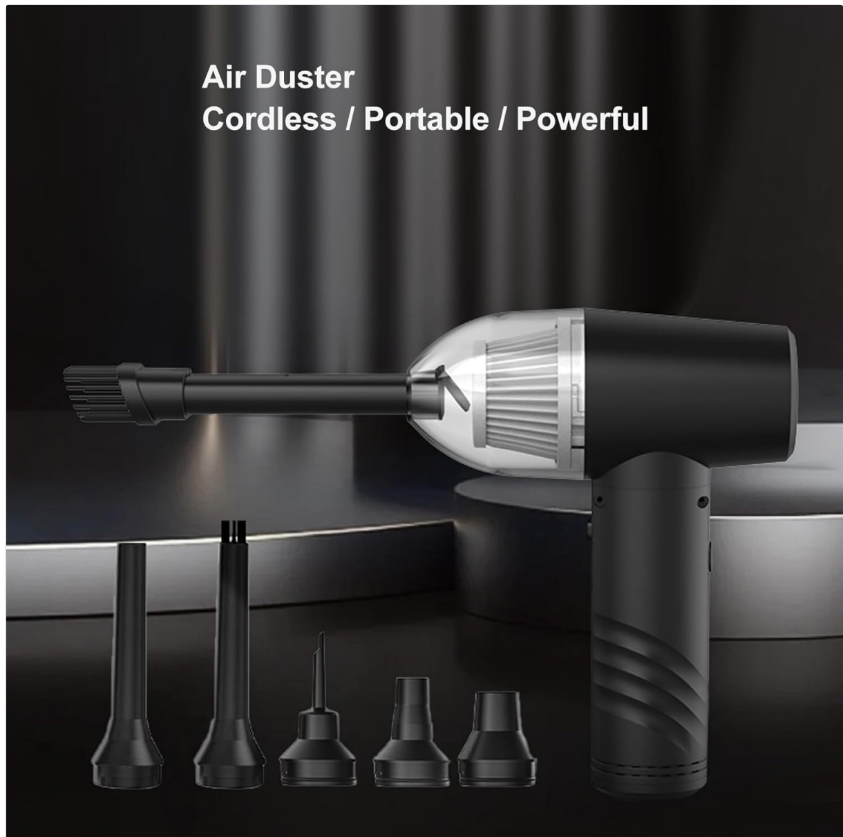
Image: The Cuifati Air Duster main unit with several interchangeable nozzles laid out, including a brush nozzle, a narrow blowing nozzle, and various inflation nozzles.

The image below shows the main unit and included accessories.