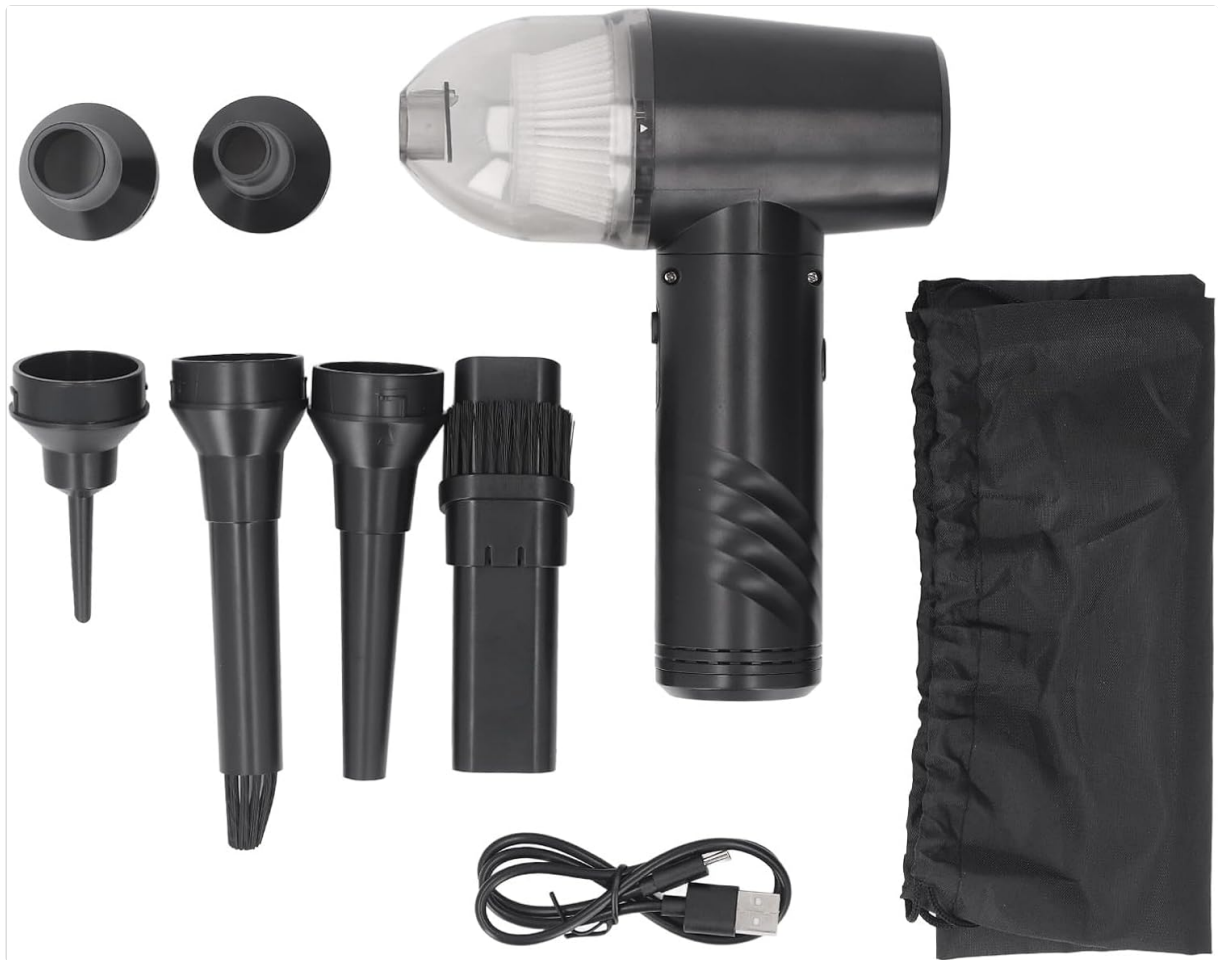
Image: A top-down view of the Cuifati Air Duster unit, charging cable, storage bag, and all included nozzles and attachments.