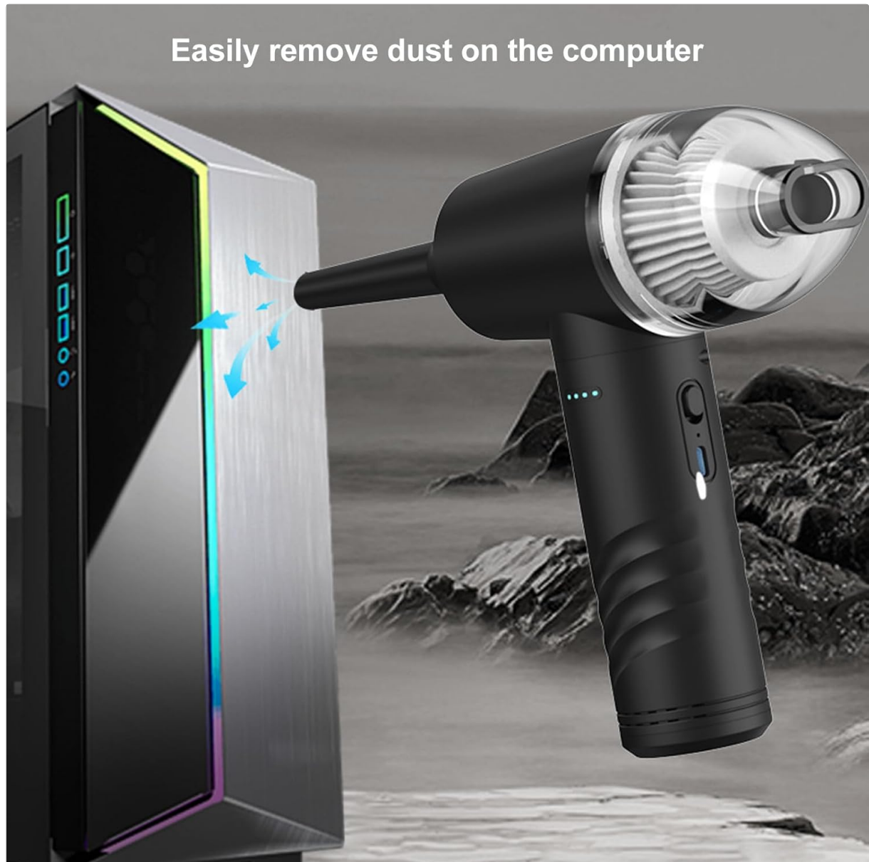
Image: The Cuifati Air Duster being used to blow dust out of the vents of a computer tower, illustrating its effectiveness for electronic cleaning.

Effectively remove dust from computer components and other electronics.