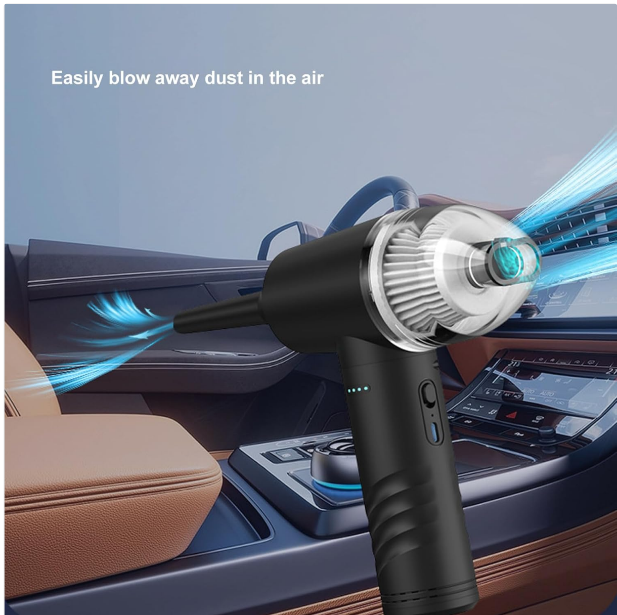
Image: The Cuifati Air Duster blowing dust from the dashboard of a car, demonstrating its use for automotive interior cleaning.