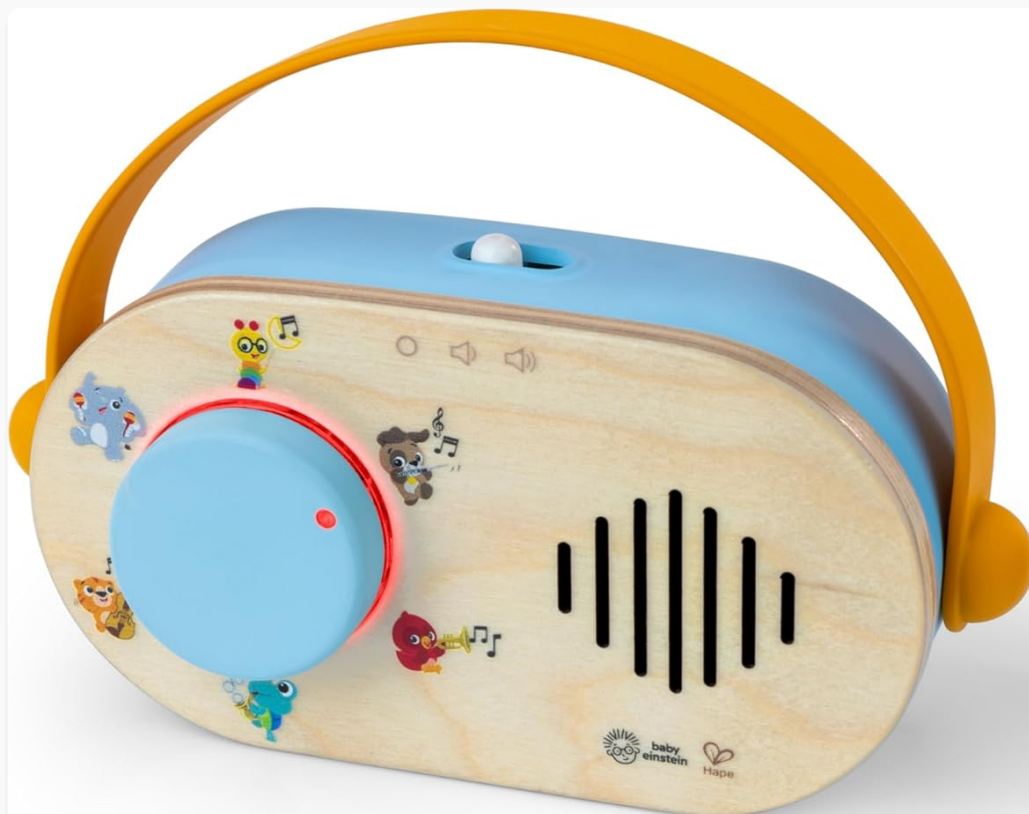
Image 1: The Baby Einstein + Hape Discovery Radio Toy, showcasing its design and colors.

The Baby Einstein + Hape Discovery Radio Toy is designed to engage babies aged 6 months and up in real-world learning through music and sound. This Montessori-inspired toy features over 40 melodies and sounds, colorful lights, and encourages the development of fine motor skills and cause-and-effect understanding. Crafted from FSC certified wood, it offers a durable and portable design with adjustable volume levels for comfort and peace of mind.