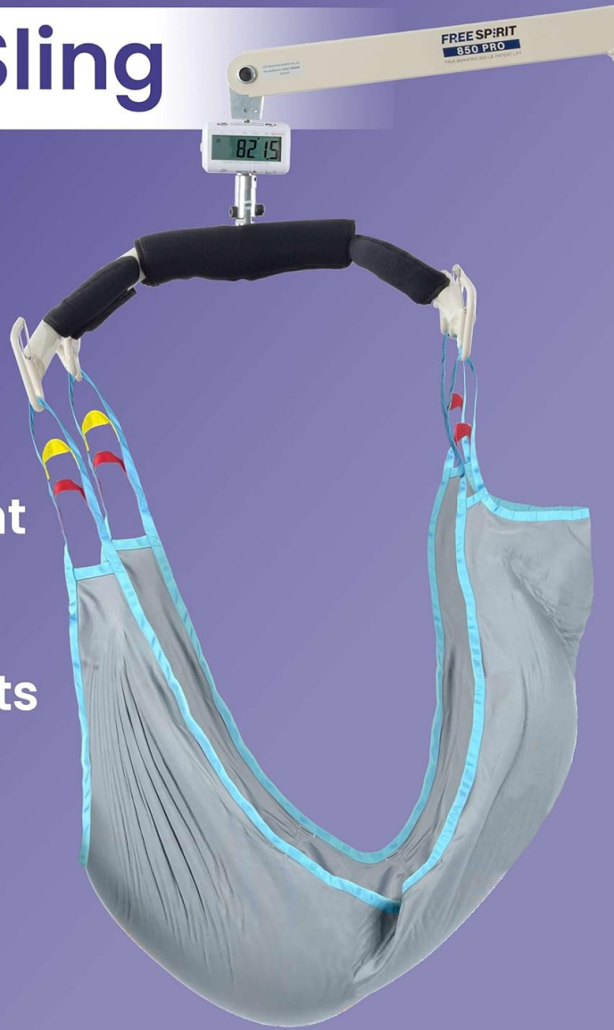
Image: The full body sling providing comprehensive support.