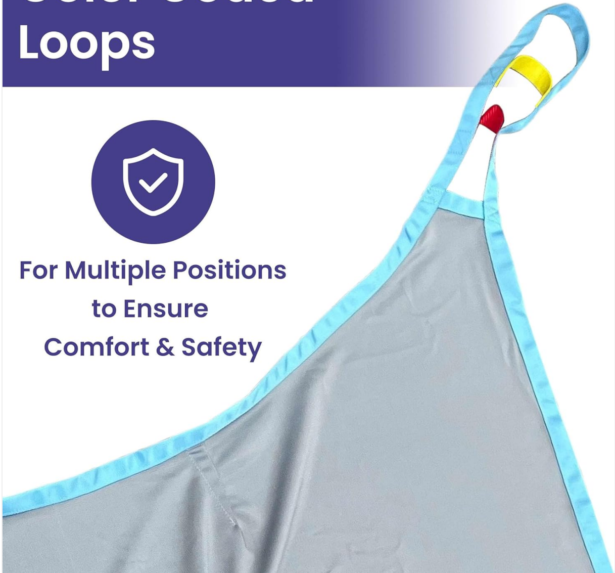
Image: Detail of color-coded loops for secure and versatile positioning.

For Multiple Positions to Ensure Comfort & Safety