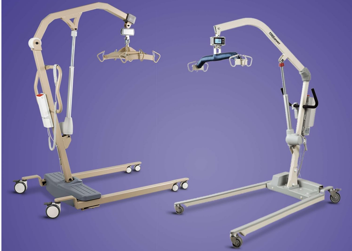
Image: Universal compatibility with various patient lift systems.

Works with Medacure and Most Patient Lift Brands