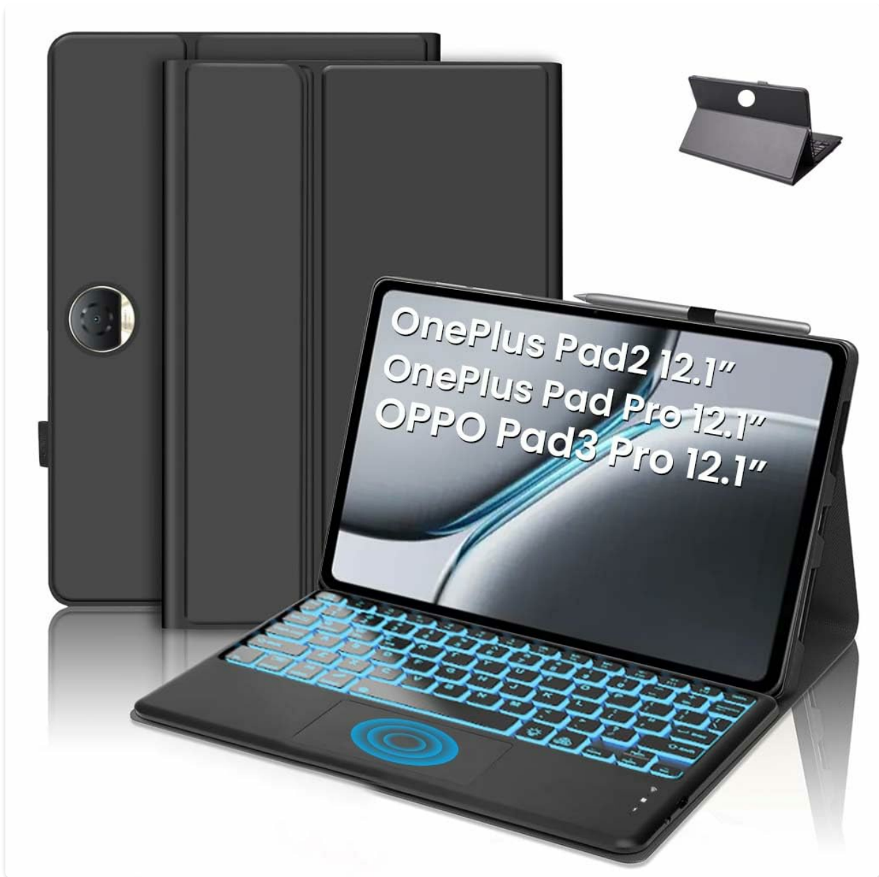
Image: TECPHILE Keyboard Case with a tablet inserted, showcasing the backlit keyboard and pen holder.