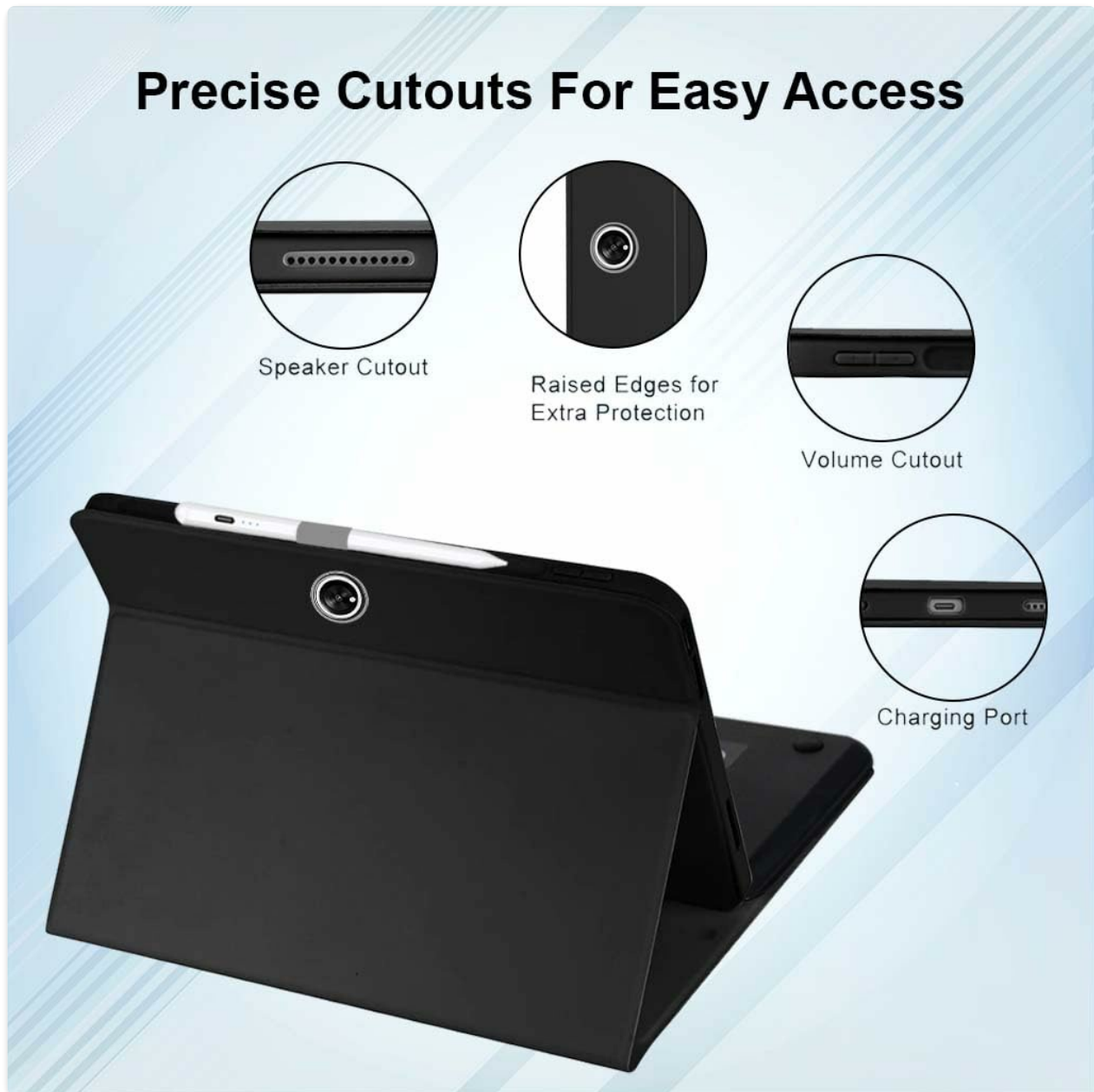
Image: Keyboard layout showing backlight color options and trackpad functionality.