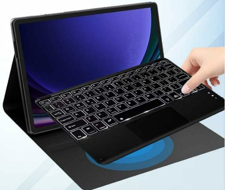
Image: The detachable Bluetooth keyboard, highlighting its magnetic attachment and scissor-key structure.