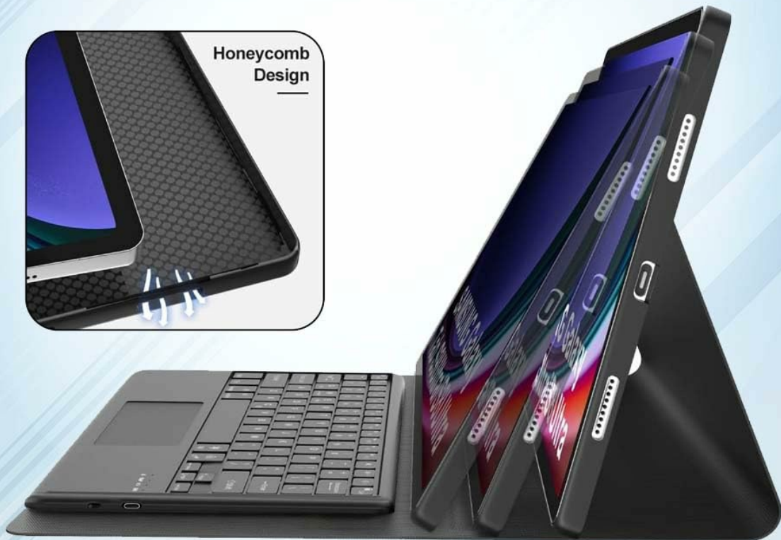
Image: Illustration of the case supporting various viewing angles for different activities.