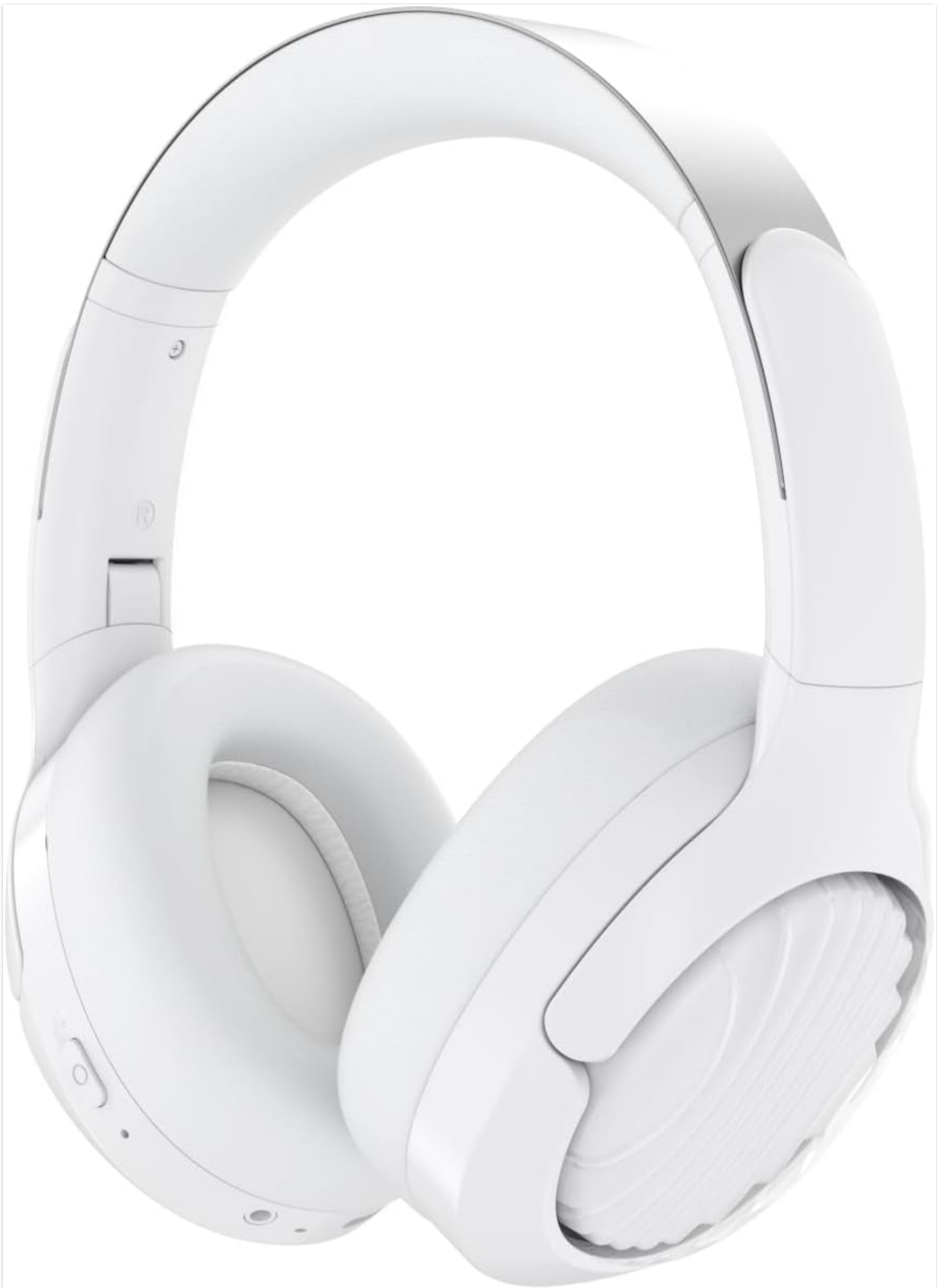
Image: A clear front view of the white Rebocico Active Noise Cancelling Headphones, highlighting their sleek design and over-ear cups.