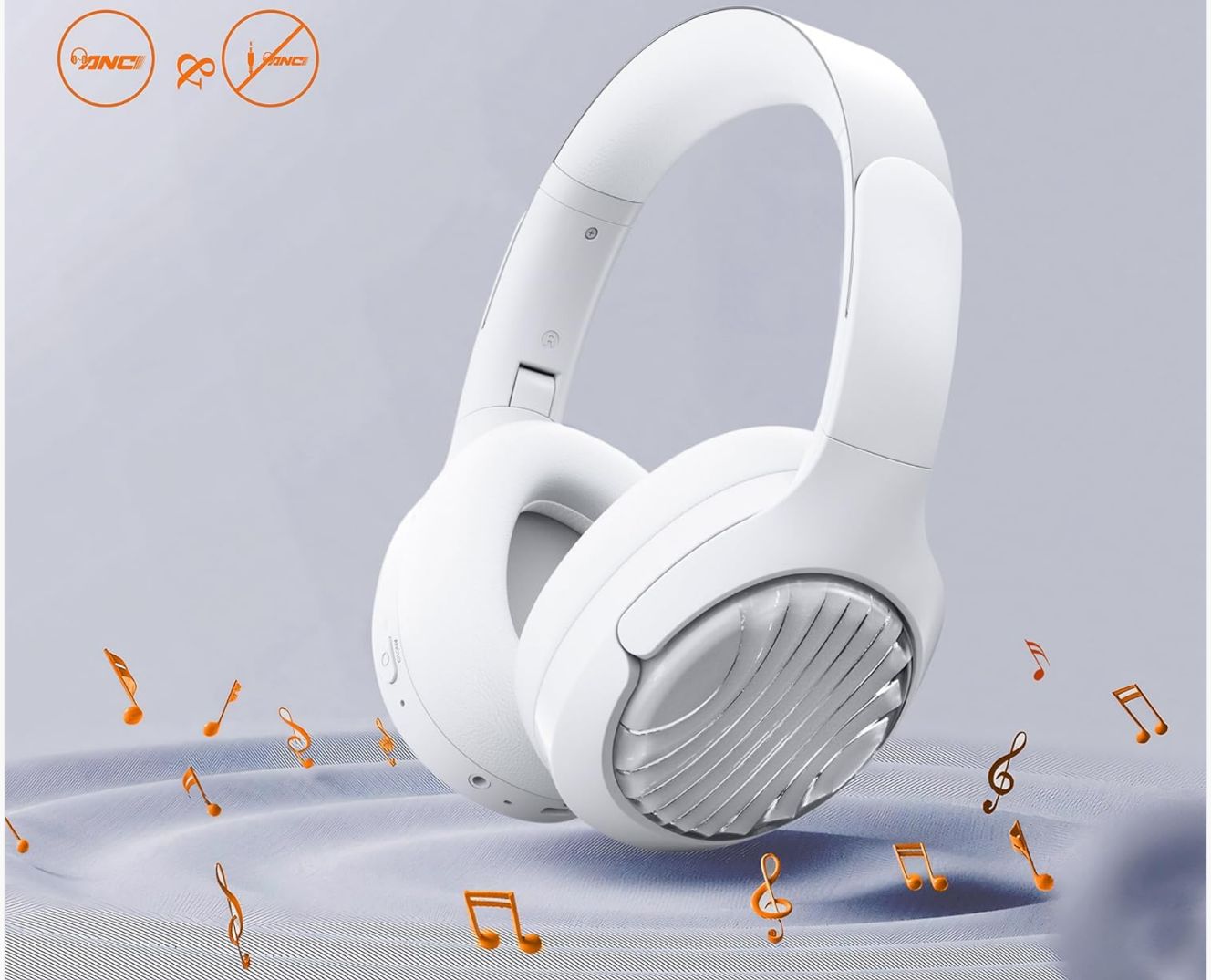
Image: The headphones with a visual emphasis on the Active Noise Cancelling (ANC) button, indicating its function to create a tranquil listening environment.