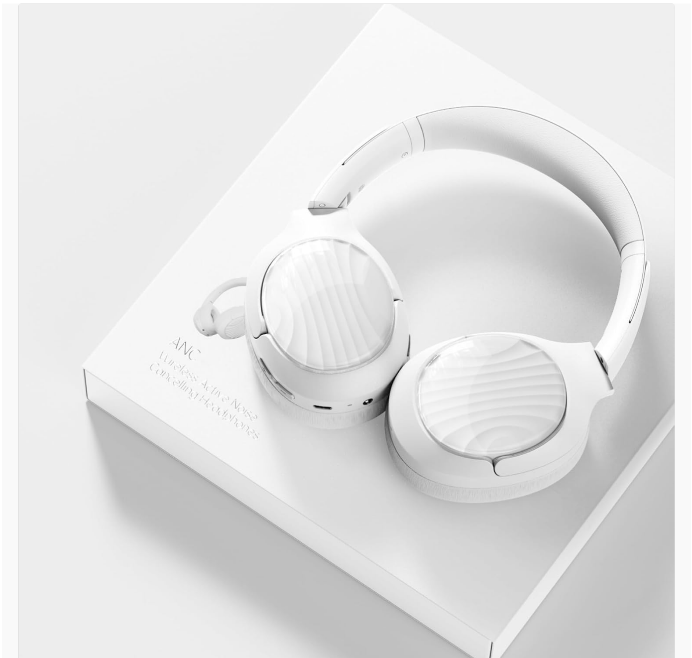
Image: The Rebecico Active Noise Cancelling Headphones resting on their white retail box, showcasing the product and its immediate packaging.