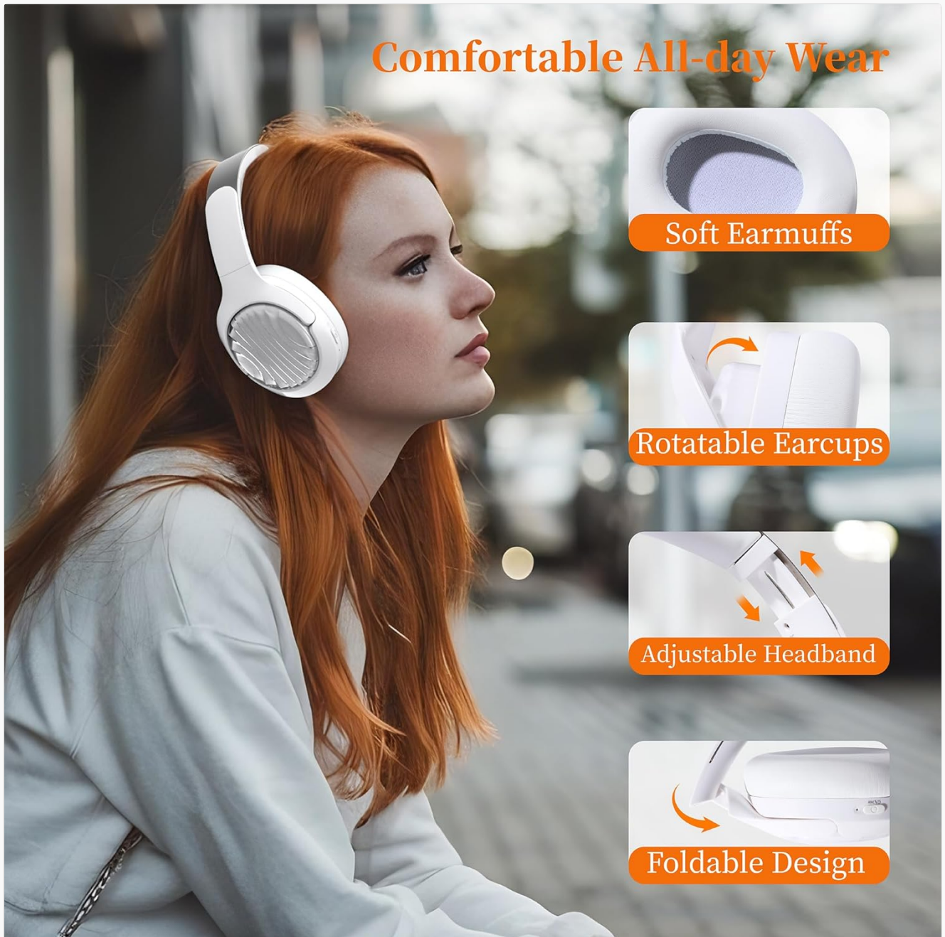
Image: A visual breakdown of the comfort features, including soft earmuffs, rotatable earcups, adjustable headband, and foldable design, demonstrated on a person wearing the headphones.