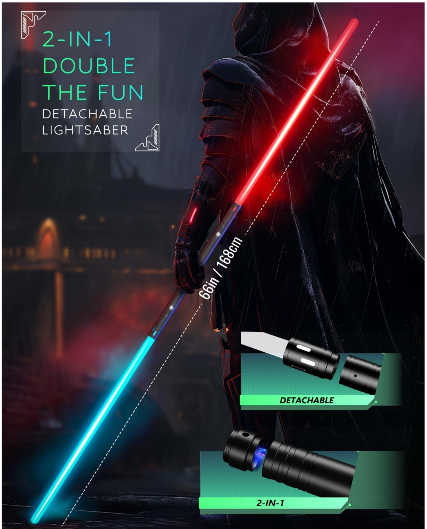
Image: A visual guide illustrating the process of connecting two individual lightsaber handles with a central connector to create a double-bladed lightsaber.