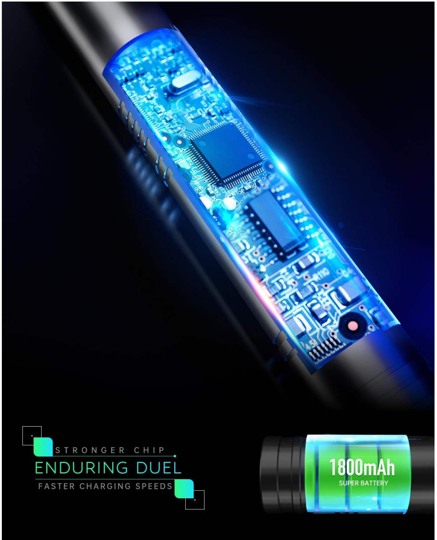
Image: A detailed view of the lightsaber's internal components, highlighting the circuit board and a graphic representation of the 1800mAh battery with a charging indicator.