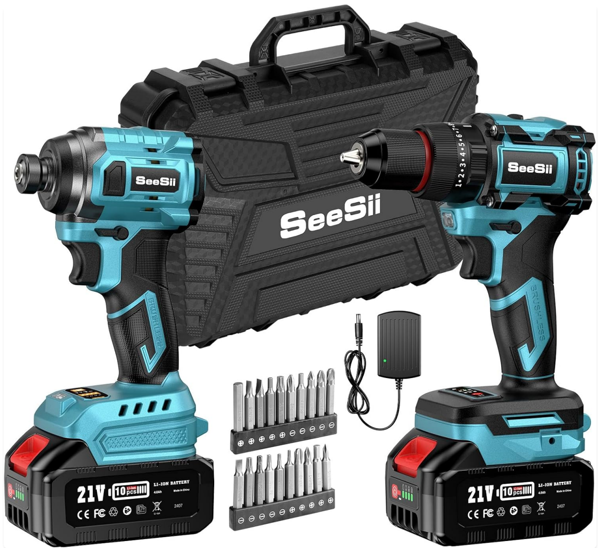
Image: The SEESII 21V Max Cordless Drill and Impact Driver Combo Kit, including the drill, impact driver, two 4.0Ah batteries, a fast charger, a 20-piece driver bit set, and a durable carrying bag.