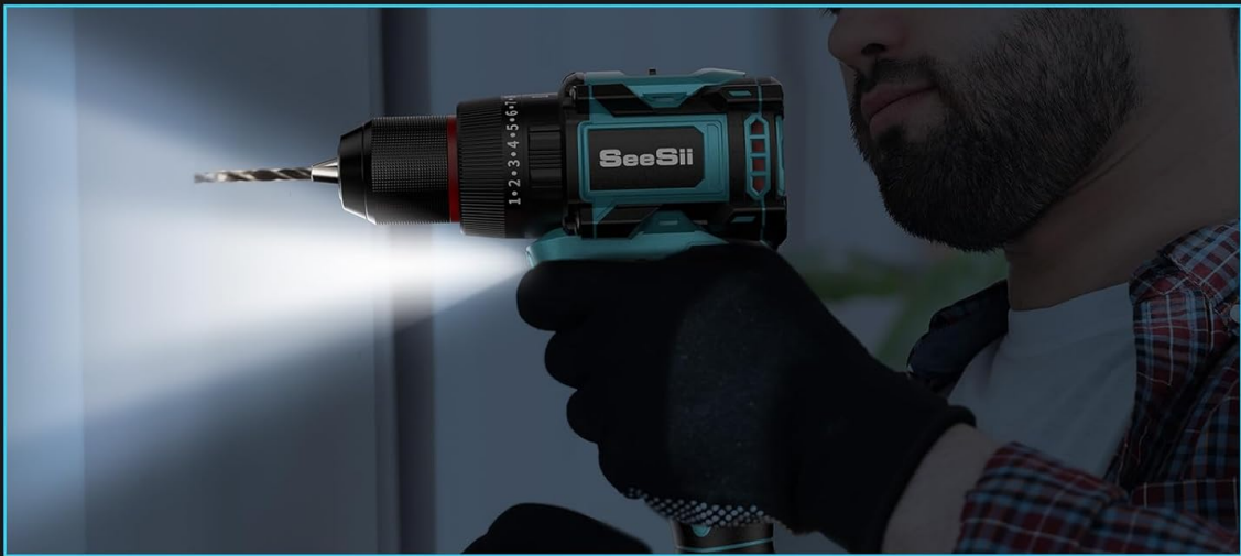
Image: The integrated LED work light on both the impact driver and the drill, providing illumination for improved visibility in low-light conditions during operation.