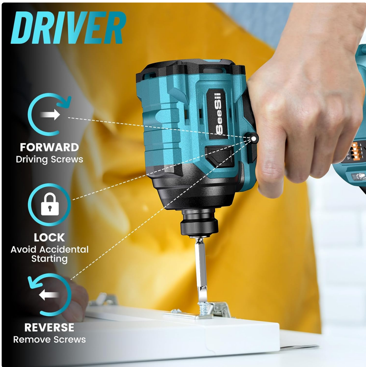
Image: An illustration of the impact driver's directional controls: Forward for driving screws, Lock to prevent accidental starting, and Reverse for removing screws.