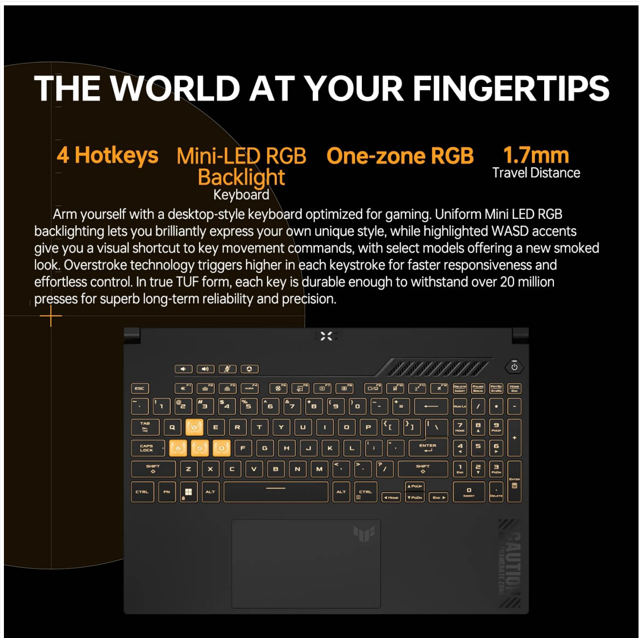
Figure 3: Detailed view of the RGB backlit keyboard.

Your laptop features an RGB backlit keyboard designed for gaming and productivity.