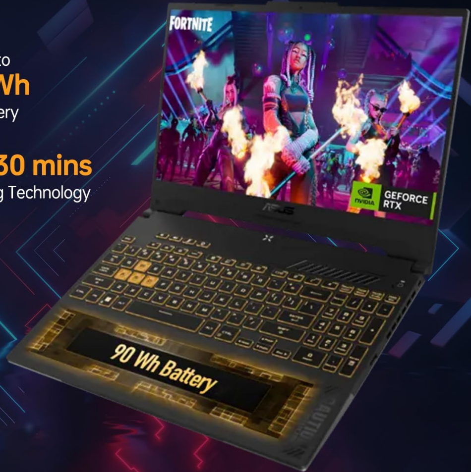
Figure 4: Laptop in use, demonstrating its gaming capabilities.