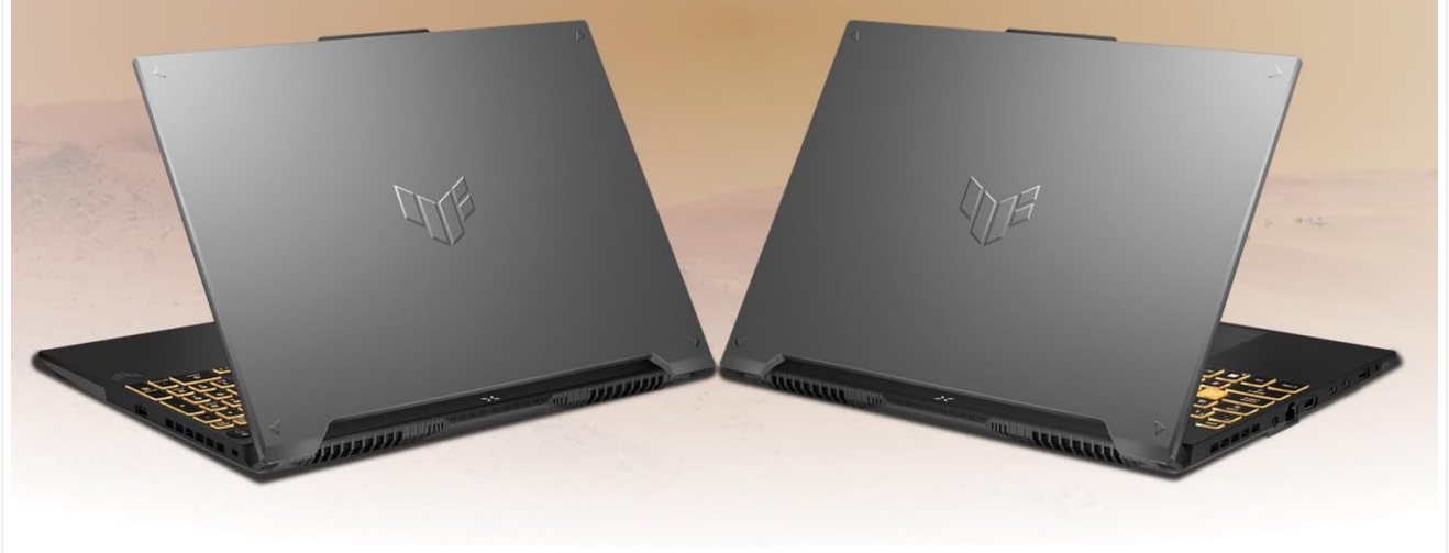
Figure 1: ASUS TUF Gaming Laptop highlighting key performance features.