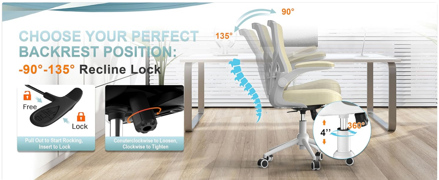
Figure 3: Chair adjustment mechanisms including height, recline, and swivel

To adjust the chair's height (up to 4 inches of adjustment), locate the lever on the right side, beneath the seat. Pull the lever up while seated to lower the chair, or pull the lever up while standing to raise the chair. Release the lever at your desired height.