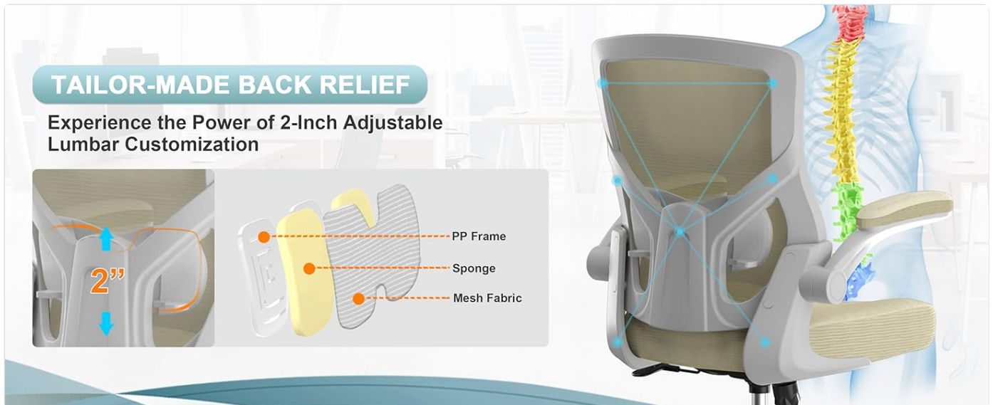
Figure 5: Adjustable lumbar support for personalized back comfort