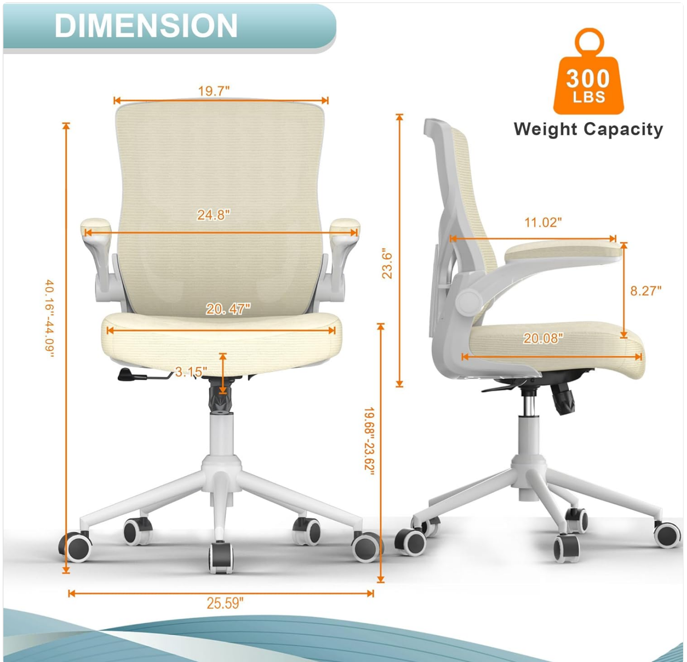
Figure 6: Detailed dimensions of the office chair