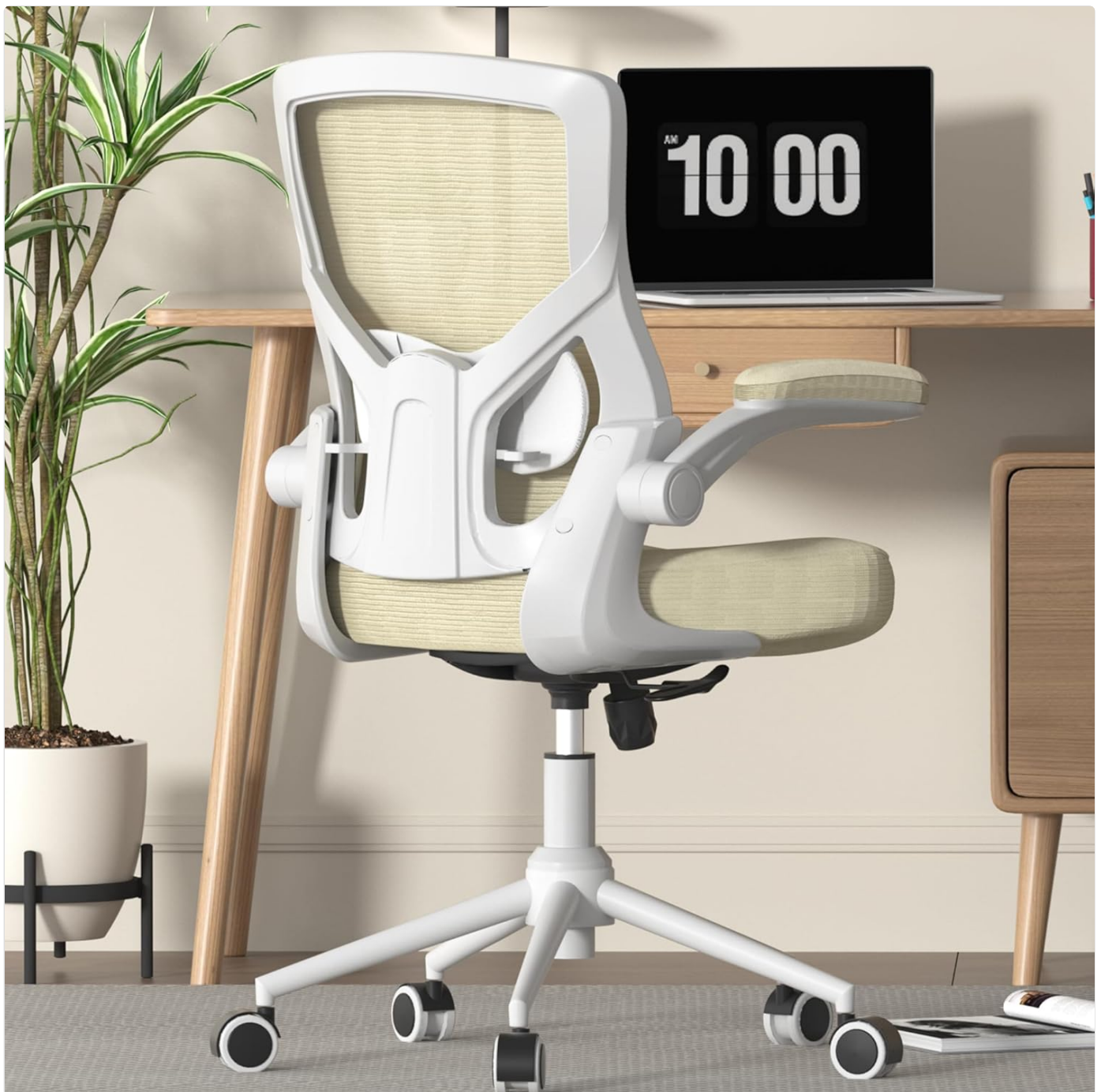
Figure 1: CYKOV Office Chair (Beige)