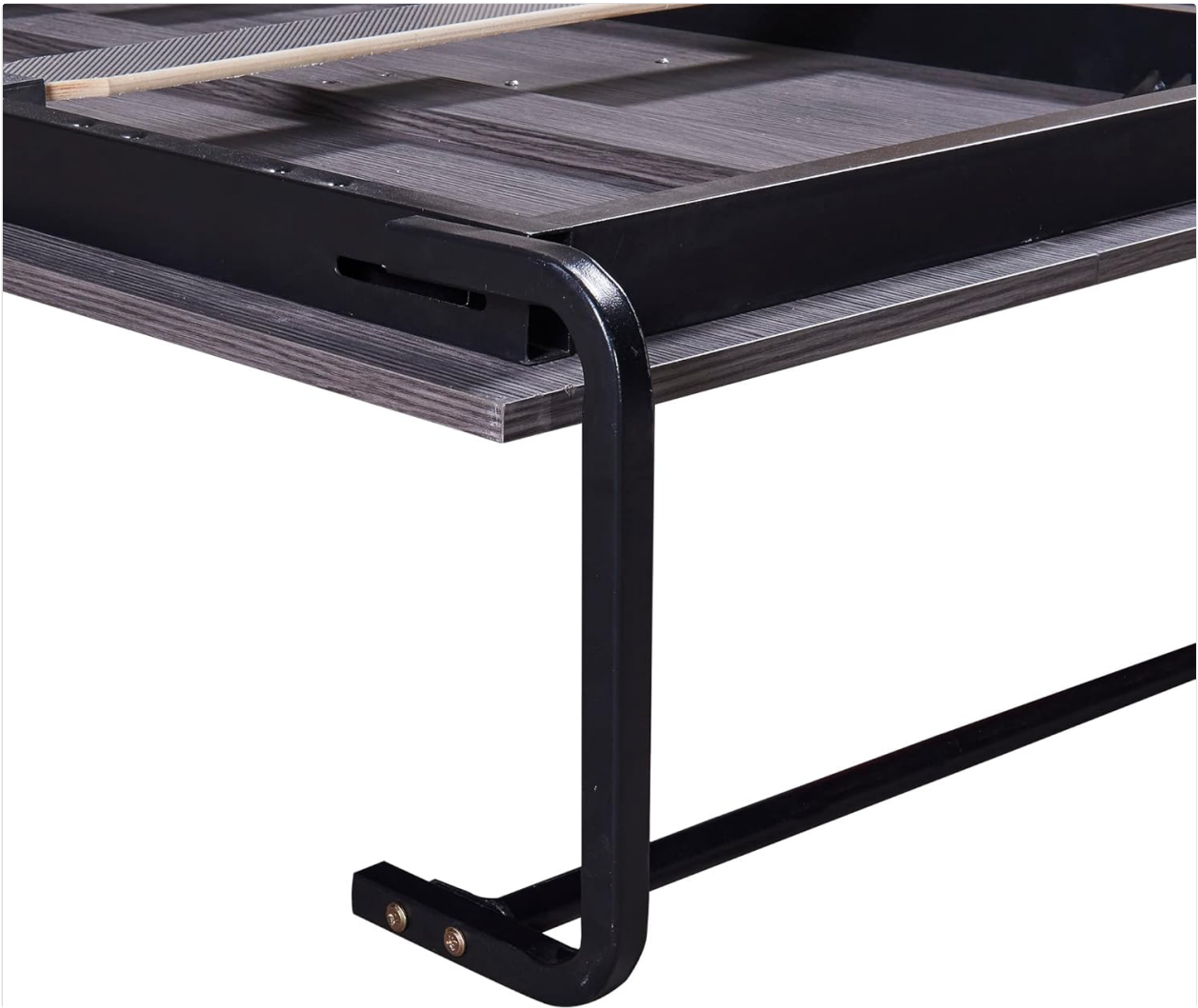
Image: A detailed view of the metal leg and frame structure of the RuiSiSi Murphy Bed, highlighting the robust construction that supports the bed when unfolded.