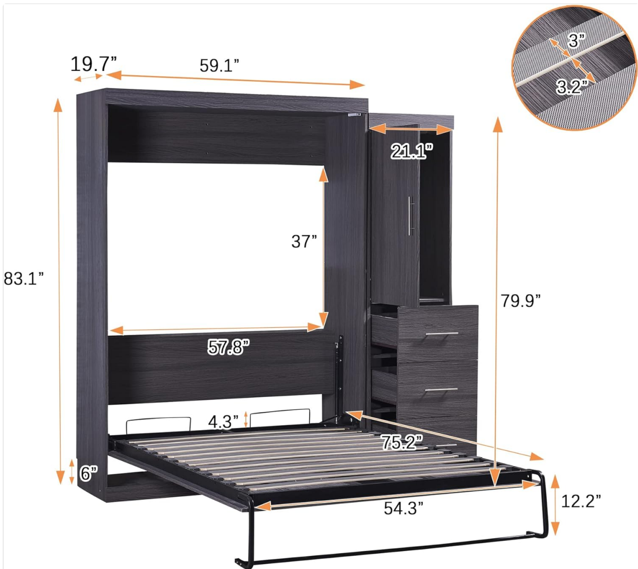
Image: The RuiSiSi Murphy Bed fully unfolded and set up in a room, ready for use. The full-size bed is extended, and the integrated wardrobe and drawers are visible on the right side of the unit.