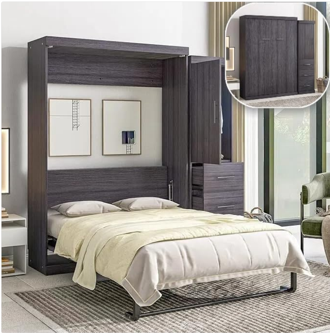
Image: The RuiSiSi Murphy Bed in its folded position, appearing as a sleek cabinet unit with an integrated wardrobe and drawers on the side. The bed is completely concealed within the main cabinet structure.