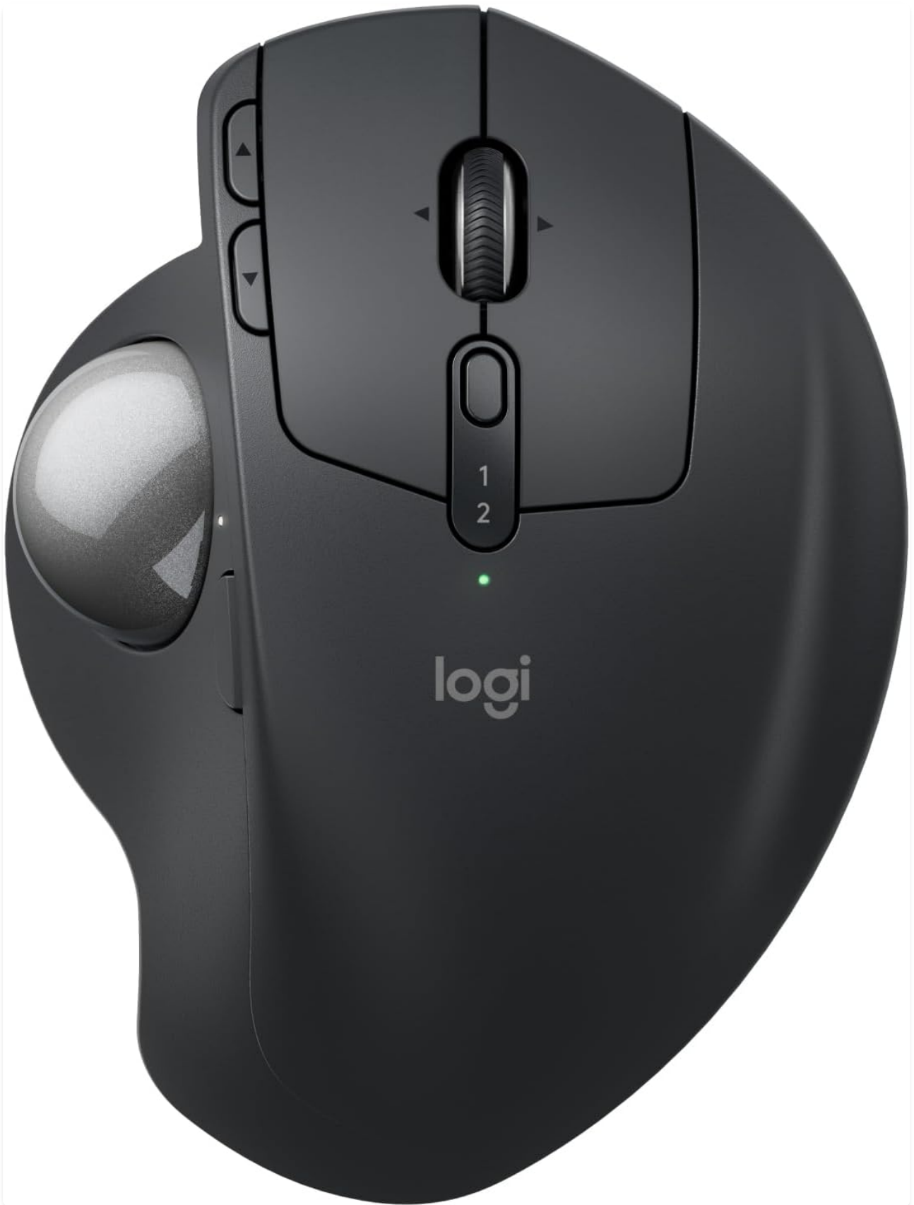
Figure 1: Logitech MX Ergo S Advanced Wireless Trackball Mouse (Graphite)