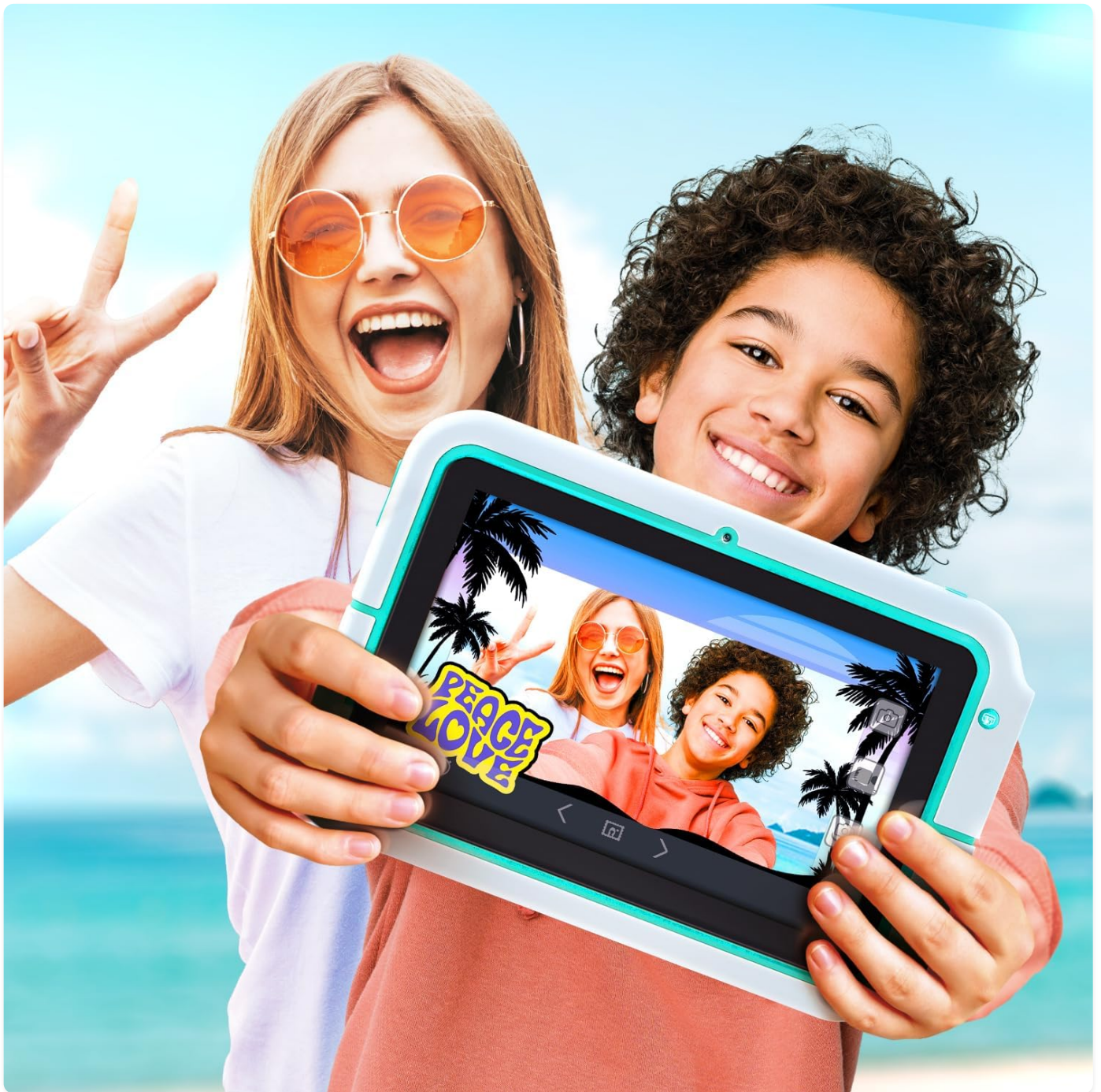
Image: Children using the tablet for photo capture.