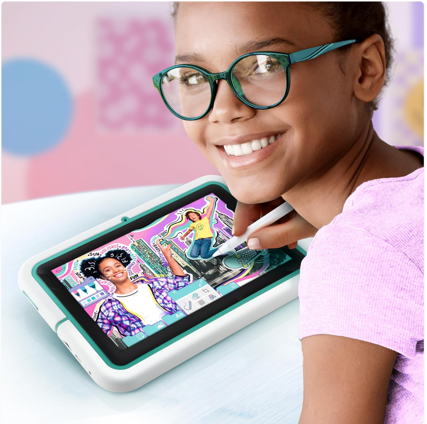
Image: Child using the stylus for drawing.