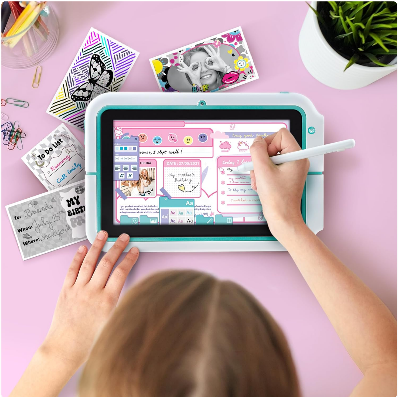
Image: Using the tablet for journaling.