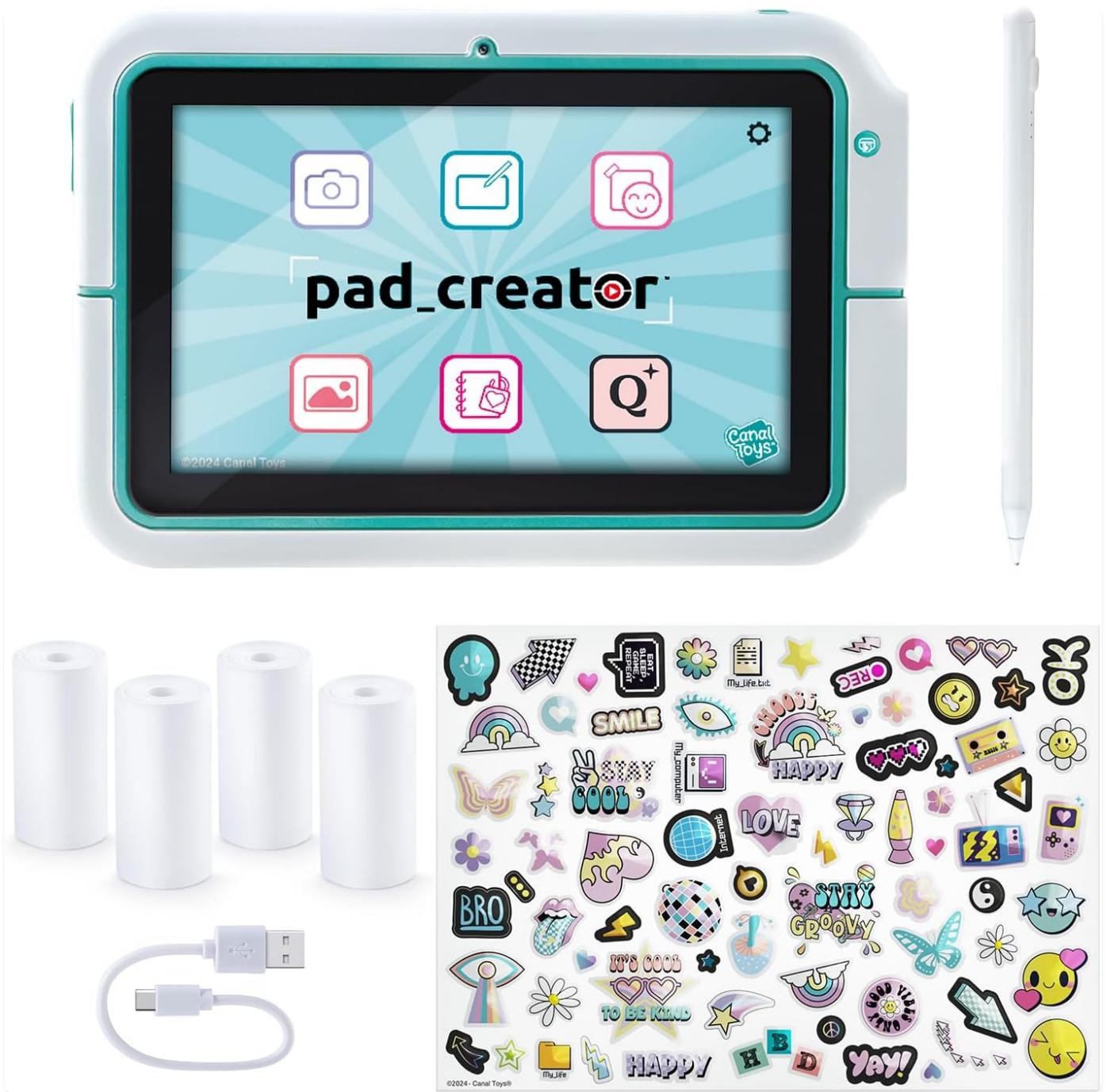
Image: Pad Creator tablet and included accessories.