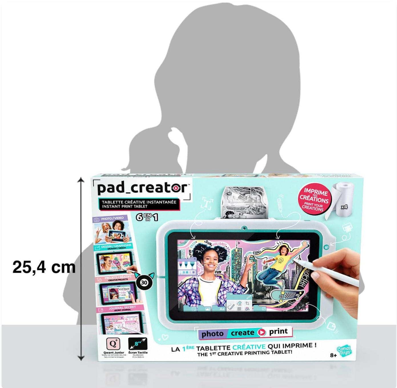
Image: Product packaging with dimensions.