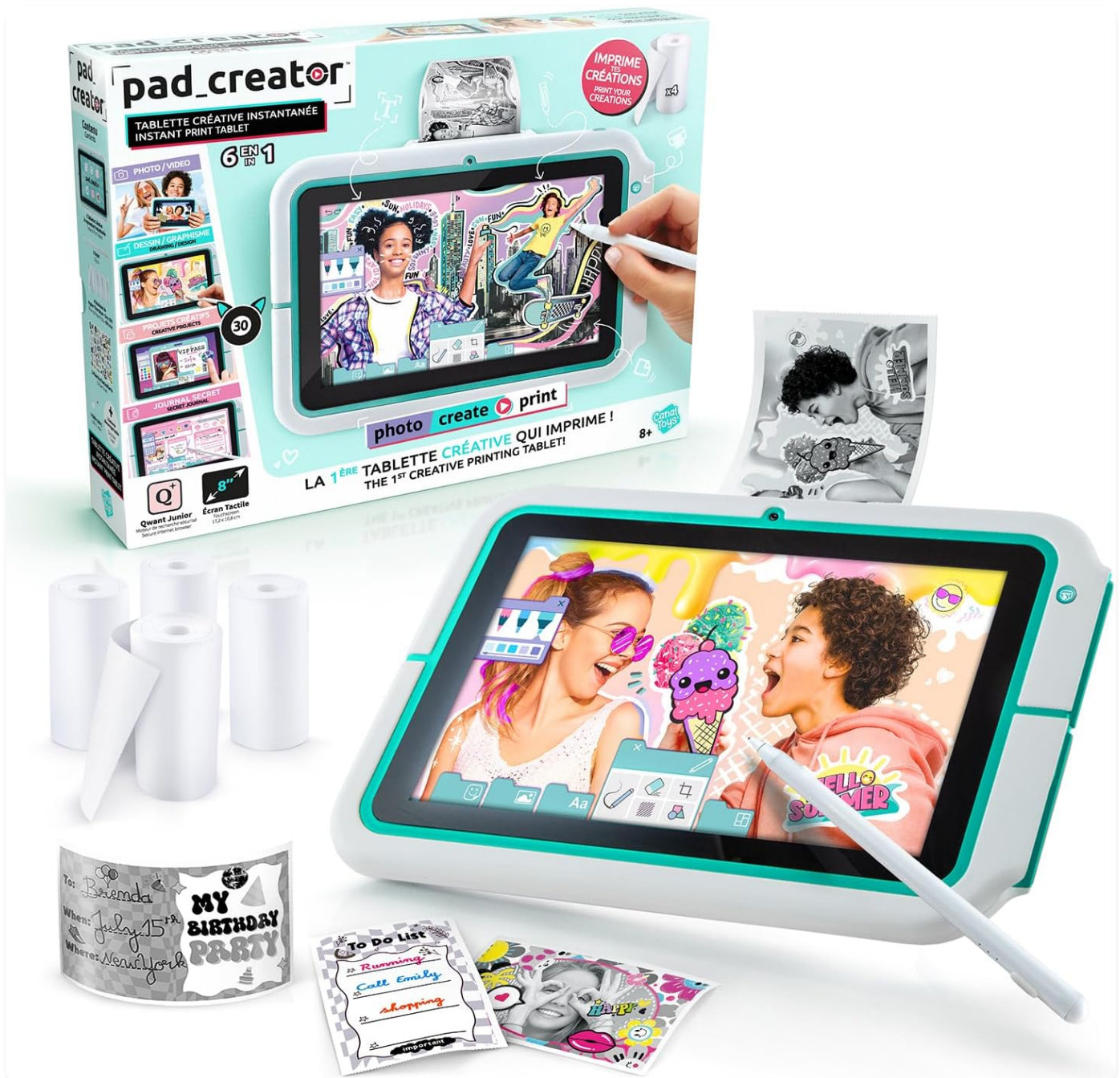
Image: Pad Creator showcasing instant print capability.