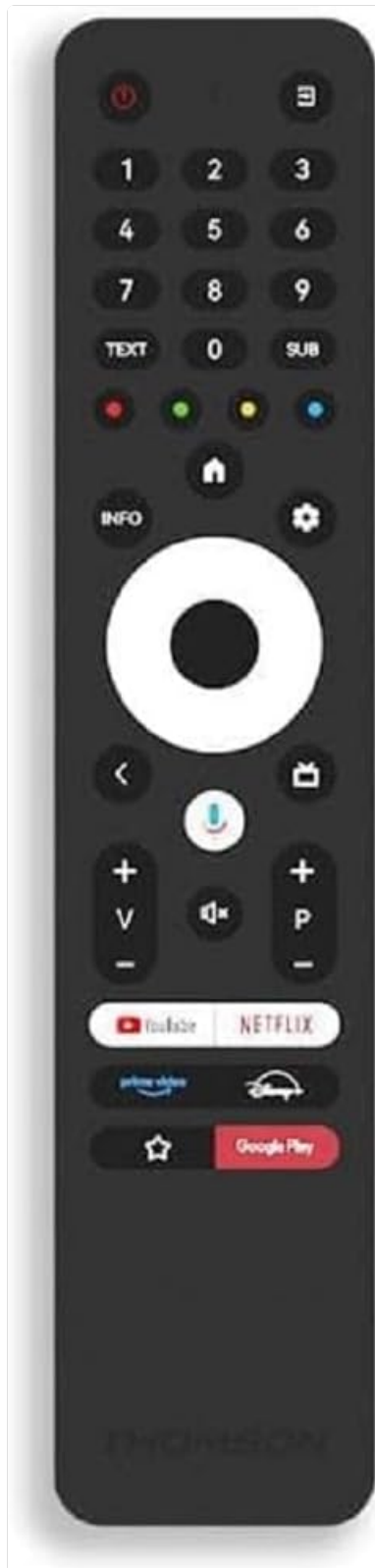
Image: Front view of the Thomson Android TV Remote Control, showcasing its sleek black design and button layout.