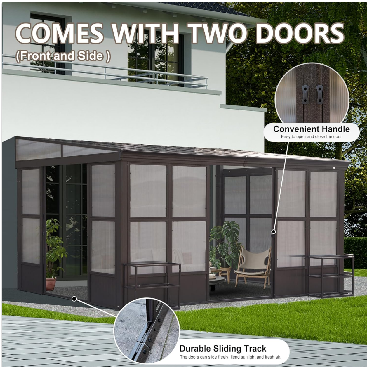
Image 3.1: The sunroom featuring two sliding doors for flexible entry and exit.

Your browser does not support the video tag.