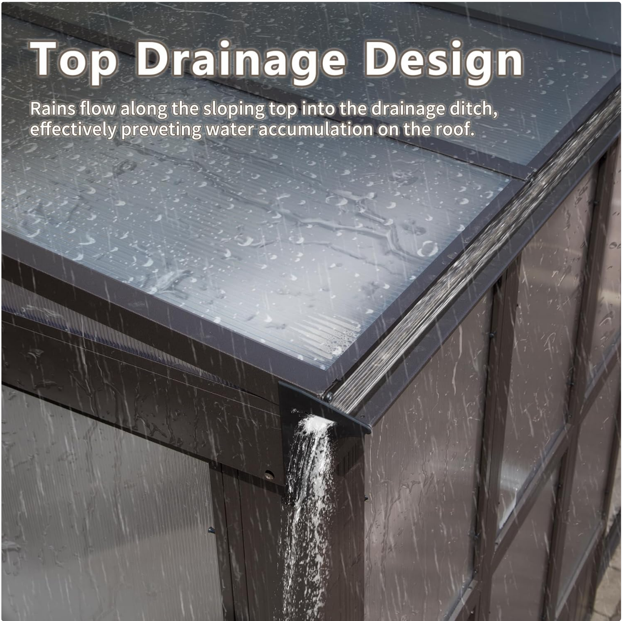
Image 2.3: The top drainage design, showing rainwater flowing into the gutter.

Rains flow along the sloping top into the drainage ditch, effectively preventing water accumulation on the roof.