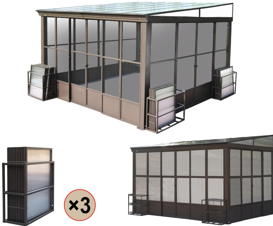
Image 3.4: Three aluminum storage organizers designed to hold removed polycarbonate screens.

Three aluminum storage organizers make your outdoor space clean and orderly