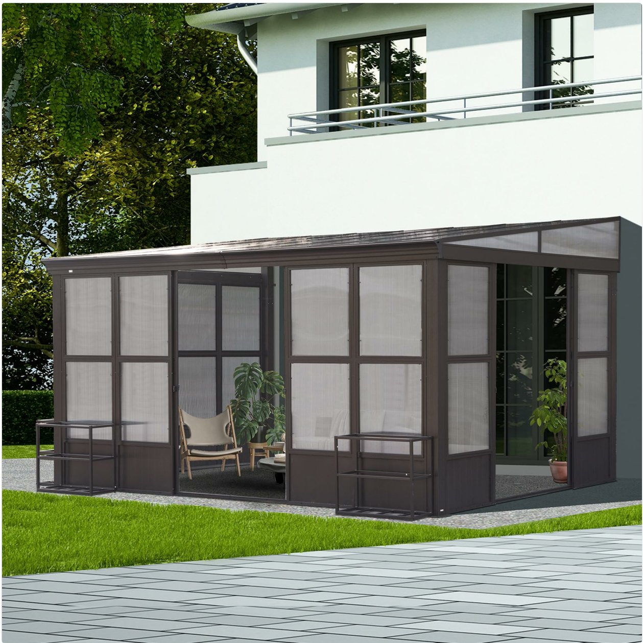
Image 1.1: The Domi Lean-to Sunroom 10x12FT, showcasing its wall-mounted design and overall structure.