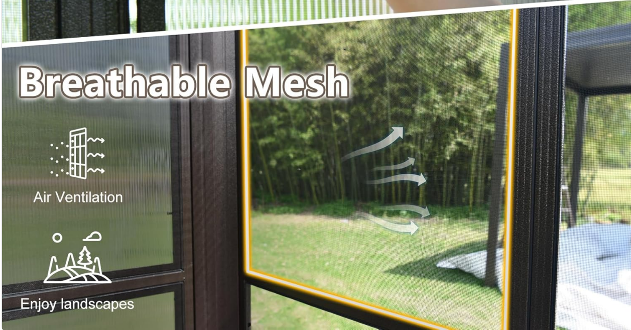
Image 3.2: Demonstrates the detachable polycarbonate screen and the breathable mesh screen for ventilation.