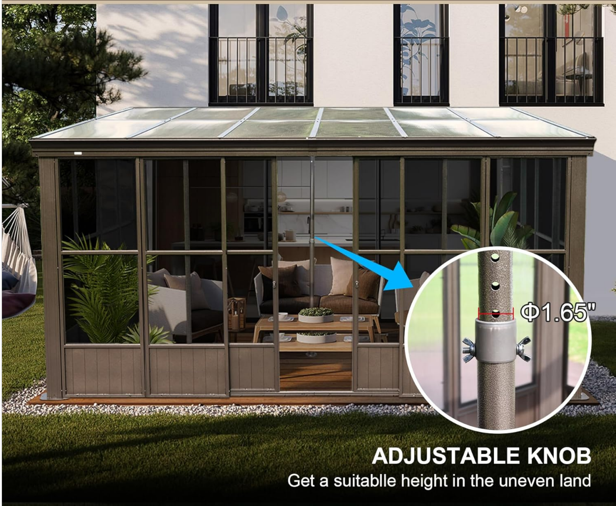
Image 2.2: The detachable metal support pole with an adjustable knob for uneven surfaces.

Offer additional stability when facing rain and snow