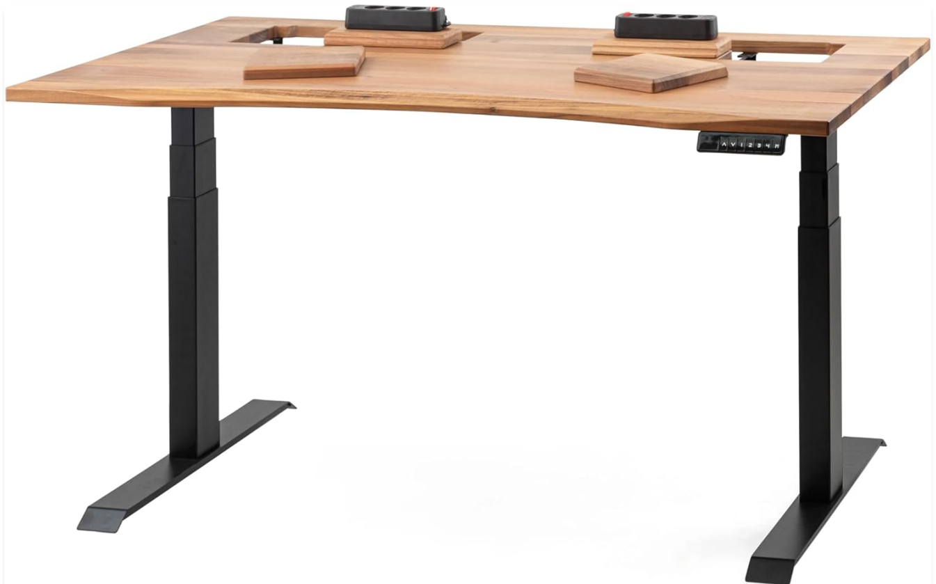
Image 1.1: The ErgoHide® Height-Adjustable Desk, showcasing its solid walnut top and sturdy black adjustable legs. Note the

Customize your desk with various additional options like a PC stand, LED lamp, cup holder, or monitor arm, all manufactured in our workshop.