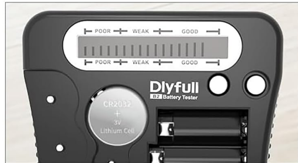
Test the Button Cell