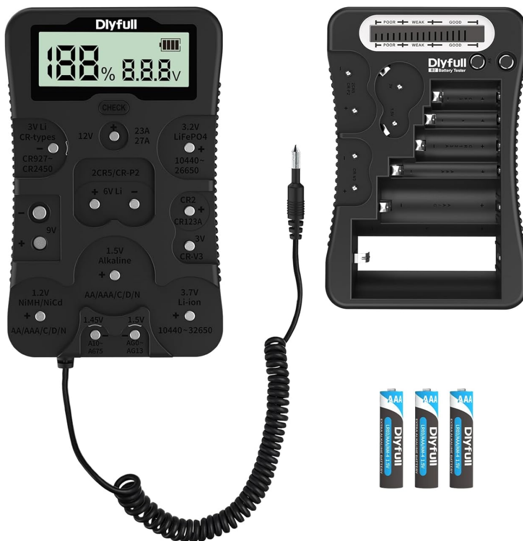
Image: Dlyfull B2 Black and B4 Universal Battery Testers shown with included AAA batteries.