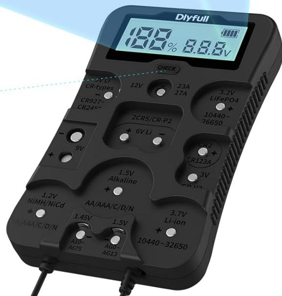
Image: The Dlyfull B4 tester's smart LCD display and the battery compartment for AAA batteries.

CHECK: Press and hold for about 3 seconds to check the battery level on the back, so you can replace the battery in time.