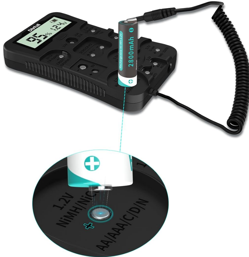
Image: The Dlyfull B4 tester highlighting its polarity guidance indicators for correct battery insertion.

Universal battery tester is equipped with polarity markings to ensure easy and accurate insertion of batteries, enhancing testing accuracy and safety.