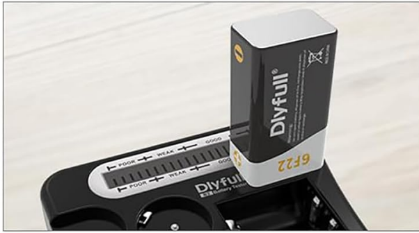
Test 9v Battery