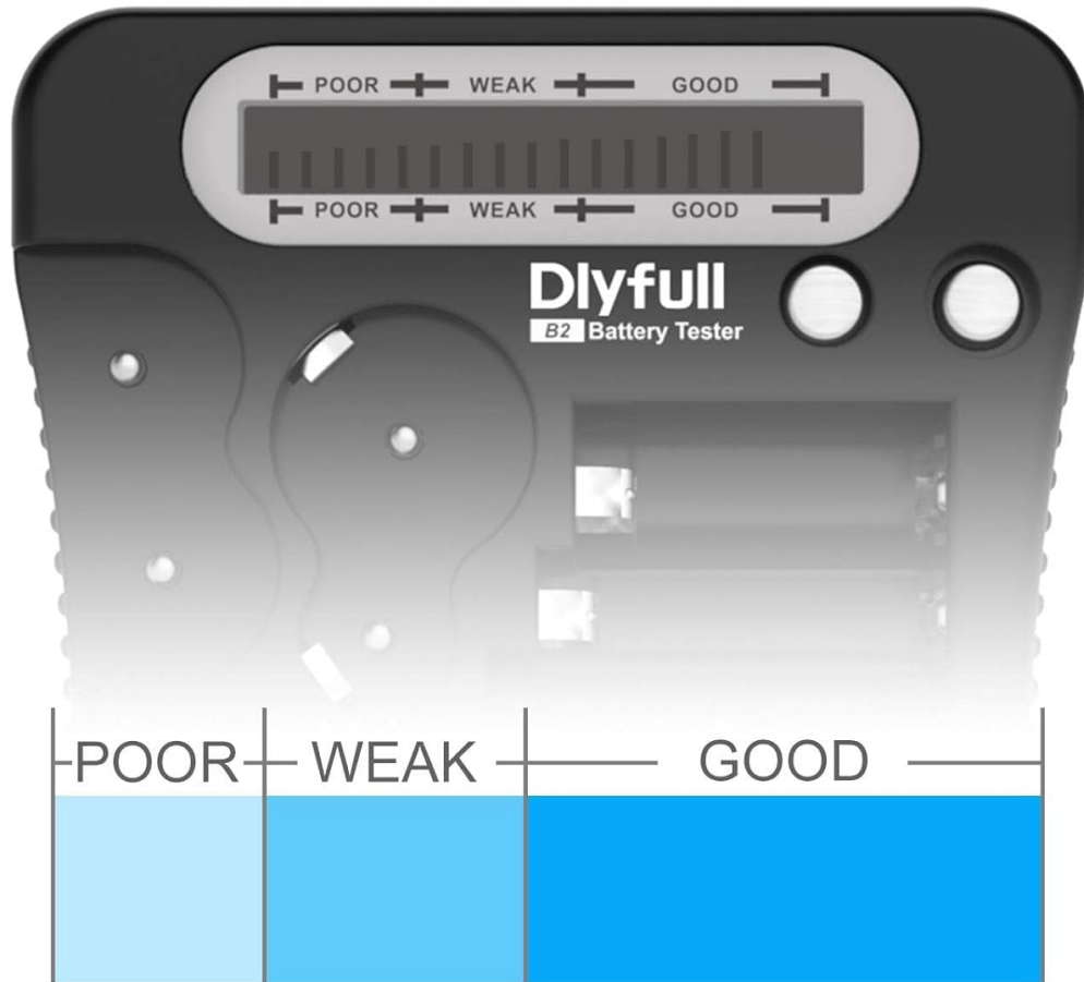
Image: The Dlyfull B2 tester's easy-to-read LCD screen, displaying battery health categories: Poor, Weak, and Good.

Clearly shows what you need to know about your batteries' health