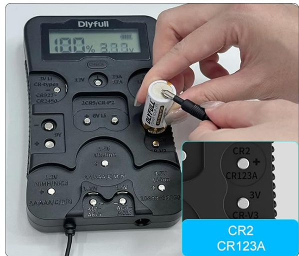
Image: Demonstrations of testing various battery types using the Diyfull B4 tester, including cylindrical, 9V, and button cell batteries.