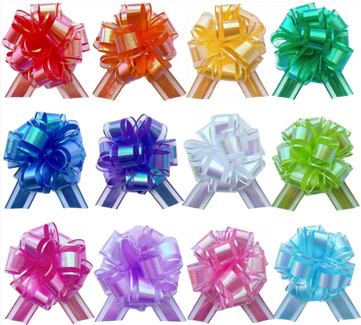
Image 1.1: A collection of 12 pull bows in various rainbow colors, showcasing their vibrant appearance and ready-to-use form.