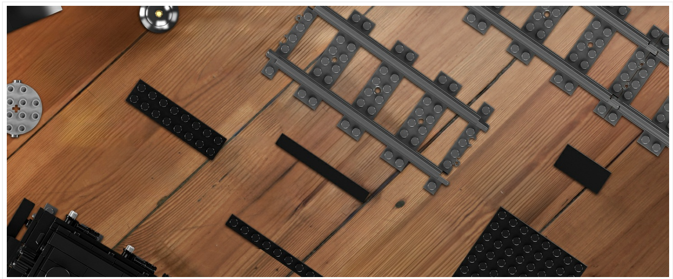
Image: The locomotive operating on tracks, controlled via the mobile application.