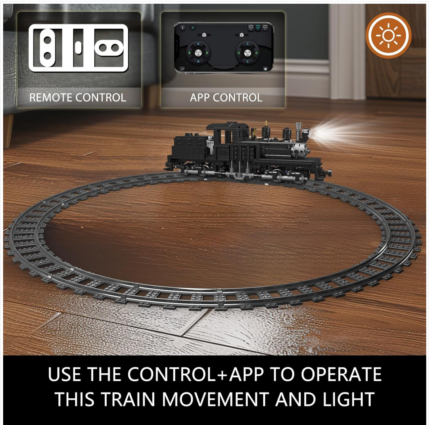
Image: Two control methods: a physical remote and a smartphone app interface.