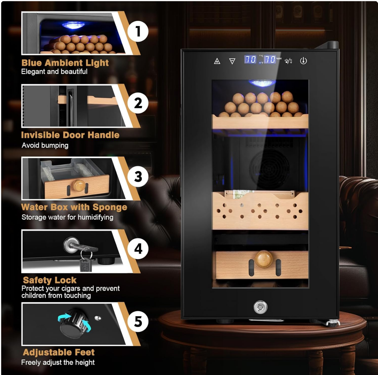
Figure 5: Key features including the safety lock and water box.

The humidor is equipped with a secure lock to protect your cigar collection. A built-in water box with a sponge facilitates easy humidification.