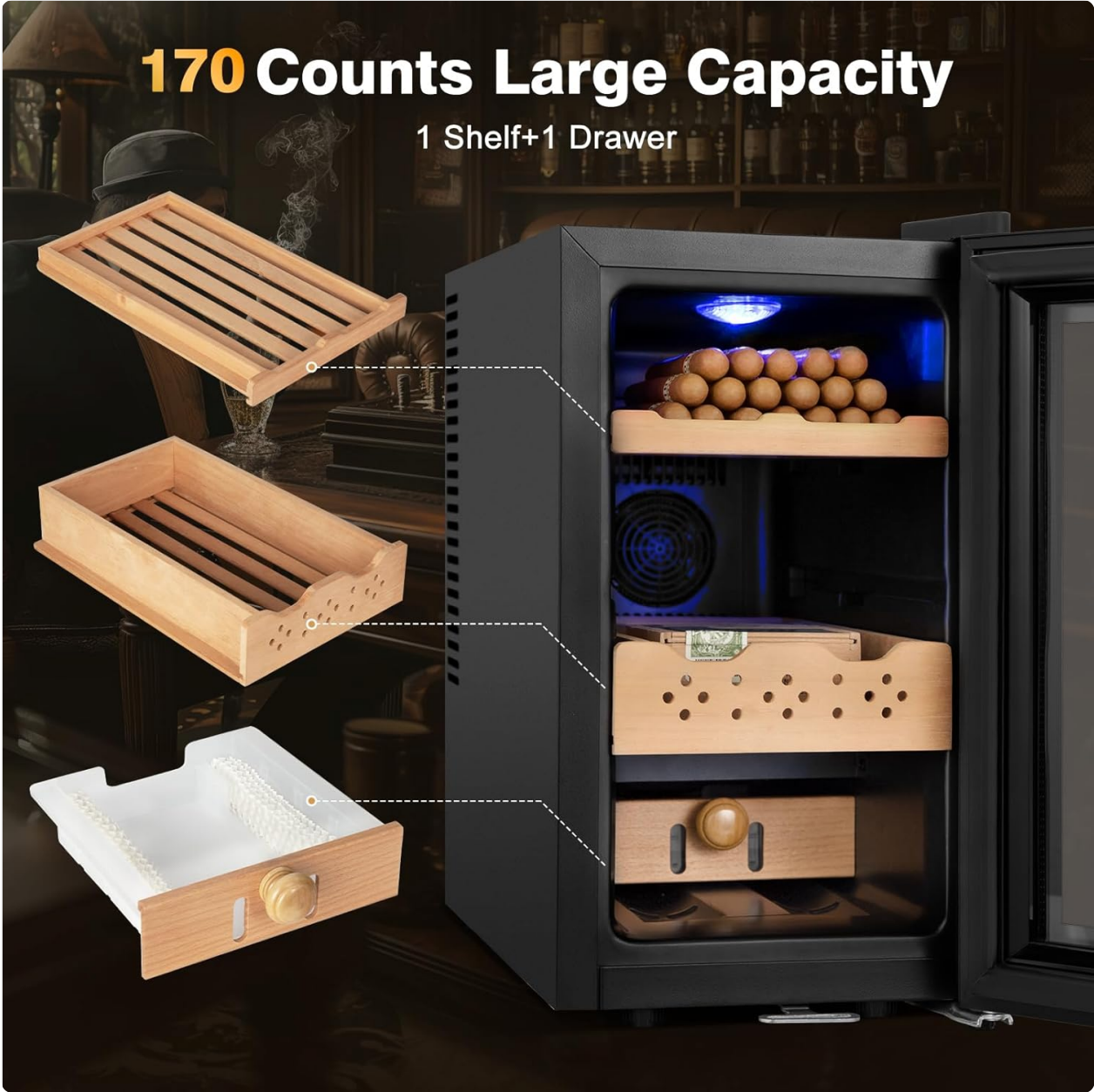
Figure 7: Internal layout with shelf and drawer, demonstrating capacity.