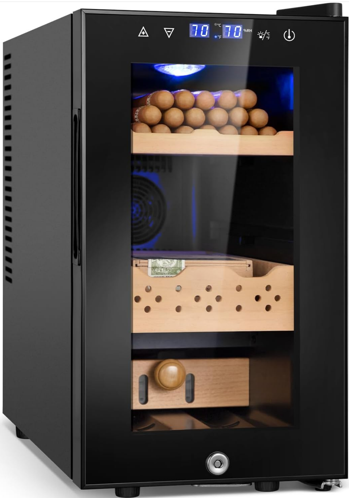
Figure 1: Front view of the FoMup Electric Cigar Humidor Cabinet.