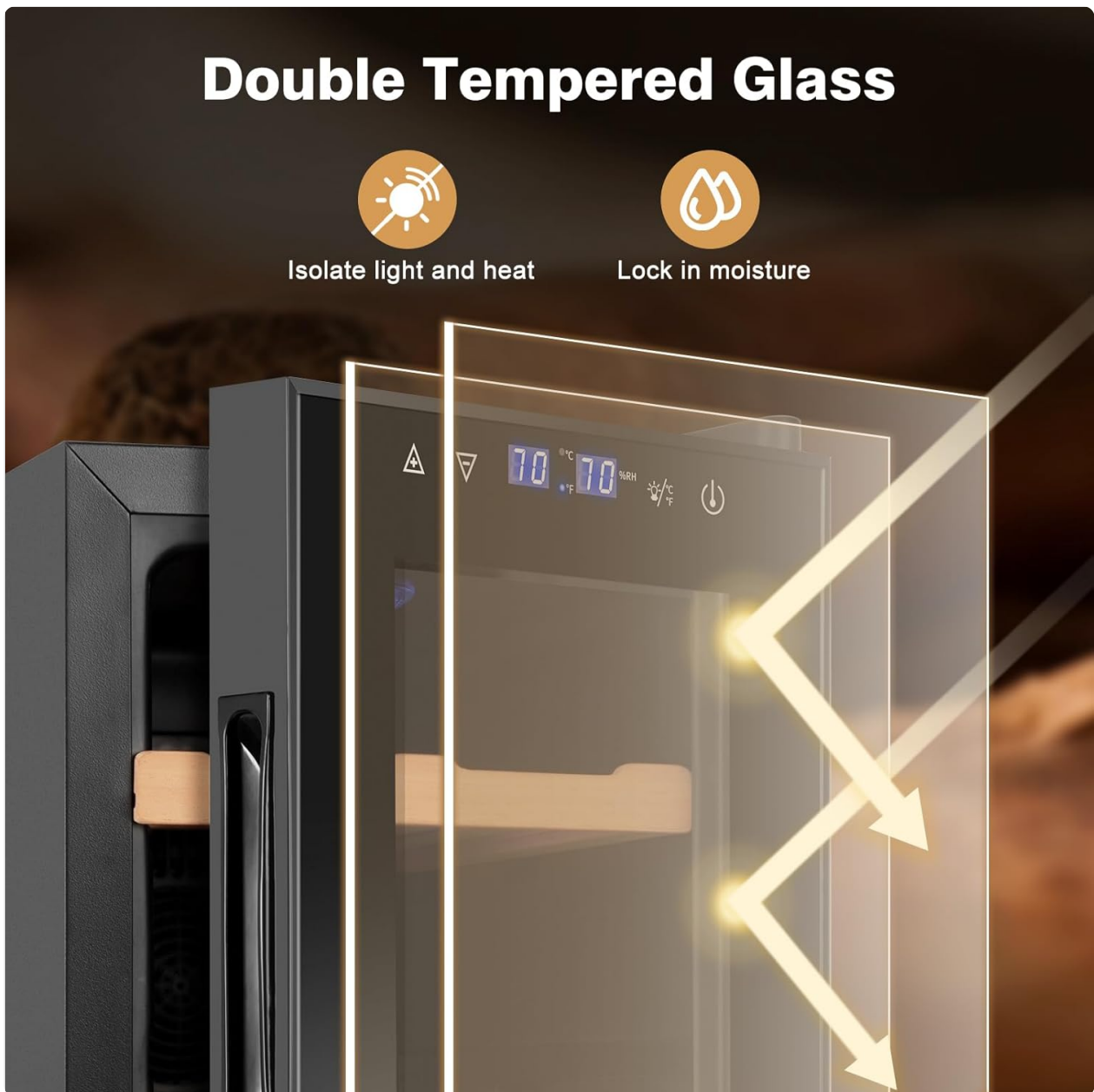
Figure 6: Double-layer tempered glass for insulation and moisture retention.

The door features double-layer tempered glass, providing excellent insulation to maintain stable internal conditions while allowing visibility of your cigars. The unit operates silently, ensuring a peaceful environment.