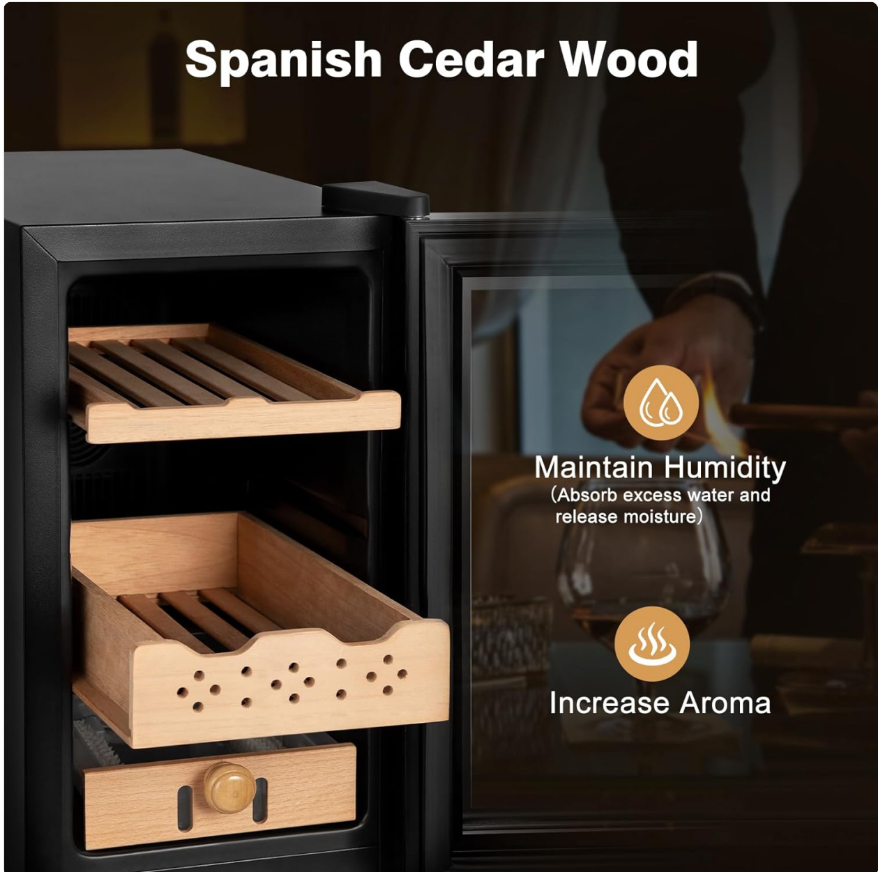
Figure 3: Spanish Cedar Wood interior, highlighting humidity regulation and aroma benefits.

The interior is fitted with high-quality Spanish cedar wood shelves and drawers. Spanish cedar is known for its ability to absorb excess moisture and release it when needed, helping to regulate humidity. It also imparts a pleasant aroma that enhances the cigar aging process.