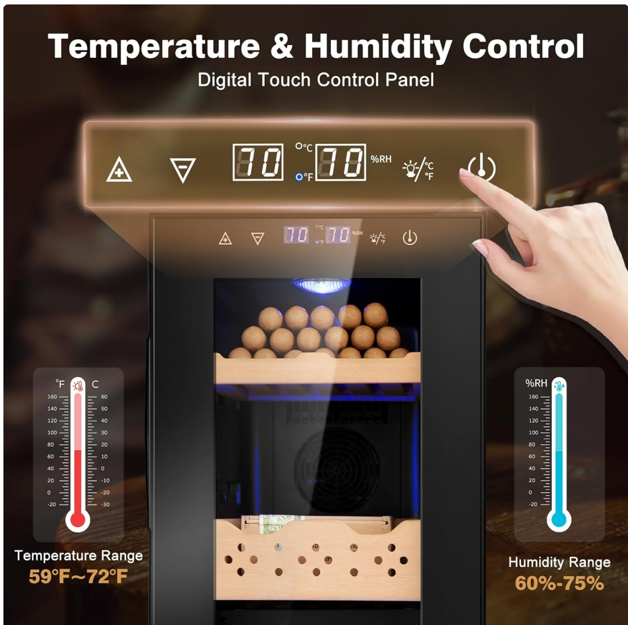
Figure 2: Digital Touch Control Panel for temperature and humidity settings.

The humidor features a digital touch control panel for precise management of internal temperature and humidity. The temperature can be adjusted between 59°F - 72°F (15°C - 22°C) and humidity between 60% - 75%.