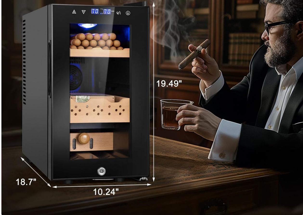
Figure 8: Compact size suitable for countertop placement, with dimensions.