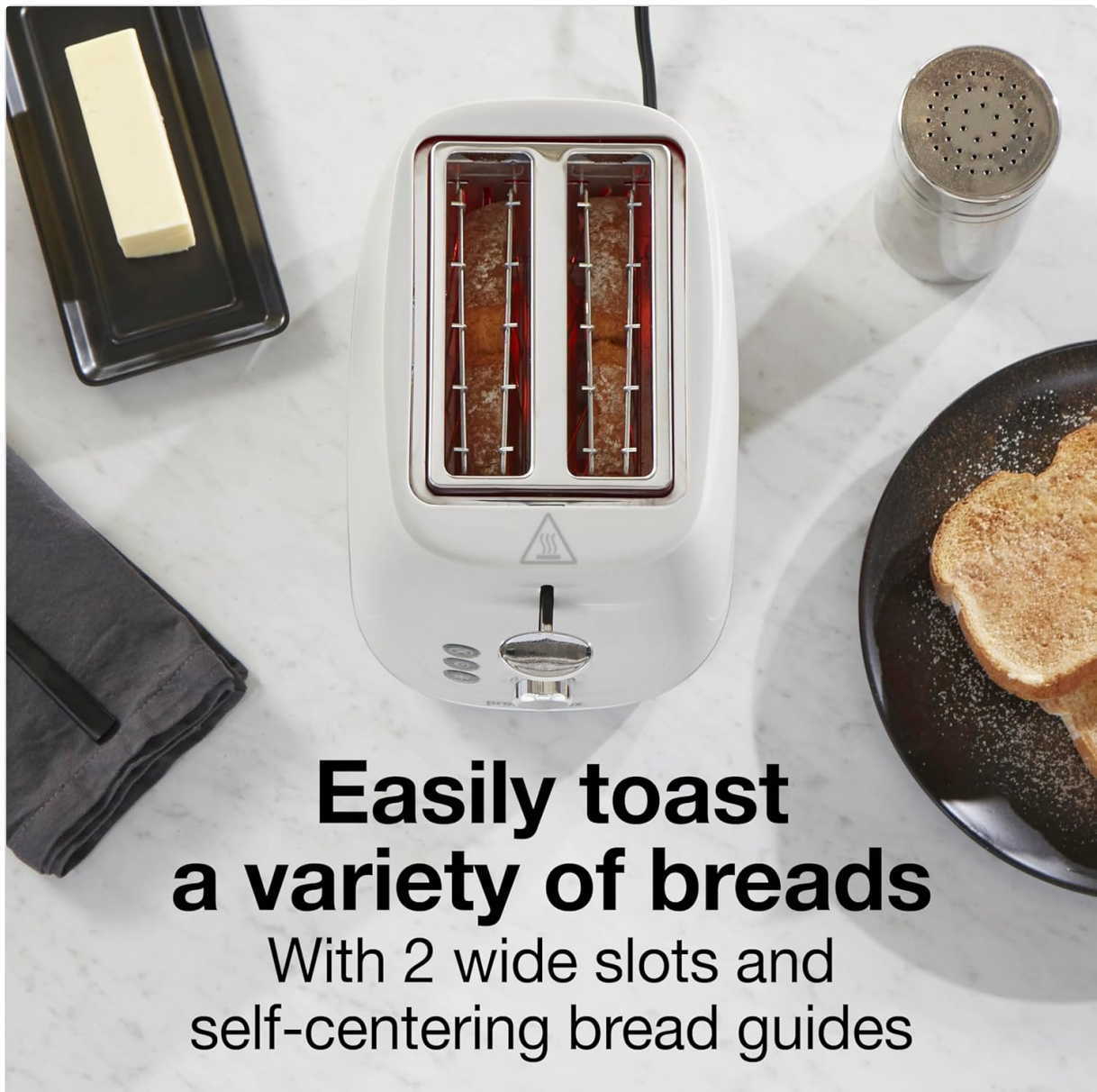
Image: Top-down view of the toaster with two slices of bread in the wide slots, illustrating the self-centering bread guides.