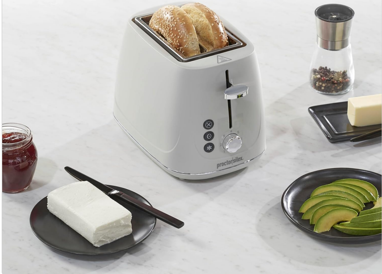
Image: The toaster with two bagel halves inserted into the wide slots, ready for the bagel function.