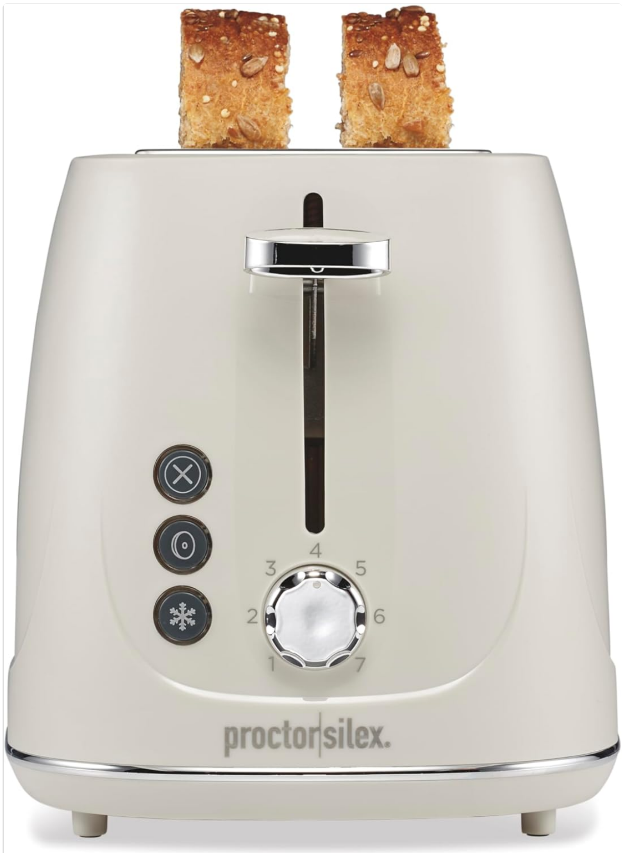
Image: Proctor Silex 2-Slice Toaster in Oat White, showing its compact design and control panel.