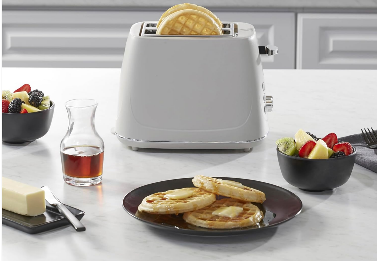
Image: The toaster with two frozen waffles in the slots, demonstrating the defrost function.

For optimal cook time when toasting frozen bread or waffles