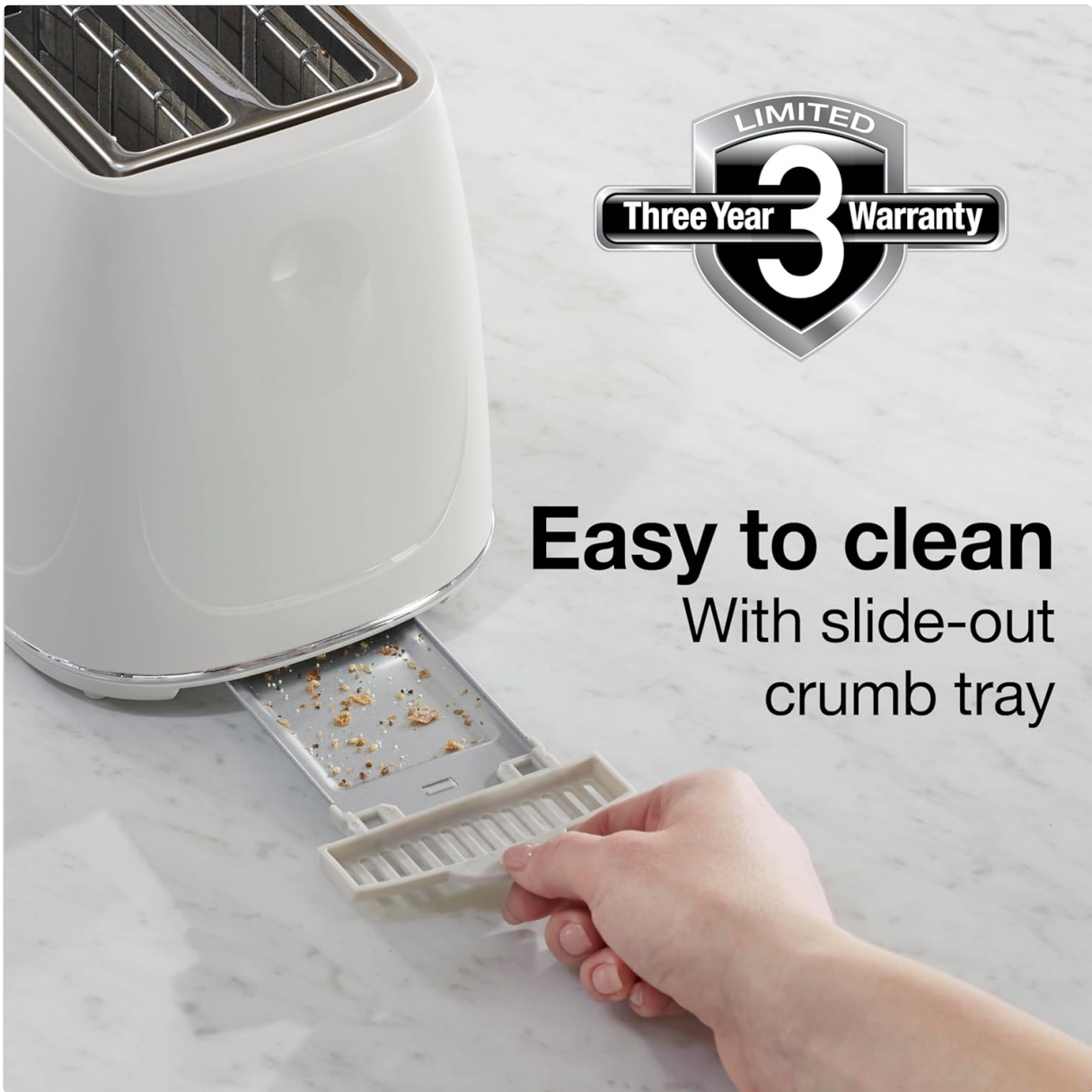
Image: A hand removing the slide-out crumb tray from the bottom of the toaster for cleaning.