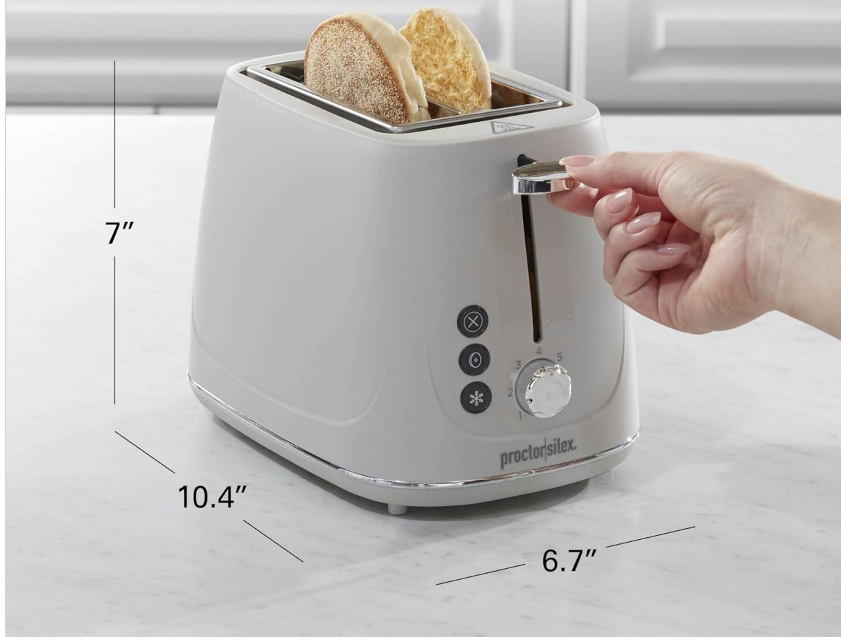
Image: A hand demonstrating the Toast Boost feature by lifting the toast lever to raise English muffins from the slots.