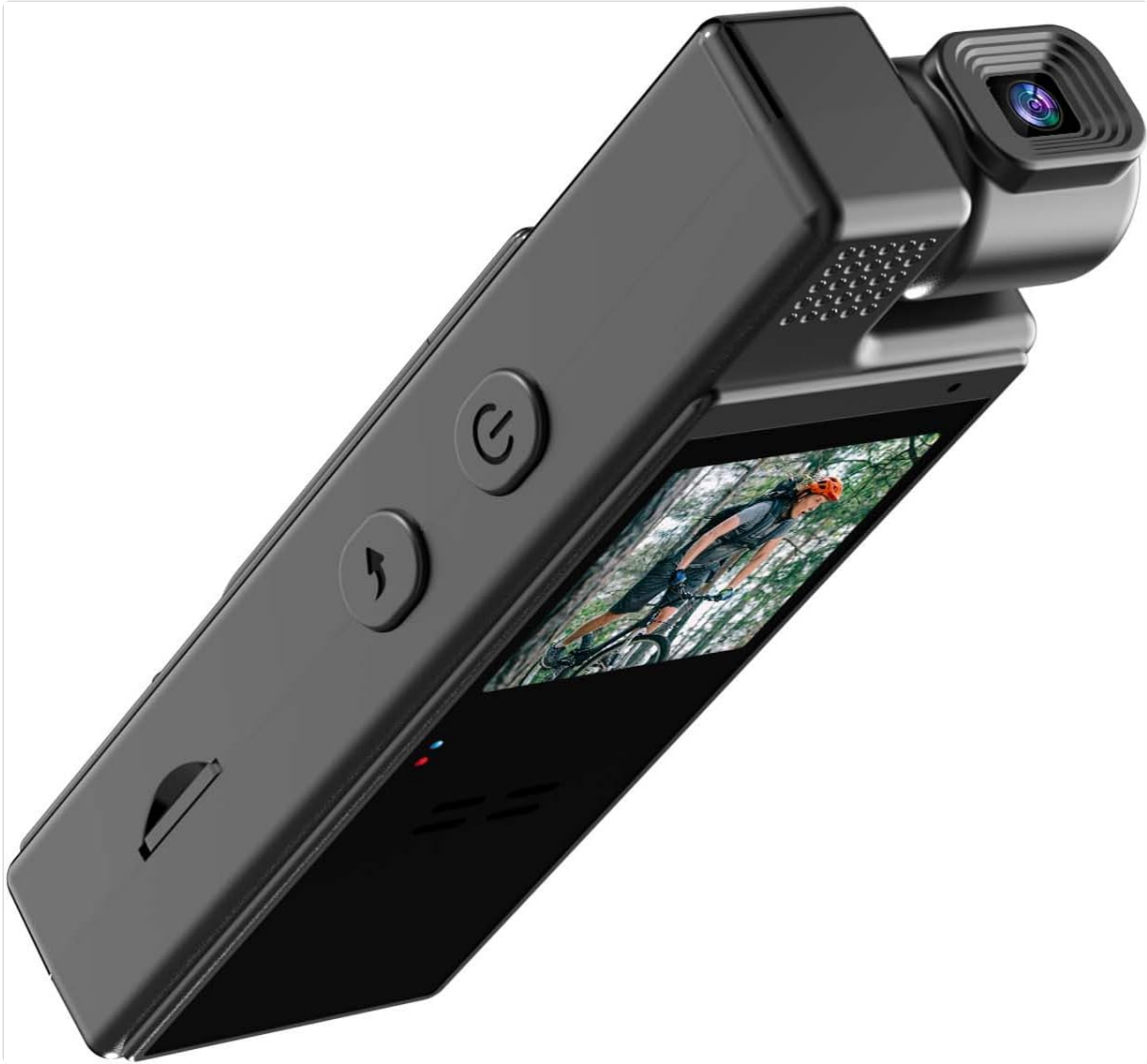
Figure 1: Front view of the L9 Mini Camera, showcasing its compact design, 1.3-inch screen, and rotatable lens. The screen displays a live feed of a cyclist.

Familiarize yourself with the various parts of your L9 Mini Camera: