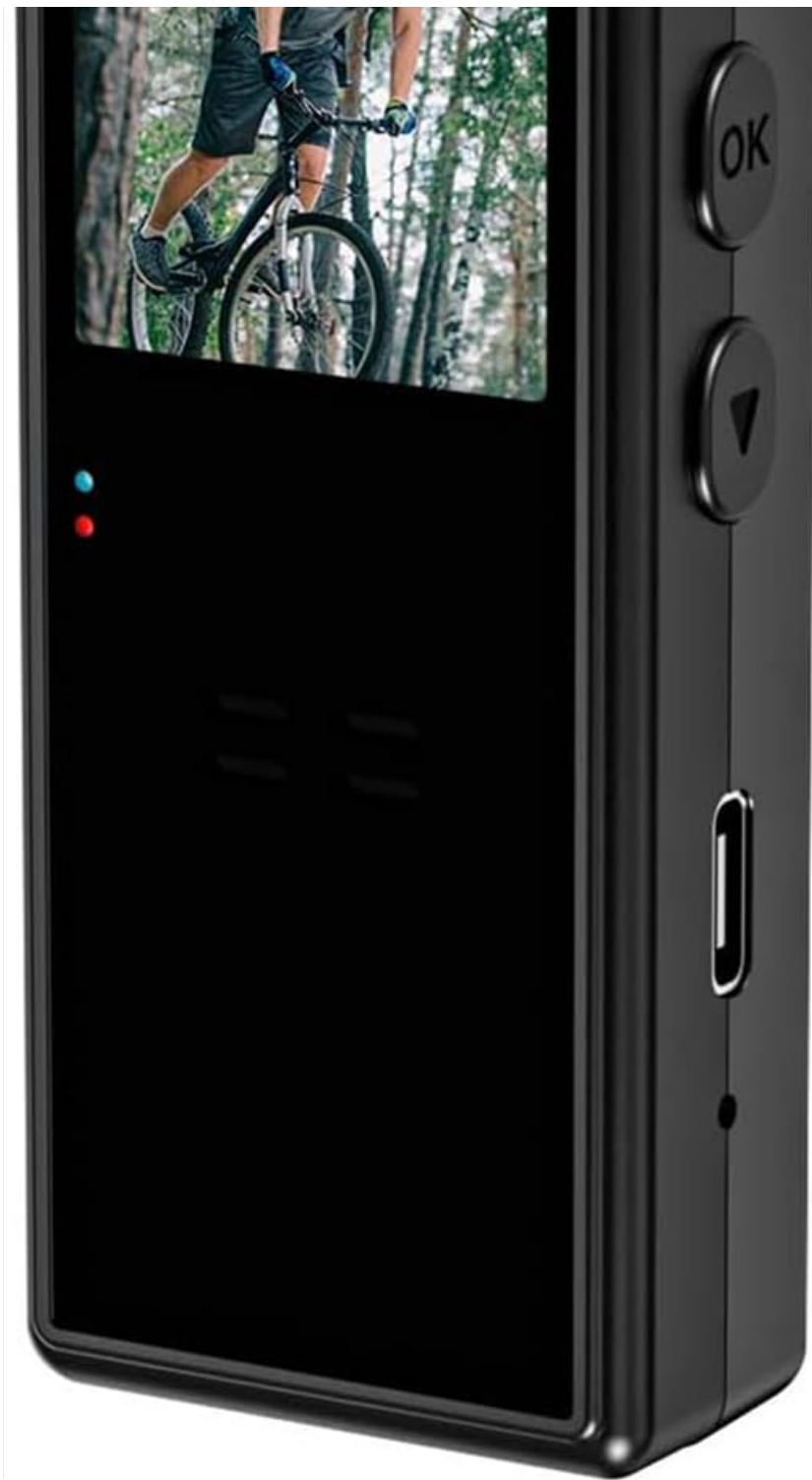
Figure 3: A detailed view of the L9 Mini Camera's screen and the control buttons located on its side. The screen shows a live recording, and the buttons are clearly visible for operation.