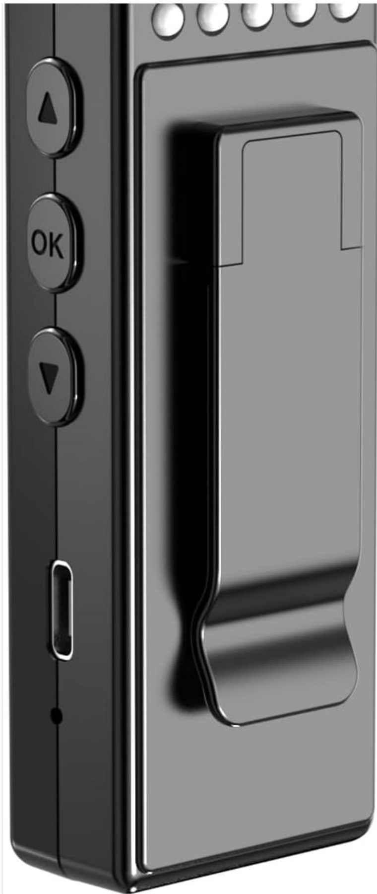
Figure 4: Rear view of the L9 Mini Camera, highlighting the integrated back clip mechanism. This clip allows for secure attachment to clothing or gear.