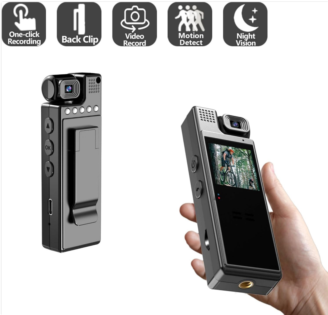
Figure 2: Illustrates key features of the L9 Mini Camera, including one-click recording, the detachable back clip, video recording capability, motion detection, and night vision functionality.