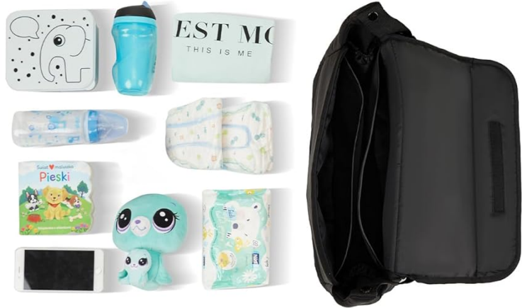
SAC SPACIEUX POUR LES PARENTS