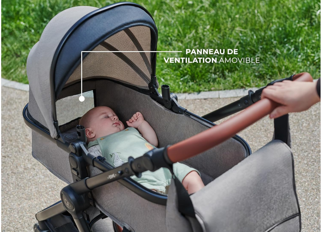
Image: The bassinets features a removable ventilation panel for comfort in warm weather.

CONFORTABLE DÈS LA PREMIÈRE PROMENADE ET MÊME PAR TEMPS CHAUD.