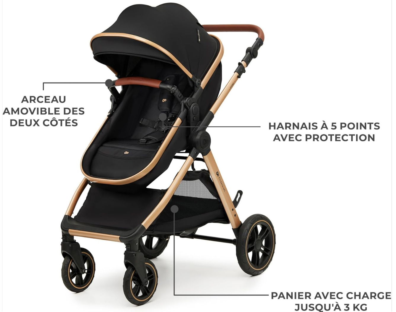
Image: The 5-point harness with protection and a removable bumper bar ensure child safety. The basket holds up to 3 kg.