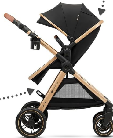
Image: The ESME stroller offers multiple configurations from birth to 4 years, including car seat, bassinet, and stroller modes.