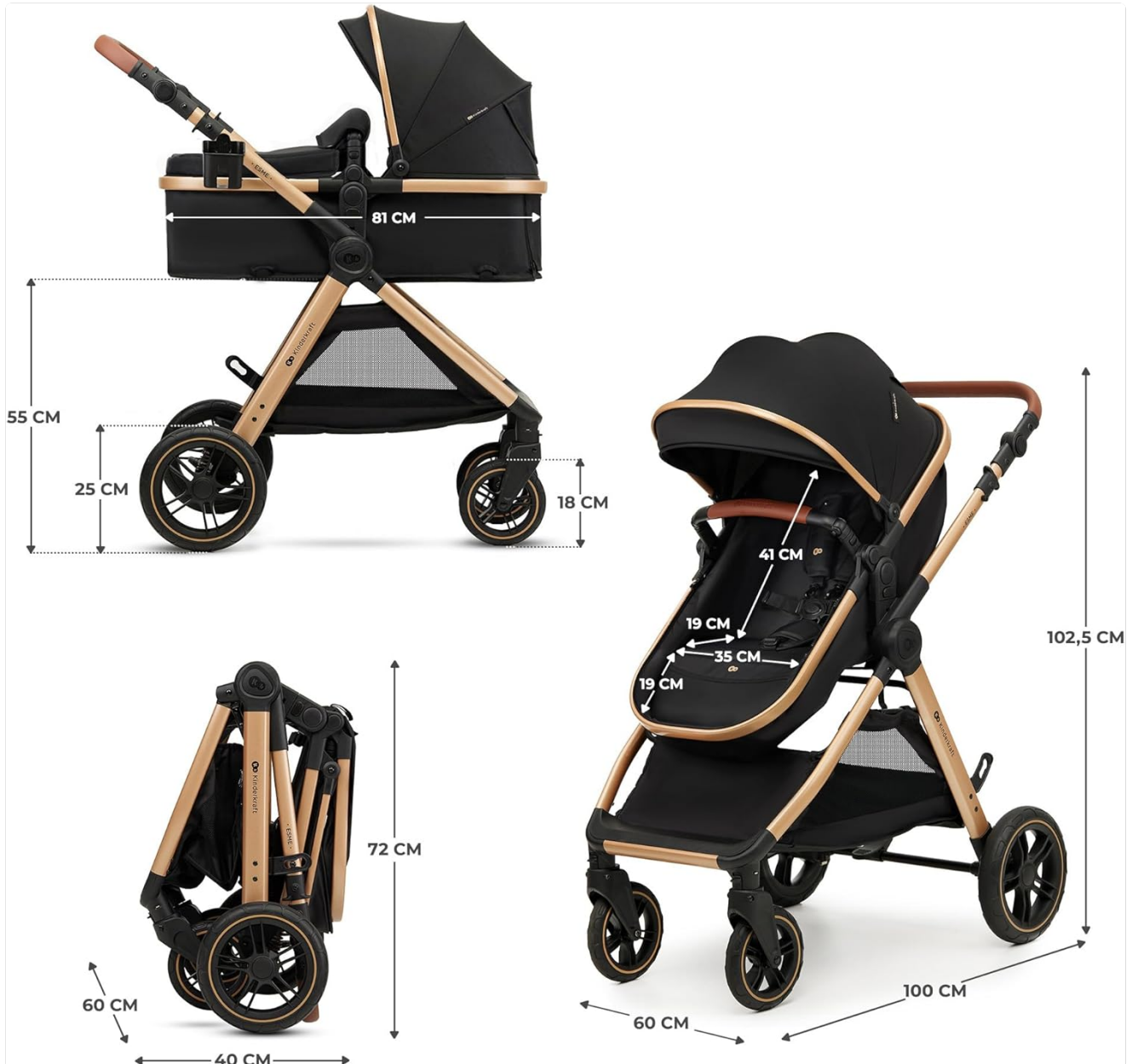
Image: Detailed dimensions of the ESME stroller in various configurations.