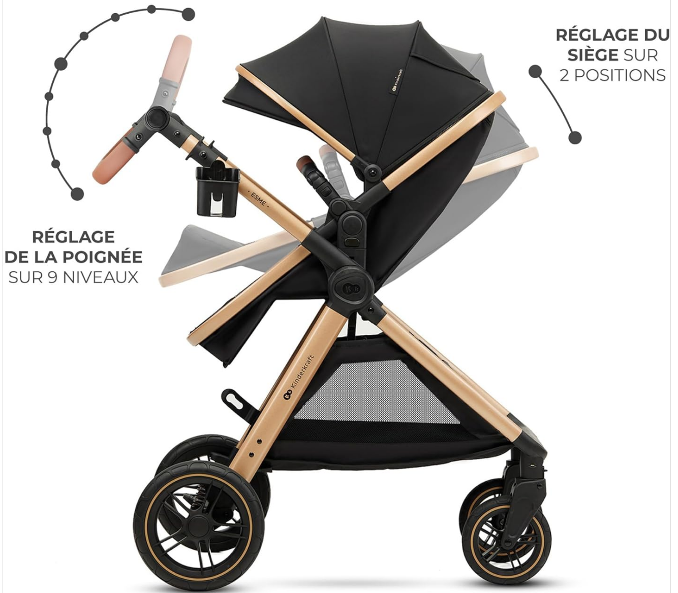
Image: The handlebar adjusts to 9 levels, and the seat has 2 recline positions.