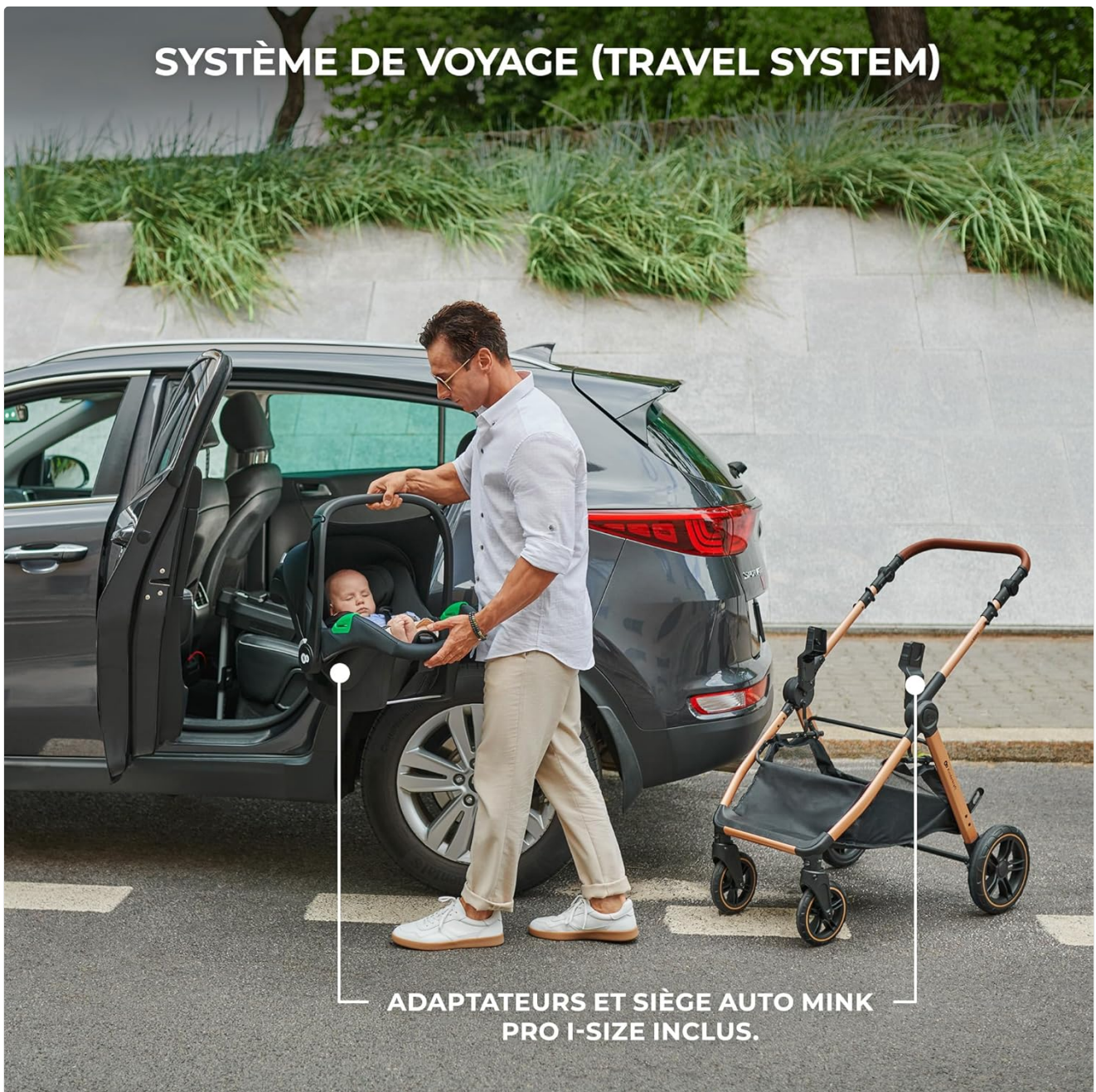
Image: The Travel System allows easy transfer of the MINK PRO i-Size car seat to the stroller frame using adapters.