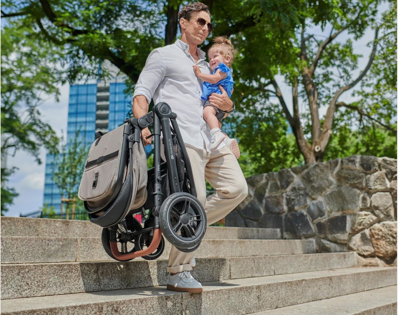
Image: The ESME stroller folds easily for light and convenient transport, even while carrying a baby.