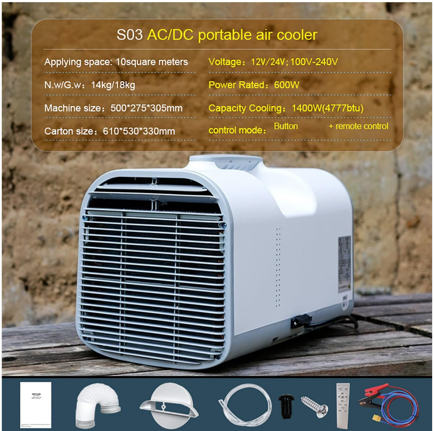
Figure 3.1: The S03 Pro Portable Air Conditioner unit with its various accessories, including the instruction manual, vent pipe, drain pipe, car clamp, adapter, screw, drain plug, and remote control.