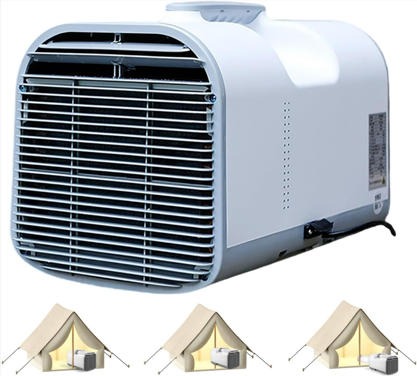
Figure 4.1: Front view of the S03 Pro Portable Air Conditioner, showing the main air intake/output grille.