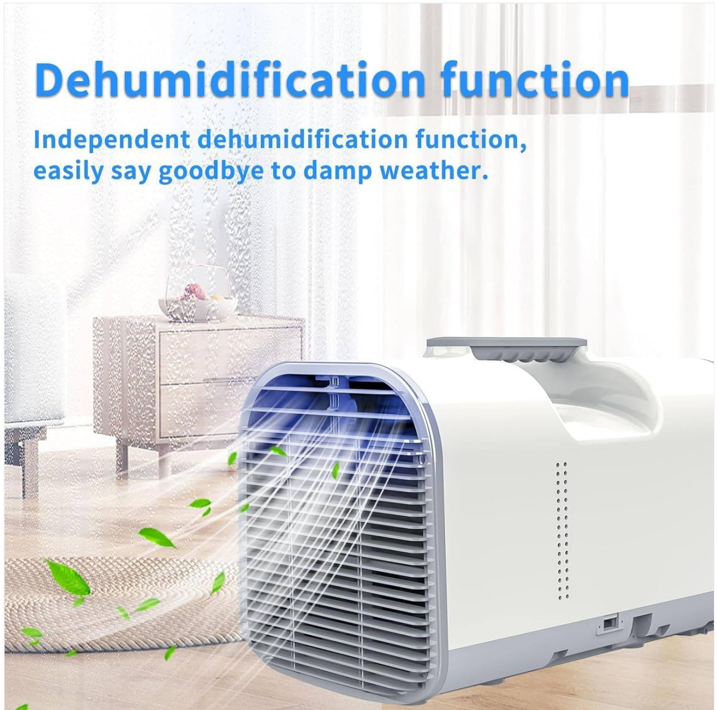
Figure 6.1: The S03 Pro Portable Air Conditioner unit and its remote control, highlighting the various operational modes.