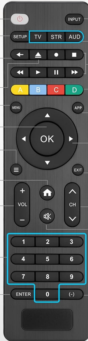
Image: Detailed layout of remote buttons and their corresponding functions.

(-) Dash - Use to select digital channels, e.g., 4.1