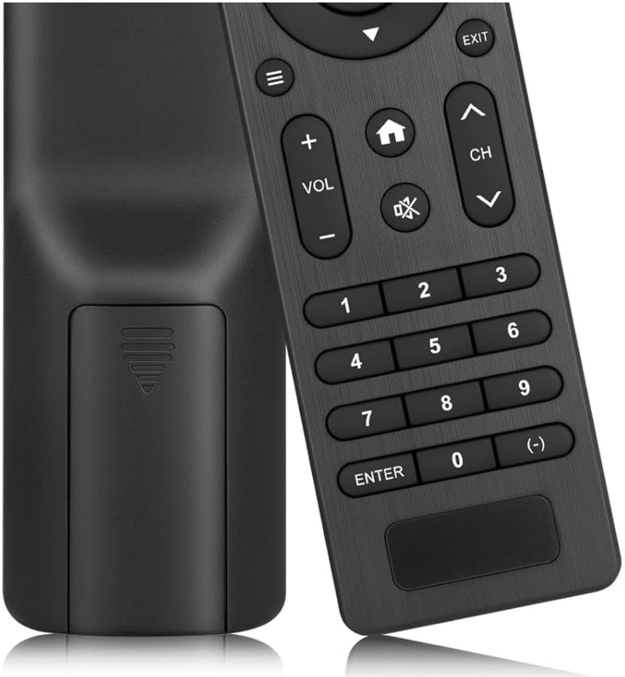
Image: Front and back view of the Acoyer Universal TV Remote Control.