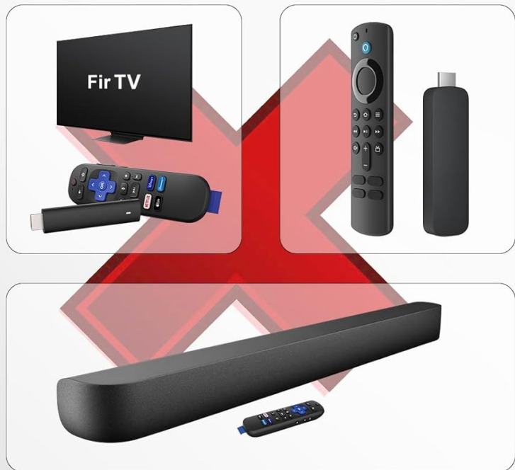
Image: Visual representation of devices not compatible with the remote.