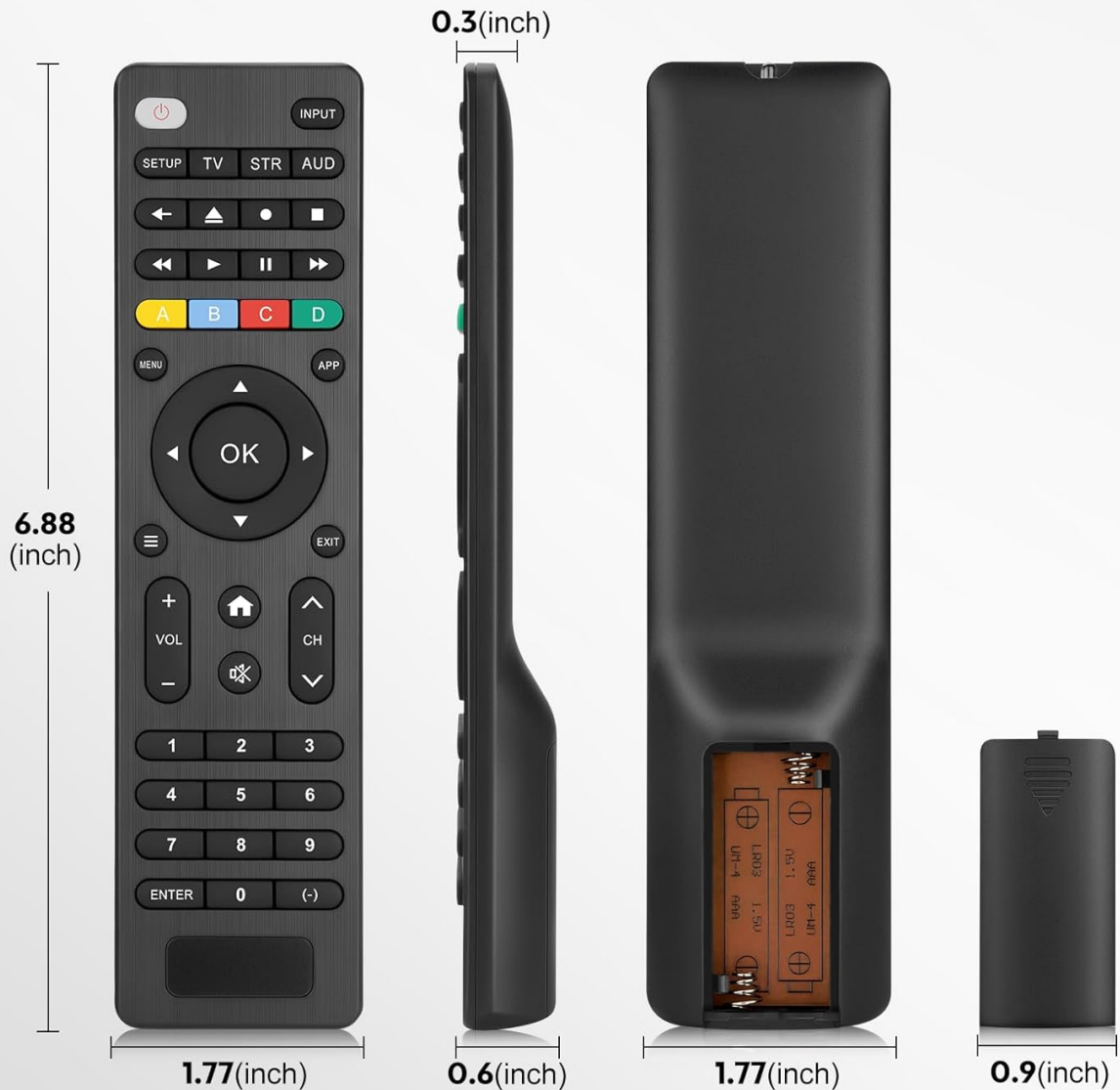
Image: Battery compartment and remote dimensions.