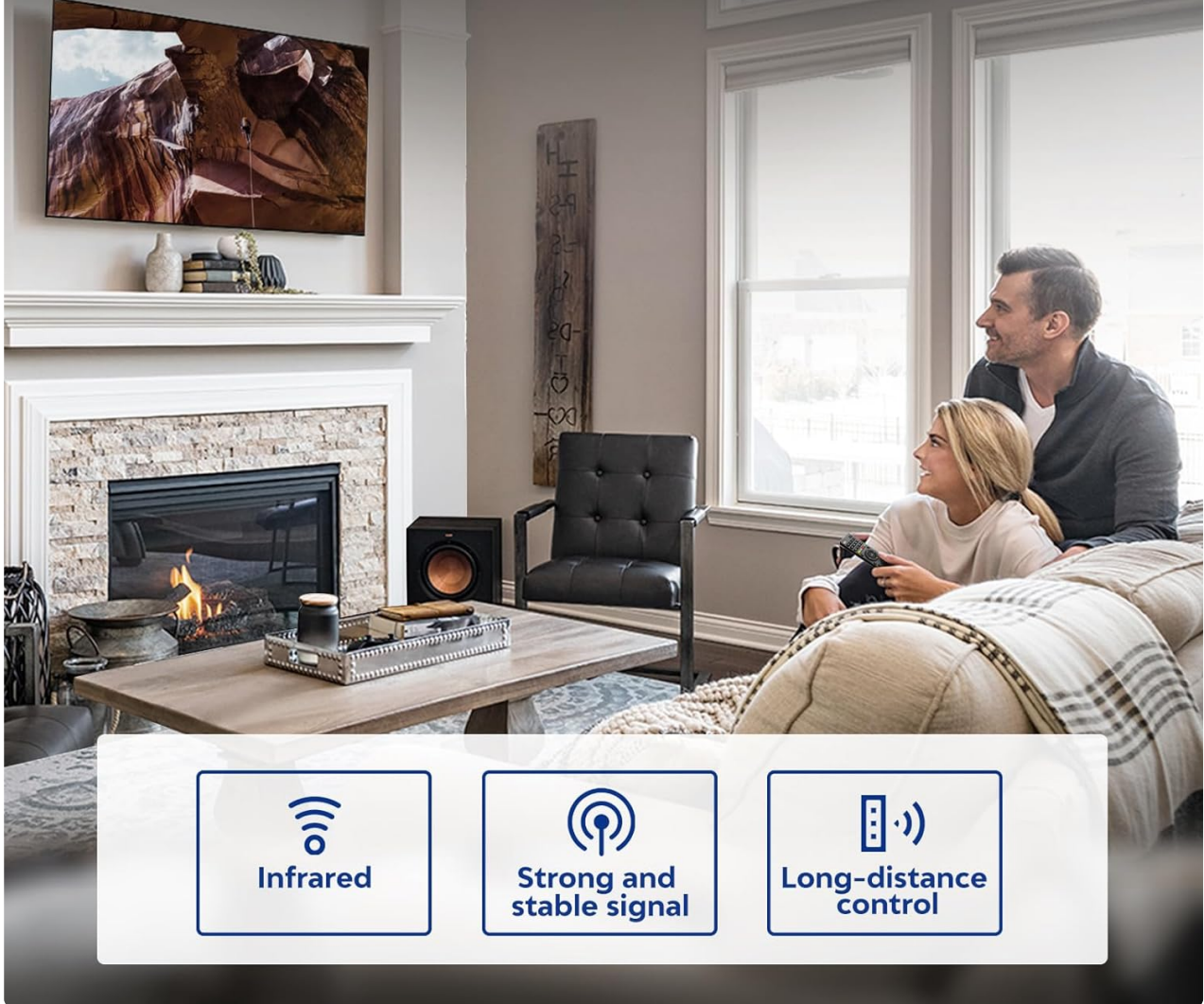
Image: Features of the remote's infrared technology.

Universal remote control adopts infrared technology, the response time is 0.2 seconds, and the longest distance is 30 feet.