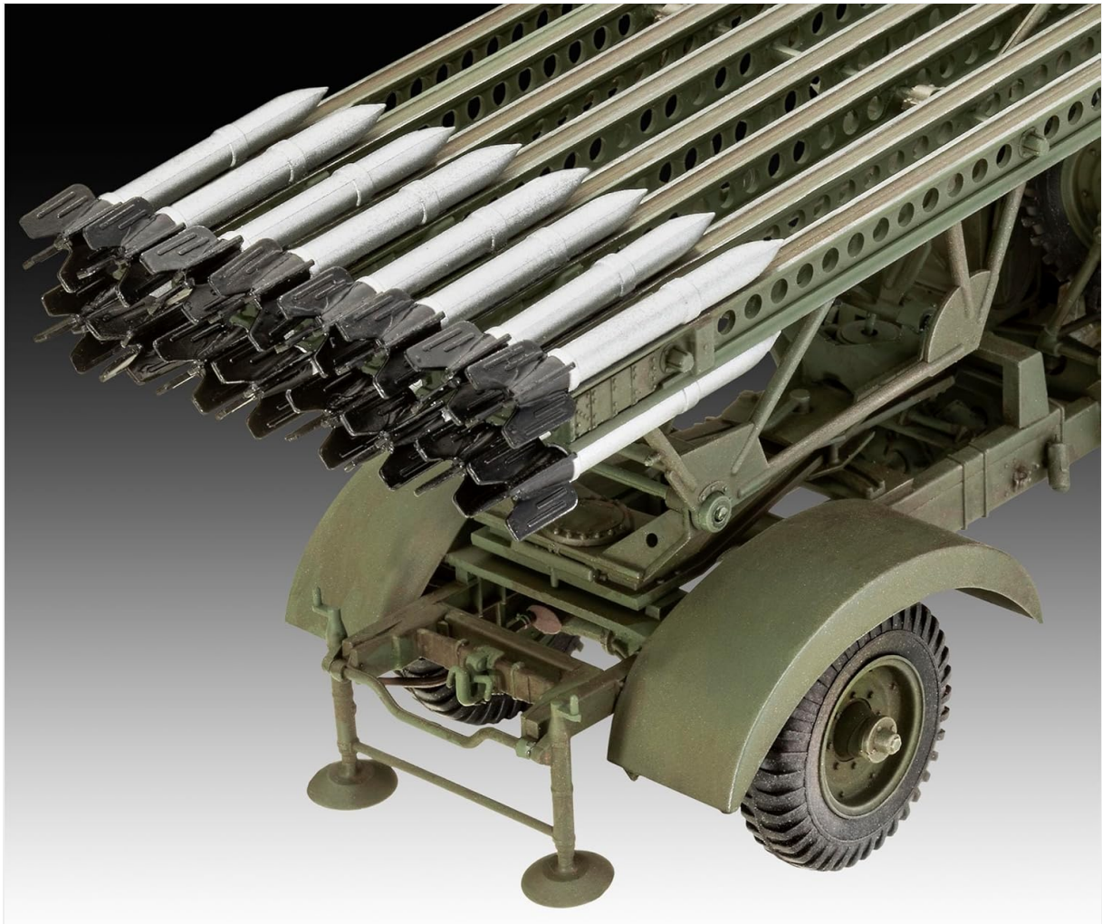
Figure 5: Rear view of the BM-13-16 Katyusha model, highlighting the rocket launcher and individual rockets.