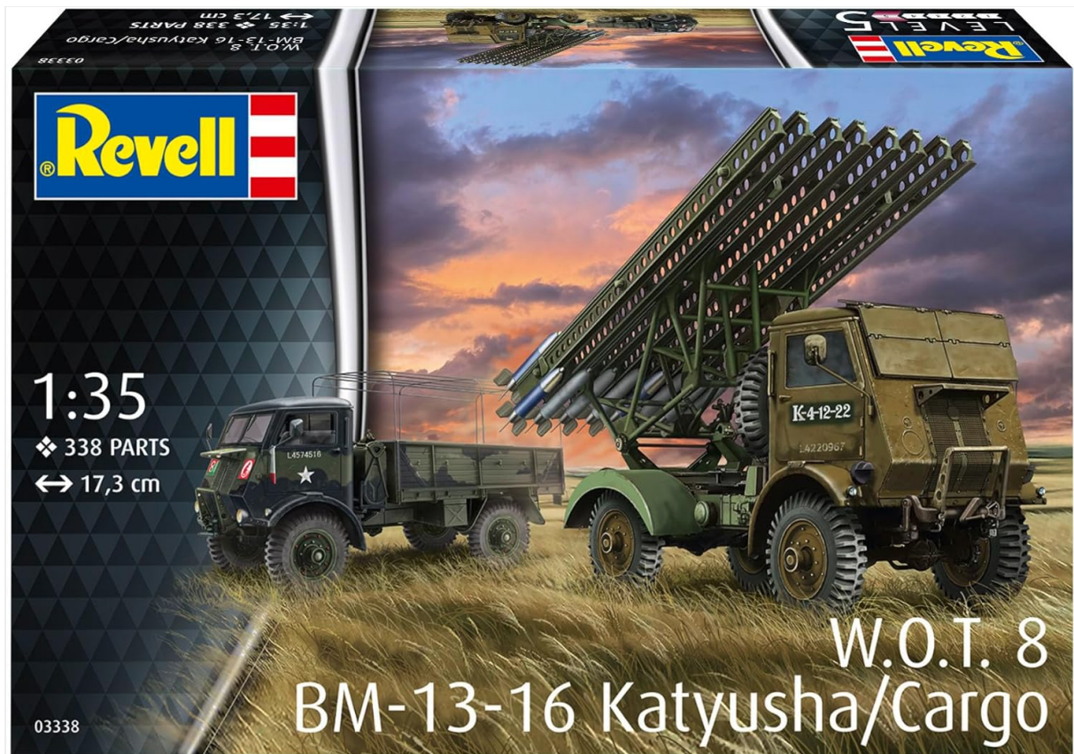
Figure 1: Product packaging displaying both the Katyusha and cargo versions of the W.O.T. 8 model.