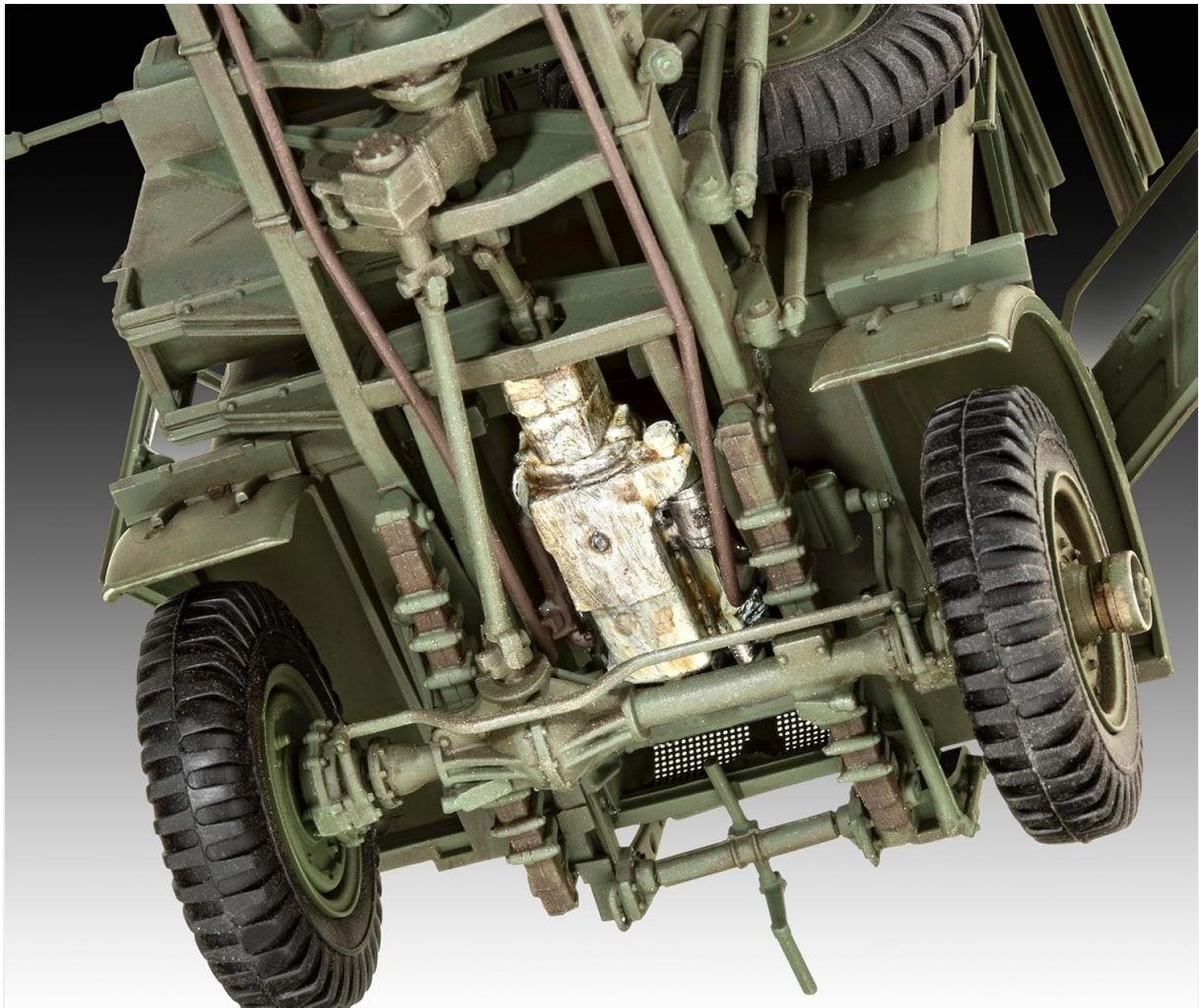
Figure 3: Close-up view of the assembled undercarriage, showcasing the intricate details of the chassis and suspension.