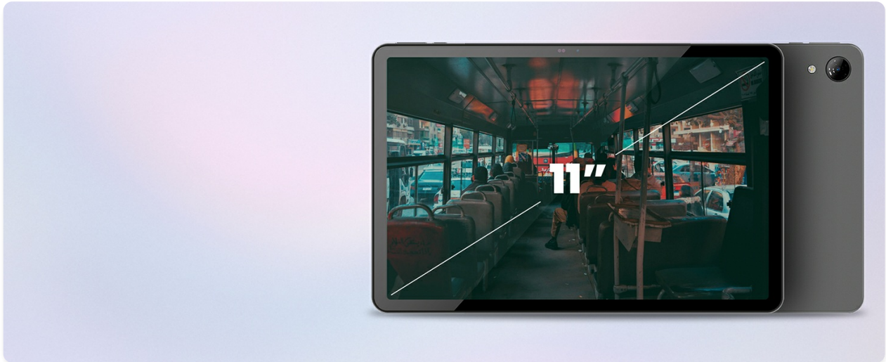
Image: Tablet screen showcasing a vibrant display.

The 11-inch FHD+ InCell display provides crisp images and vibrant colors with a maximum resolution of 1920x1200 pixels and a 60Hz refresh rate. Enjoy multimedia content with clarity and detail.