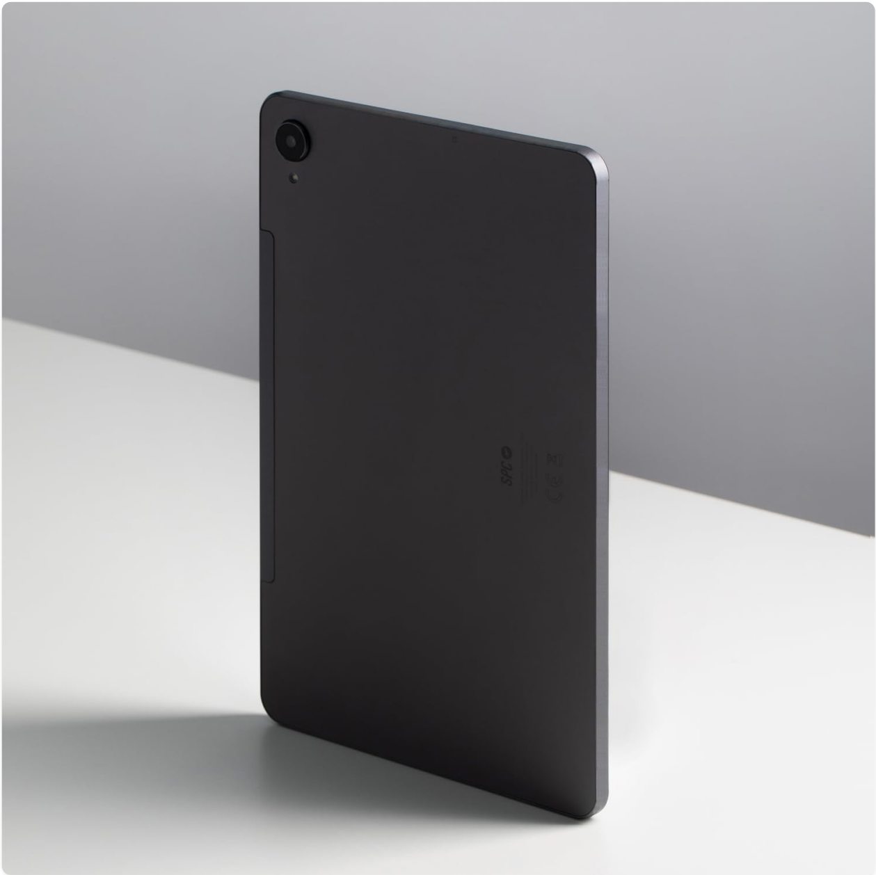
Image: Back view of the SPC Gravity 5 Pro tablet.