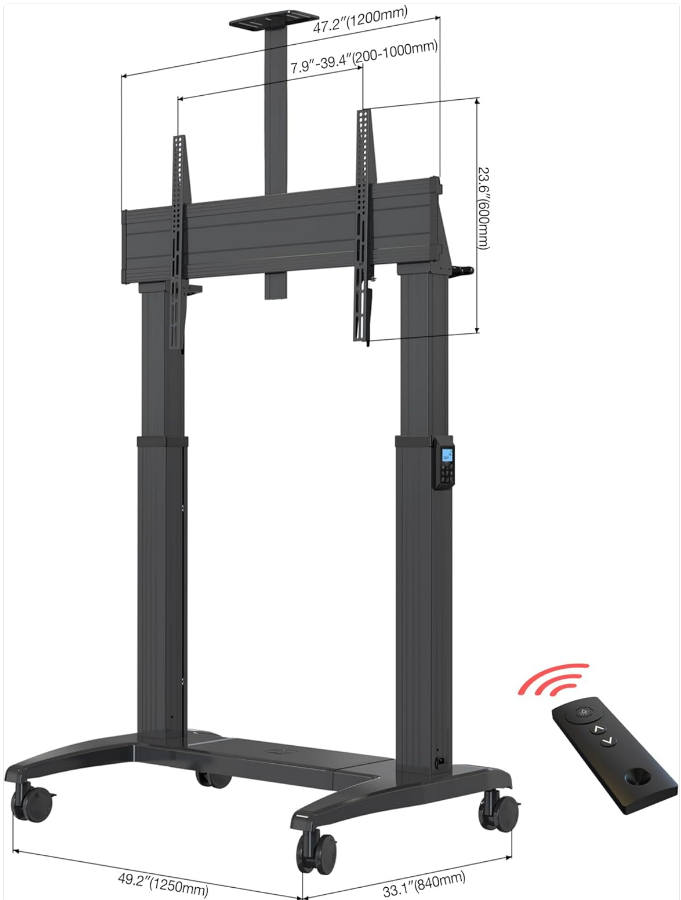
Image 4.1: Diagram illustrating the dimensions of the TV cart, including the base, columns, and TV mounting area, along with the remote control.