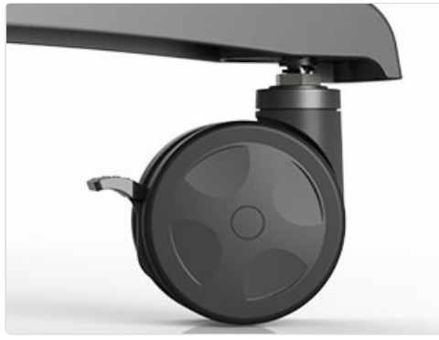
Image 4.2: Close-up view of a caster wheel, highlighting its locking mechanism for stability.