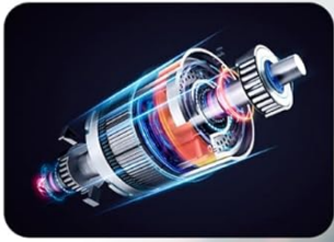
Strong and durable DC motor