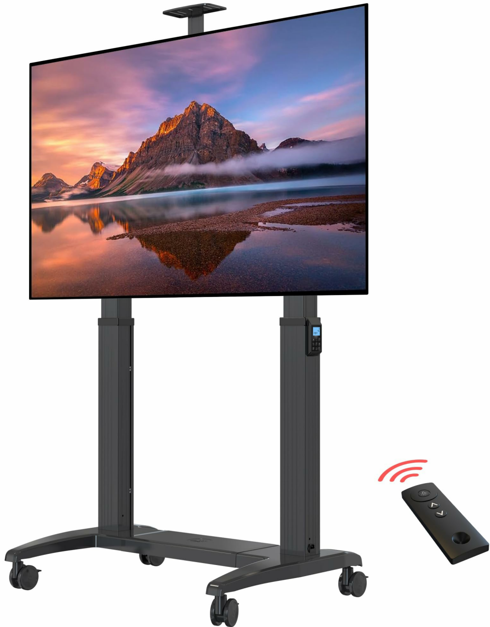
Image 1.1: NB ERGONOMIC A80 Motorized Mobile TV Cart with a large TV screen, showcasing its wide TV compatibility, load capacity, and VESA mounting options.