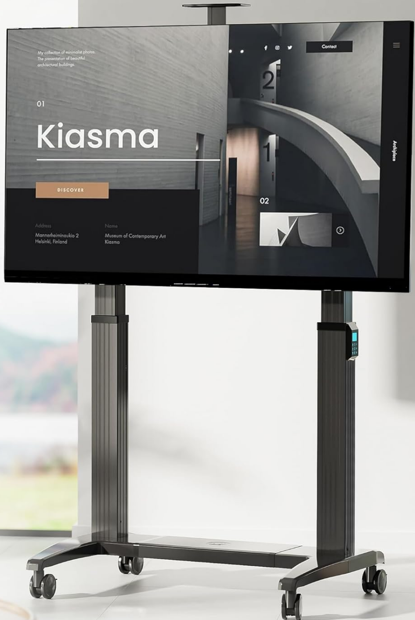
Image 6.1: Visual representation of the TV cart's compatibility, showing supported screen sizes (75"-120"), load capacity (300 lbs), and VESA mounting range (Min: 200x200mm, Max: 1000x600mm).