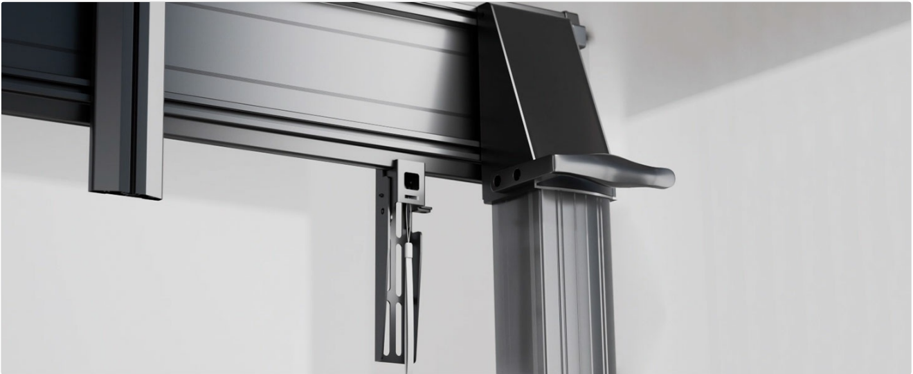
Image 4.3: Illustration of the cable management system within the TV cart's base, ensuring a tidy setup.