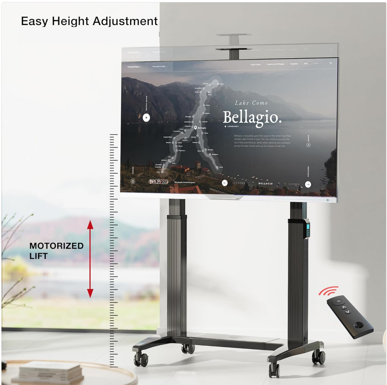
Image 5.1: The motorized TV cart demonstrating its height adjustment feature, controlled by a remote, allowing for easy positioning of the screen.