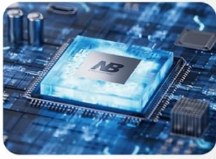
Intelligent control chip