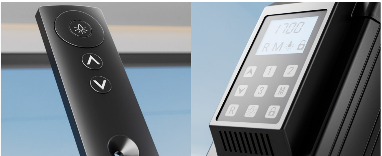
Image 5.2: Detailed view of the remote control and the integrated control panel, showing buttons for height adjustment and memory presets.